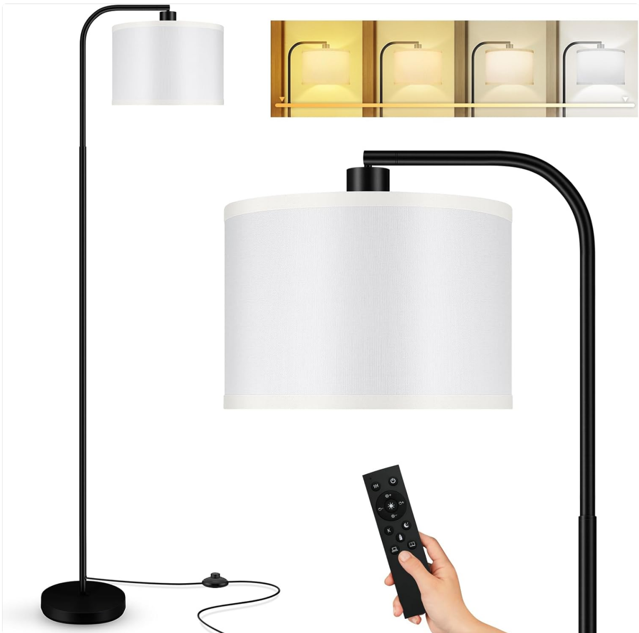
Image 1.1: The BoostArea Dimmable Floor Lamp, showcasing its arc design, white lampshade, and included remote control. An inset image displays the range of color temperatures from warm white to cool white.