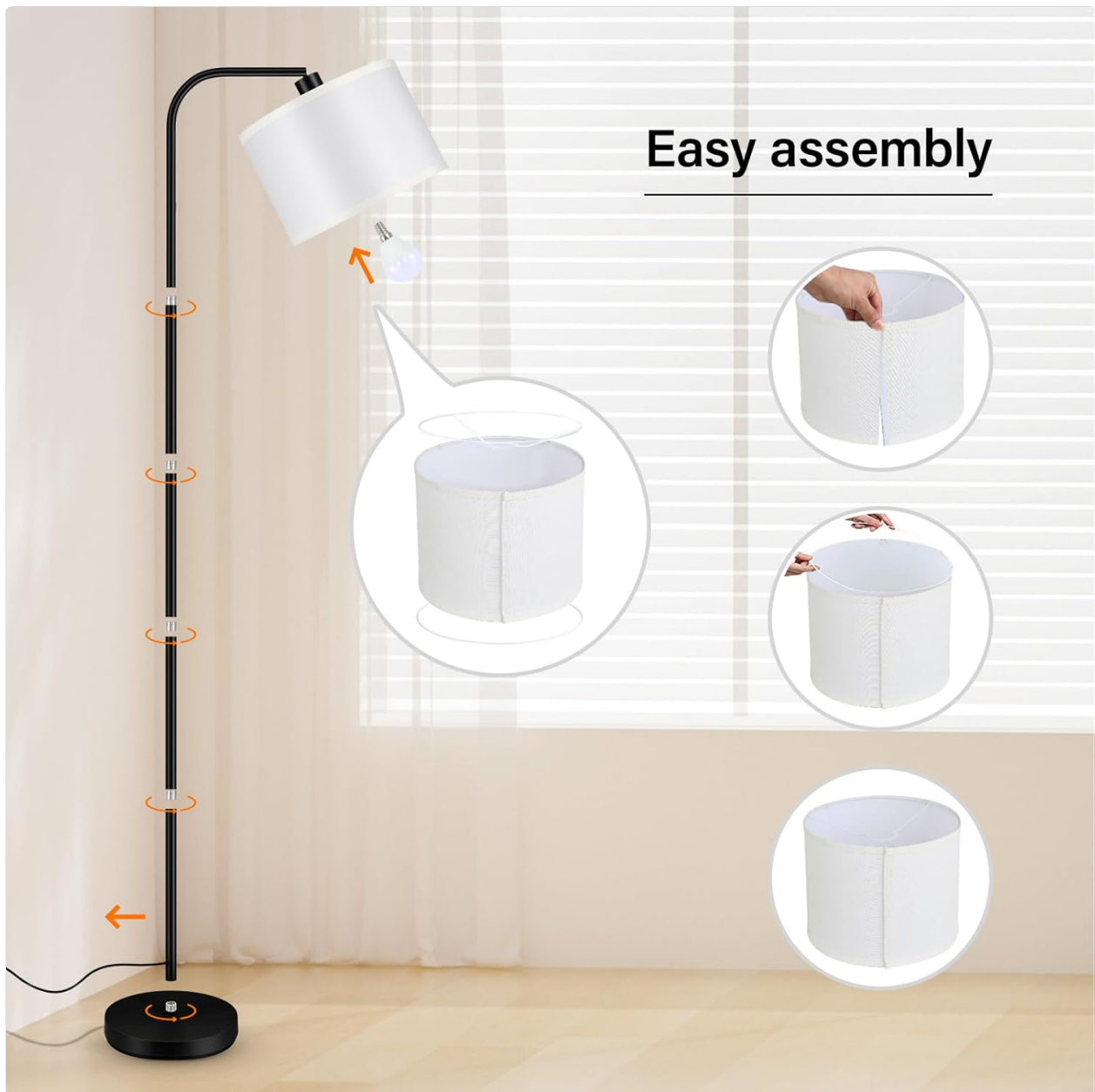
Image 3.1: Visual instructions detailing the six steps for assembling the floor lamp, from installing the lampshade to screwing in the bulb.