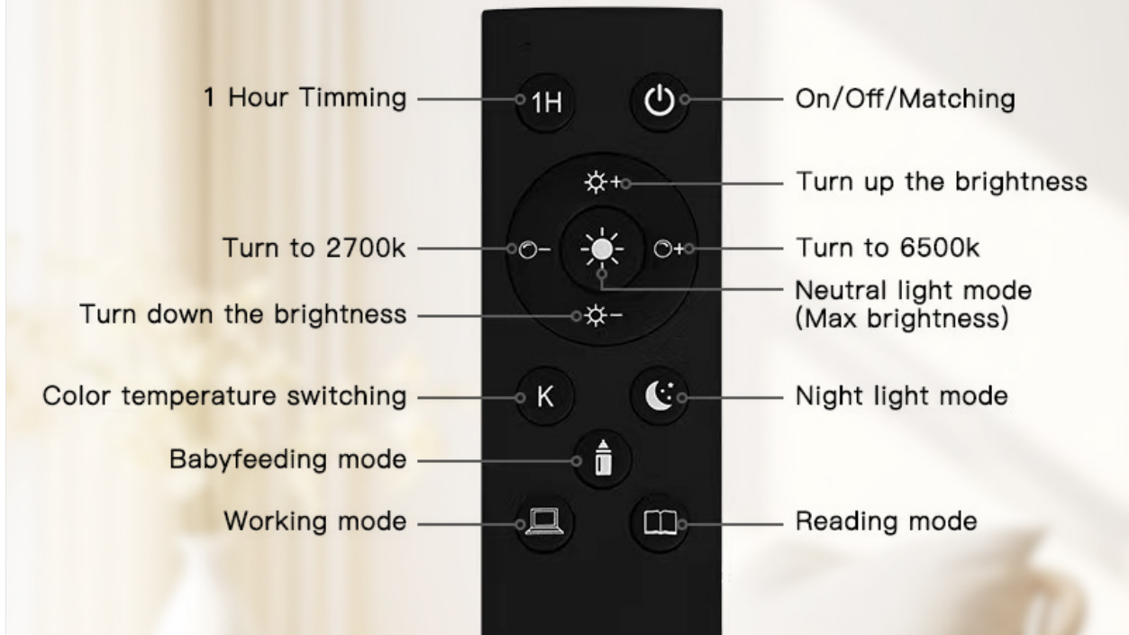
Image 4.6: A detailed diagram of the remote control, labeling each button and its corresponding function, including 1-hour timing, on/off, brightness adjustment, color temperature adjustment, and various preset modes.