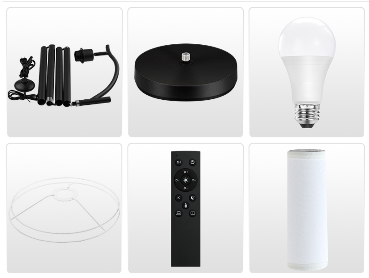
Image 2.1: A visual representation of all components included in the package, such as the lamp poles, base, bulb, remote control, and lampshade.