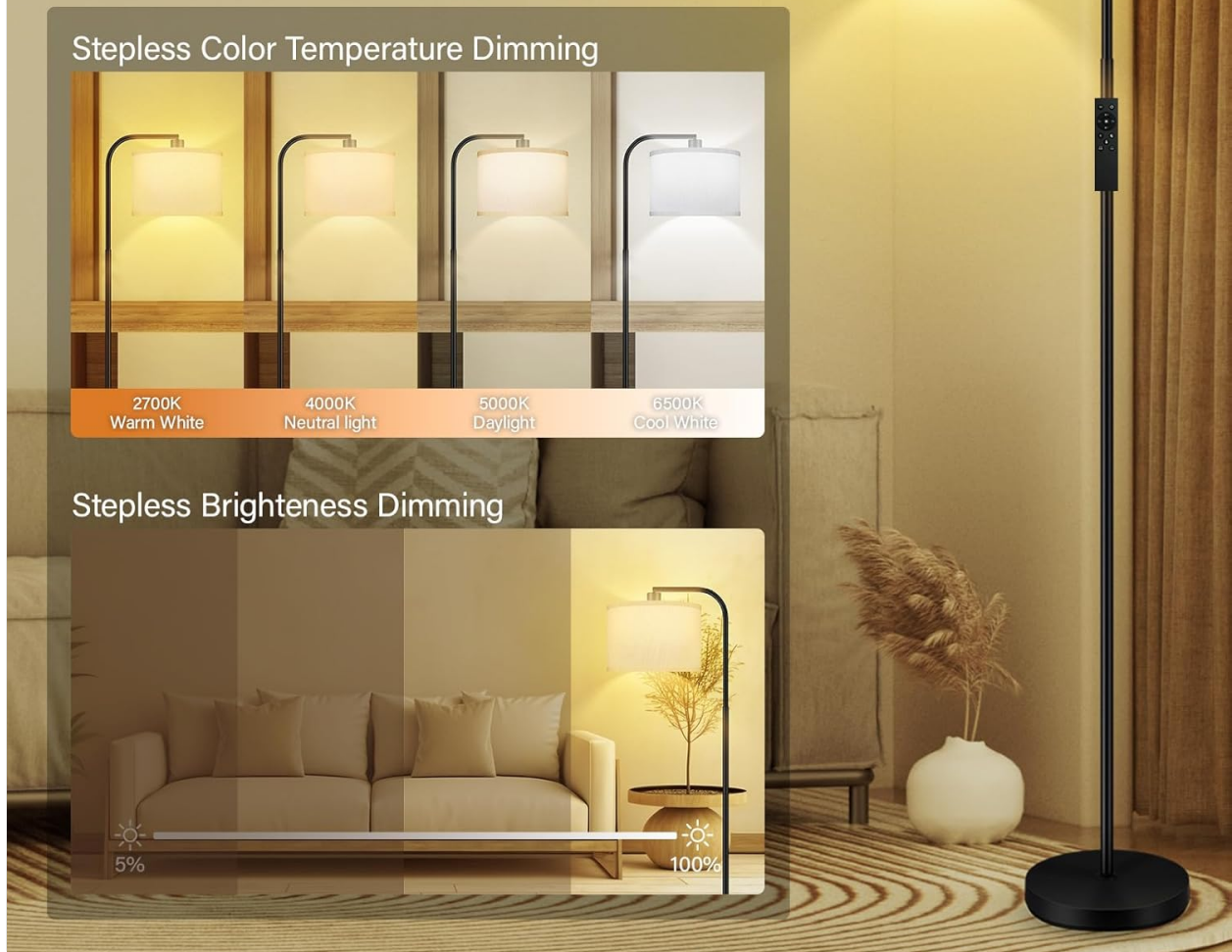
Image 4.2: This image displays the lamp's ability to adjust both color temperature (2700K Warm White, 4000K Neutral Light, 5000K Daylight, 6500K Cool White) and brightness (5% to 100%).