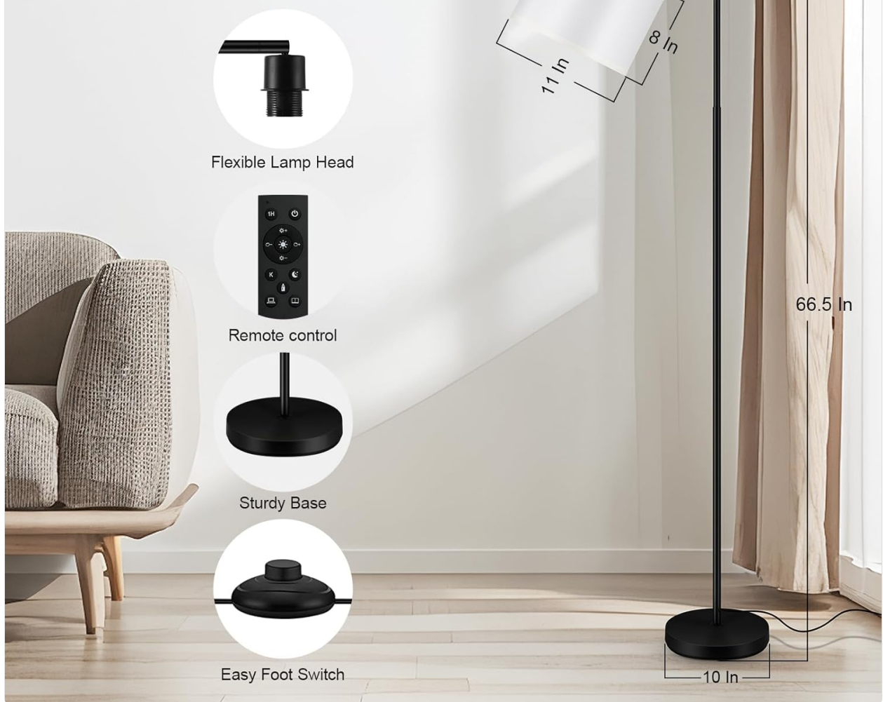
Image 7.1: A diagram illustrating the dimensions of the floor lamp (66.5 inches height, 10 inches base diameter, 17.3 inches arc extension) and highlighting key features like the flexible lamp head, remote control, sturdy base, and easy foot switch.

Classic design, more stability and durability