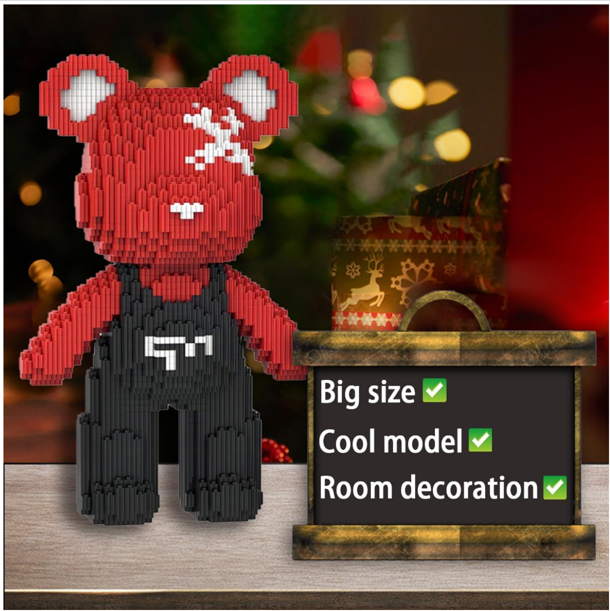
Image: The Red Bear figure displayed next to a sign highlighting its attributes: big size, cool model, and suitability for room decoration.