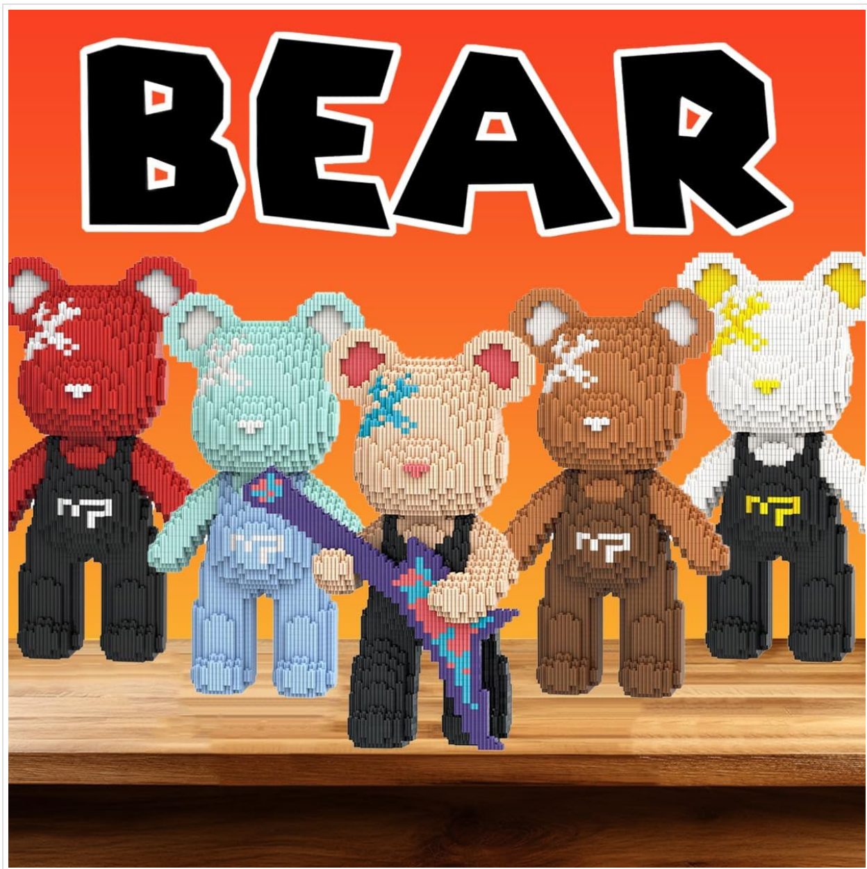
Image: A group photo of five different bear building block figures, including the Red Bear, showcasing the complete collection.