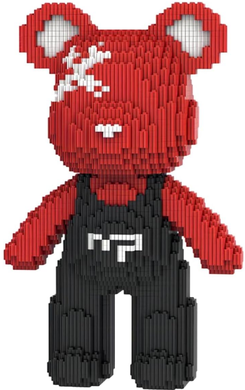
Image: The fully assembled Red Bear Micro Building Blocks figure, showcasing its intricate design and vibrant red and black colors.