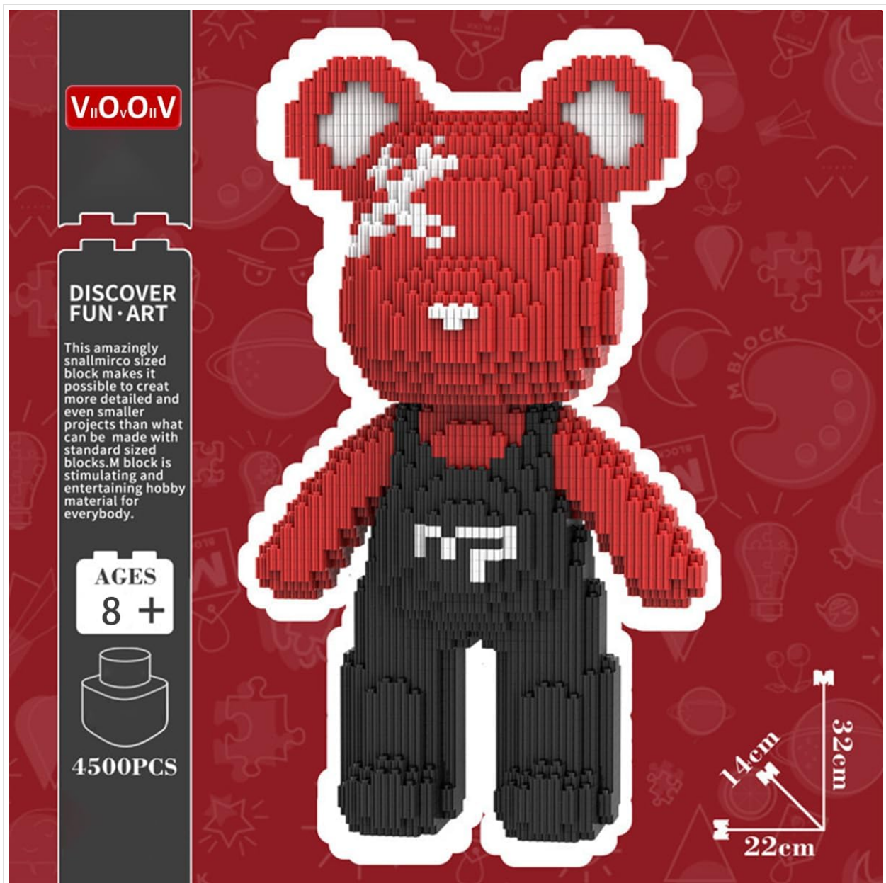
Image: An illustration of the Red Bear figure, emphasizing the creative aspect of building and noting the recommended age of 8+ and the 4500-piece count.