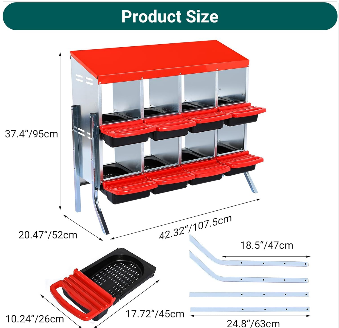
Image: Diagram illustrating the dimensions of the nesting box and its individual components, including the main body, roof, and egg collection trays.

Before beginning assembly, verify that all components are present and undamaged. Refer to the diagram below for identification of parts.