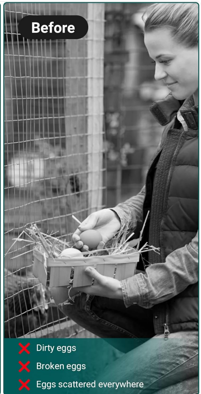
Image: A visual comparison showing the benefits of the GarveeLife nesting box, highlighting clean, complete, and centrally collected eggs compared to dirty, broken, and scattered eggs from traditional methods.