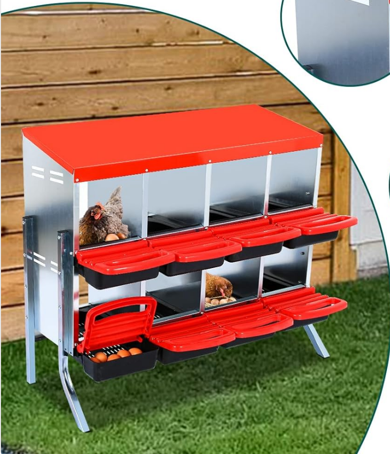
Image: Detailed view of product features, including the egg collection device, strong galvanized steel material, pitched roof for weather protection, and ventilation holes for air circulation.