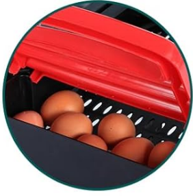
Egg Collection Device