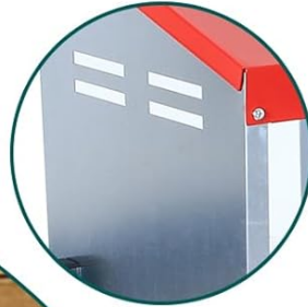
Strong and Durable Galvanized Steel Material