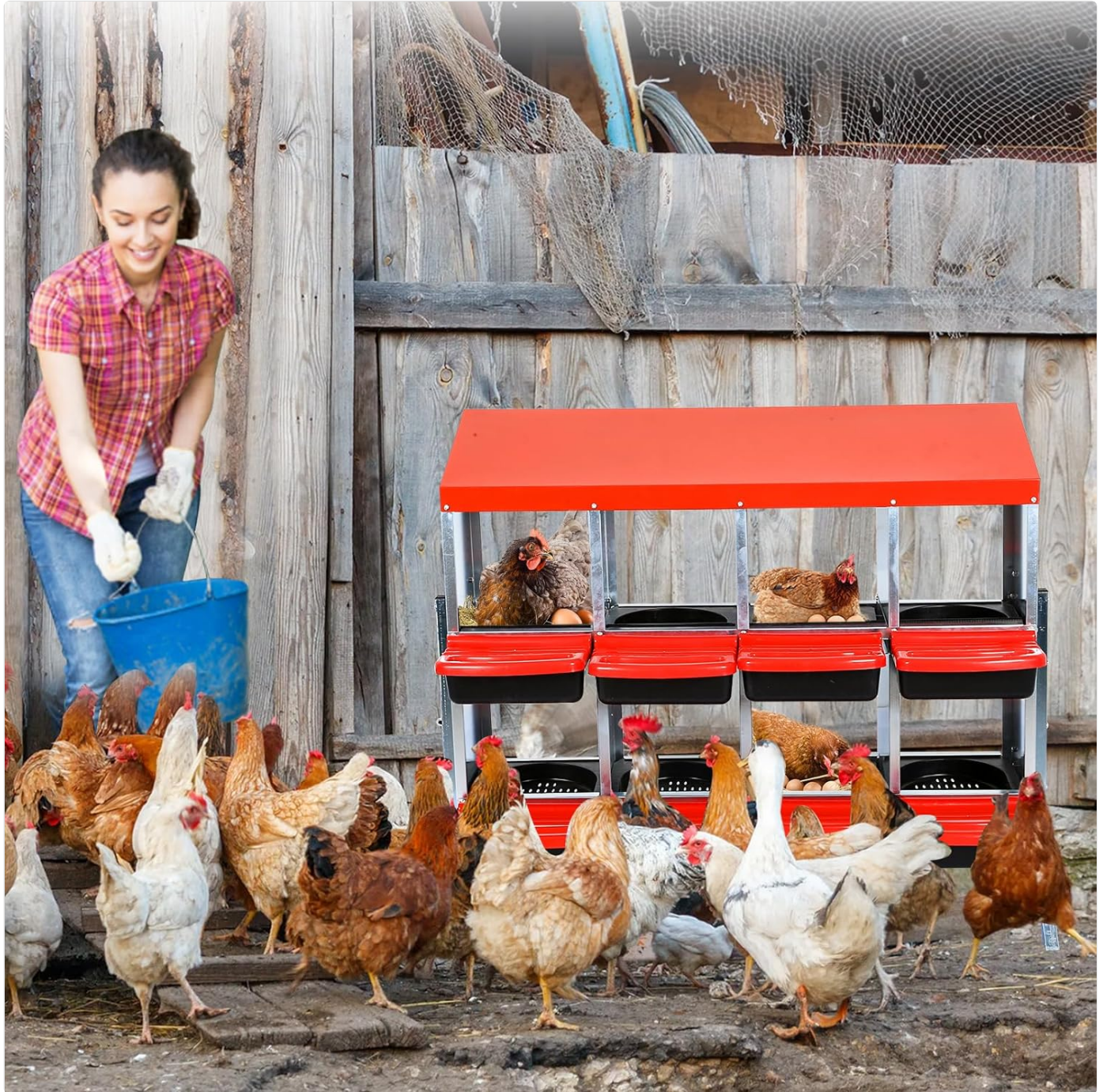
Image: Multiple chickens comfortably utilizing the GarveeLife 8-Hole Nesting Box in an outdoor coop setting, demonstrating its practical application.