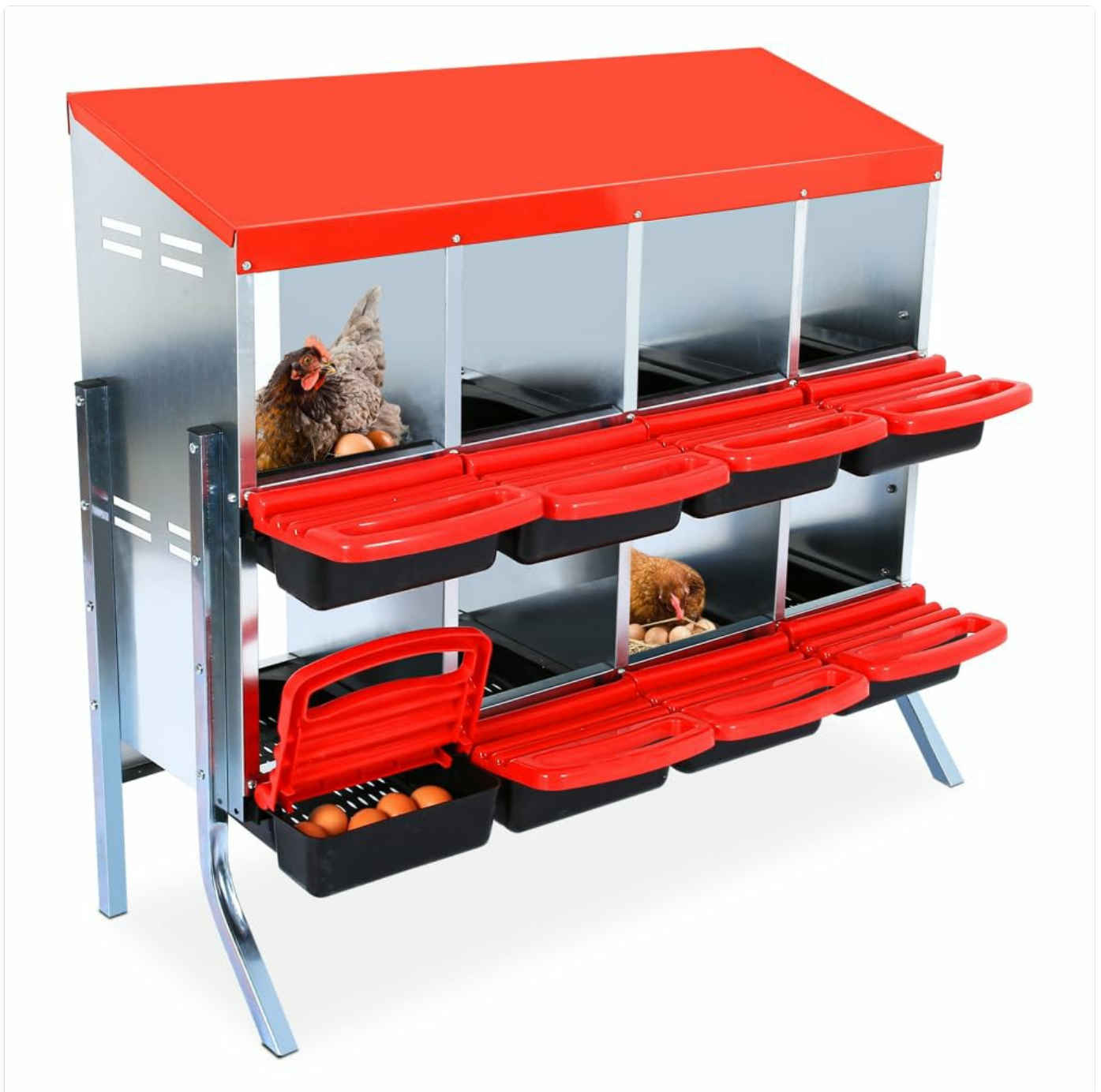
Image: The GarveeLife 8-Hole Chicken Nesting Box, Model LQ007, in red, showcasing its overall design and structure.

Key features of your GarveeLife Nesting Box include: