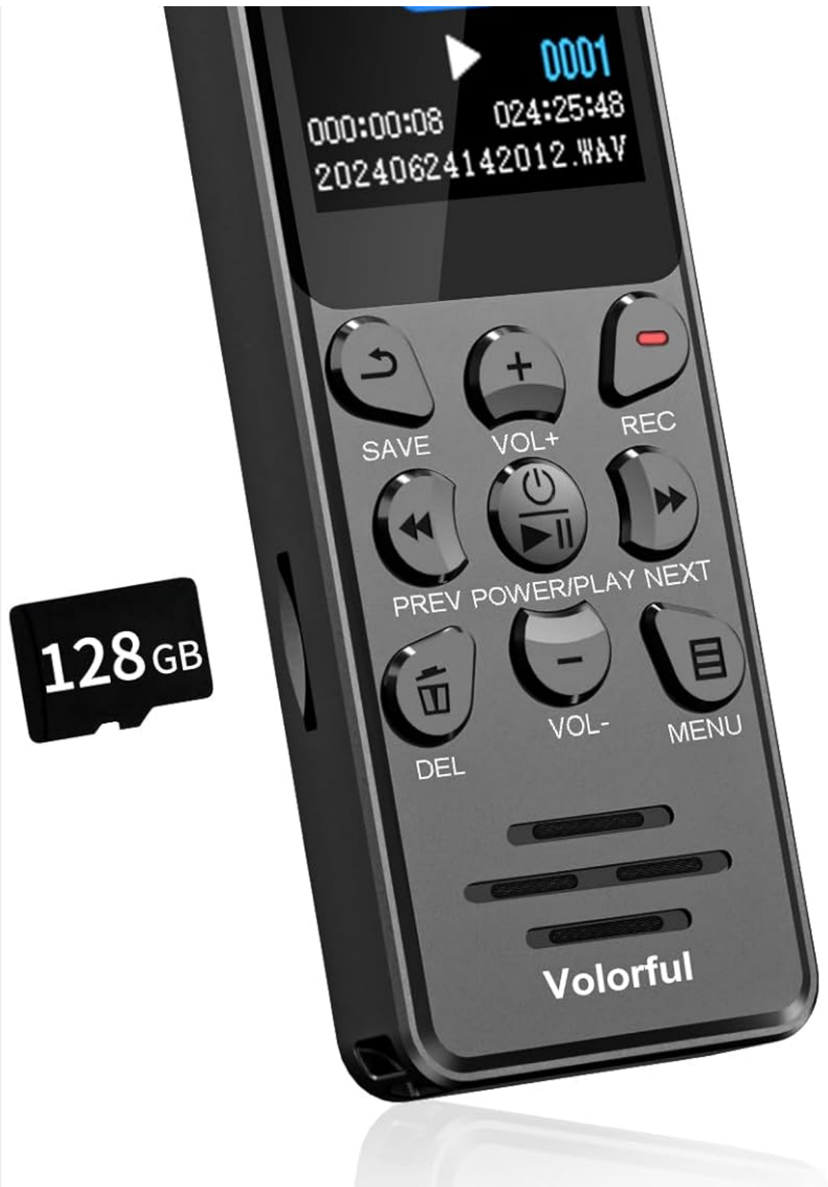
Image: A close-up view of the Volorful V68 Digital Voice Recorder, highlighting its screen, control buttons, and compact form factor. A 128GB microSD card is shown next to it.