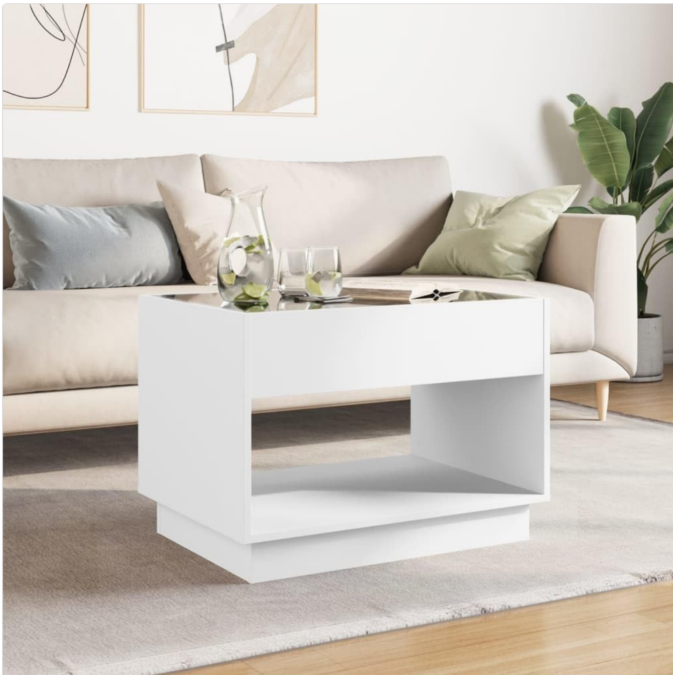
Figure 2: The coffee table integrated into a living room environment, demonstrating its functional use.