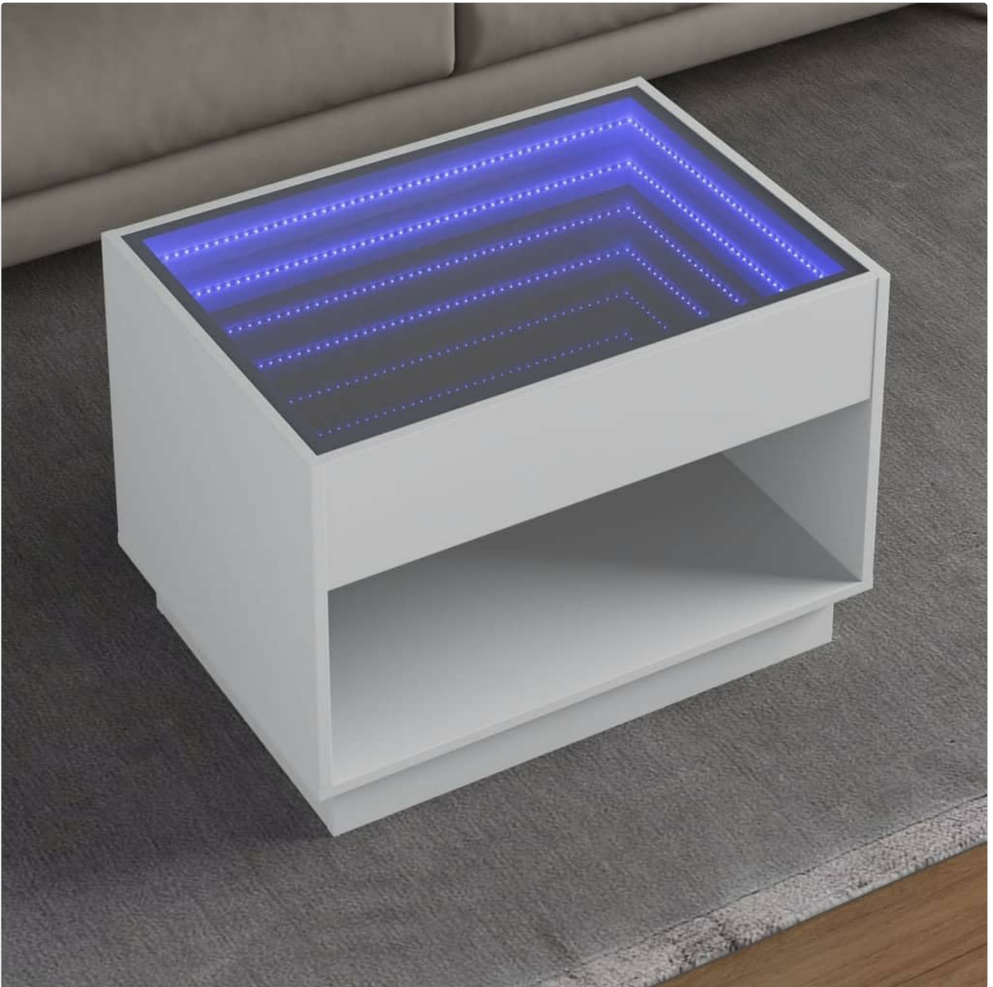
Figure 1: Overview of the INLIFE Infinity LED Coffee Table, showcasing its infinity mirror effect with blue LED lighting.