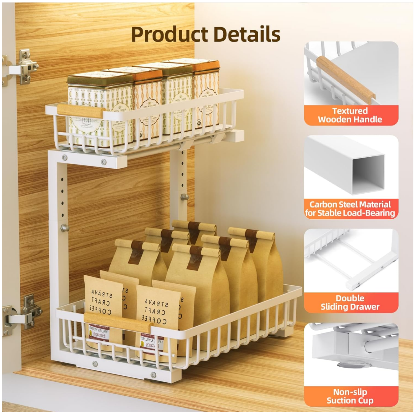
Figure 2.3: Key components and material details of the organizer.