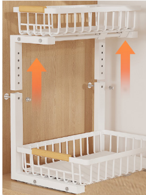
Figure 4.1: Detail of height adjustment points.