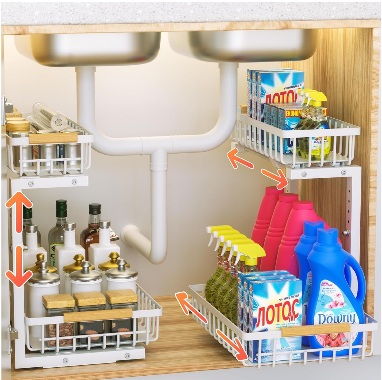
Figure 1.1: Oksoar Under Sink Organizers in use, demonstrating efficient storage.