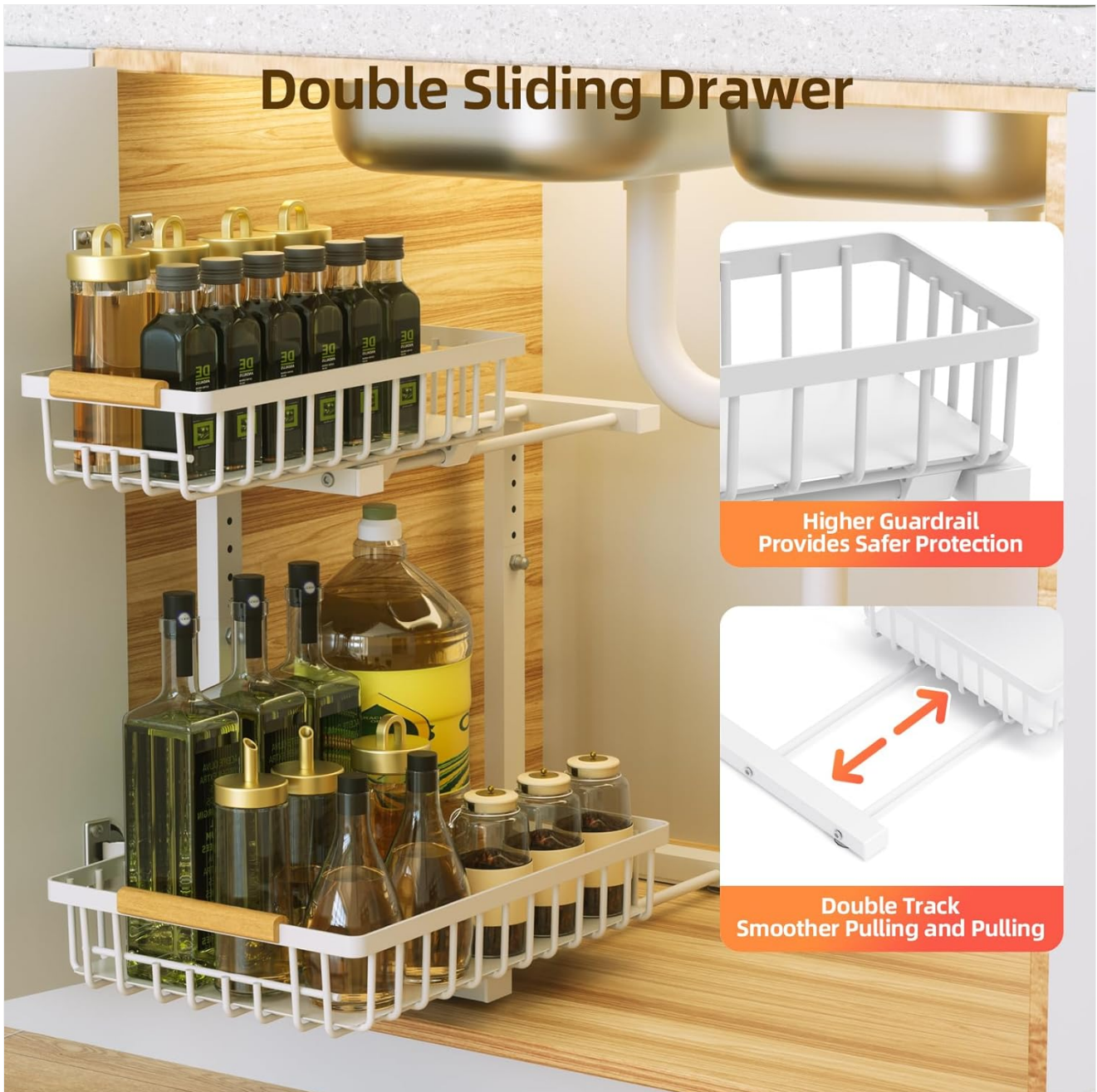
Figure 2.2: Detail of the double sliding drawer and guardrail for secure storage.