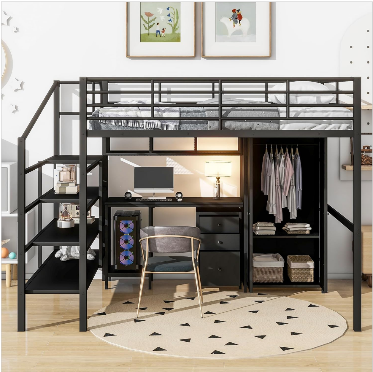
Image 1: Fully assembled loft bed with integrated desk, wardrobe, and storage ladder.