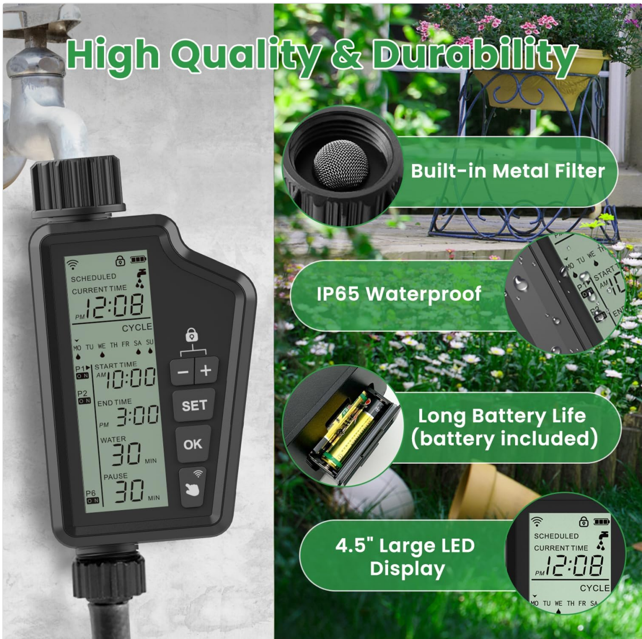
Figure 4.1: Close-up view of the watering timer, illustrating its built-in metal filter, IP65 waterproof rating, long battery life, and 4.5-inch large LED display.