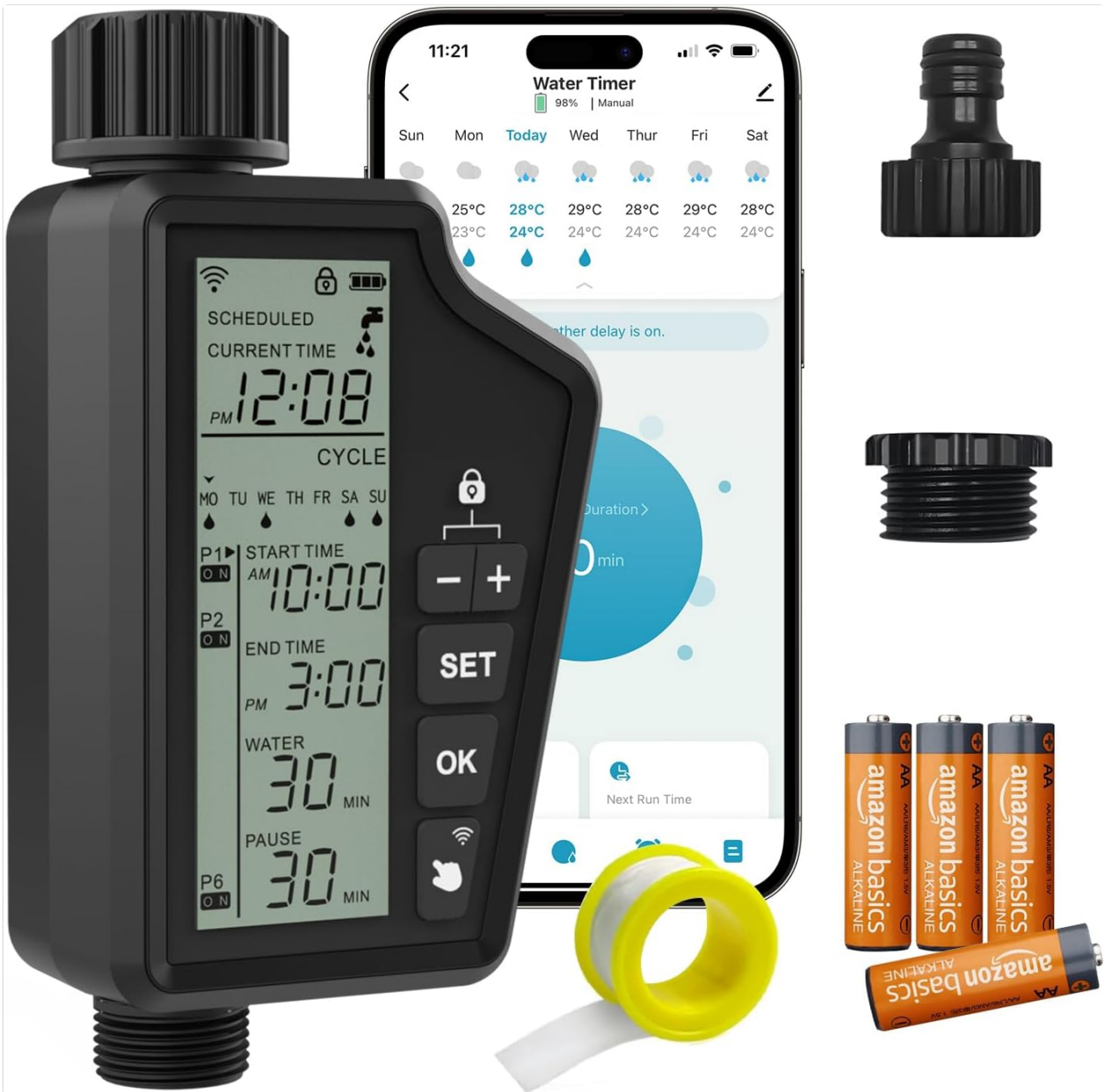
Figure 1.1: MIYOUKE Smart WiFi Watering Timer with its components, including the timer unit, hose adapters, PTFE tape, and four AA batteries.