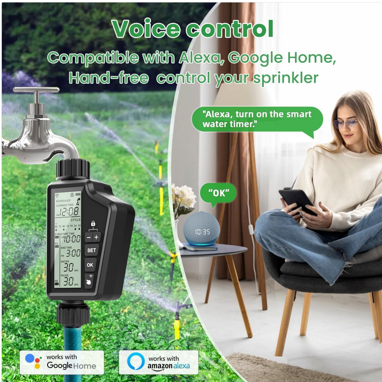
Figure 2.3: A user interacting with a voice assistant (Alexa) to control the Smart WiFi Watering Timer, demonstrating hands-free operation.