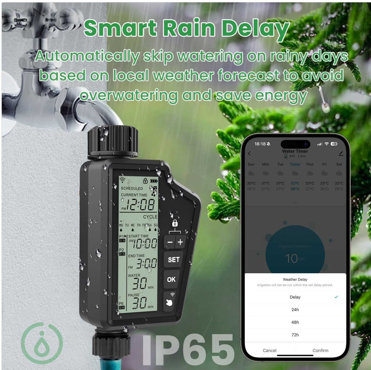
Figure 3.2: The watering timer unit shown with a smartphone displaying the 'Smart Rain Delay' function within the app, allowing users to delay watering for 24, 48, or 72 hours.