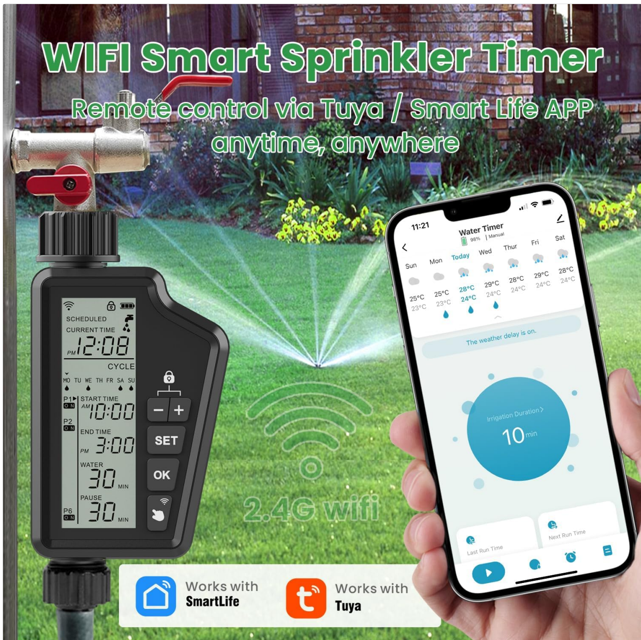
Figure 2.2: The Smart WiFi Watering Timer displaying its interface alongside a smartphone screen showing the Smart Life App for remote control.