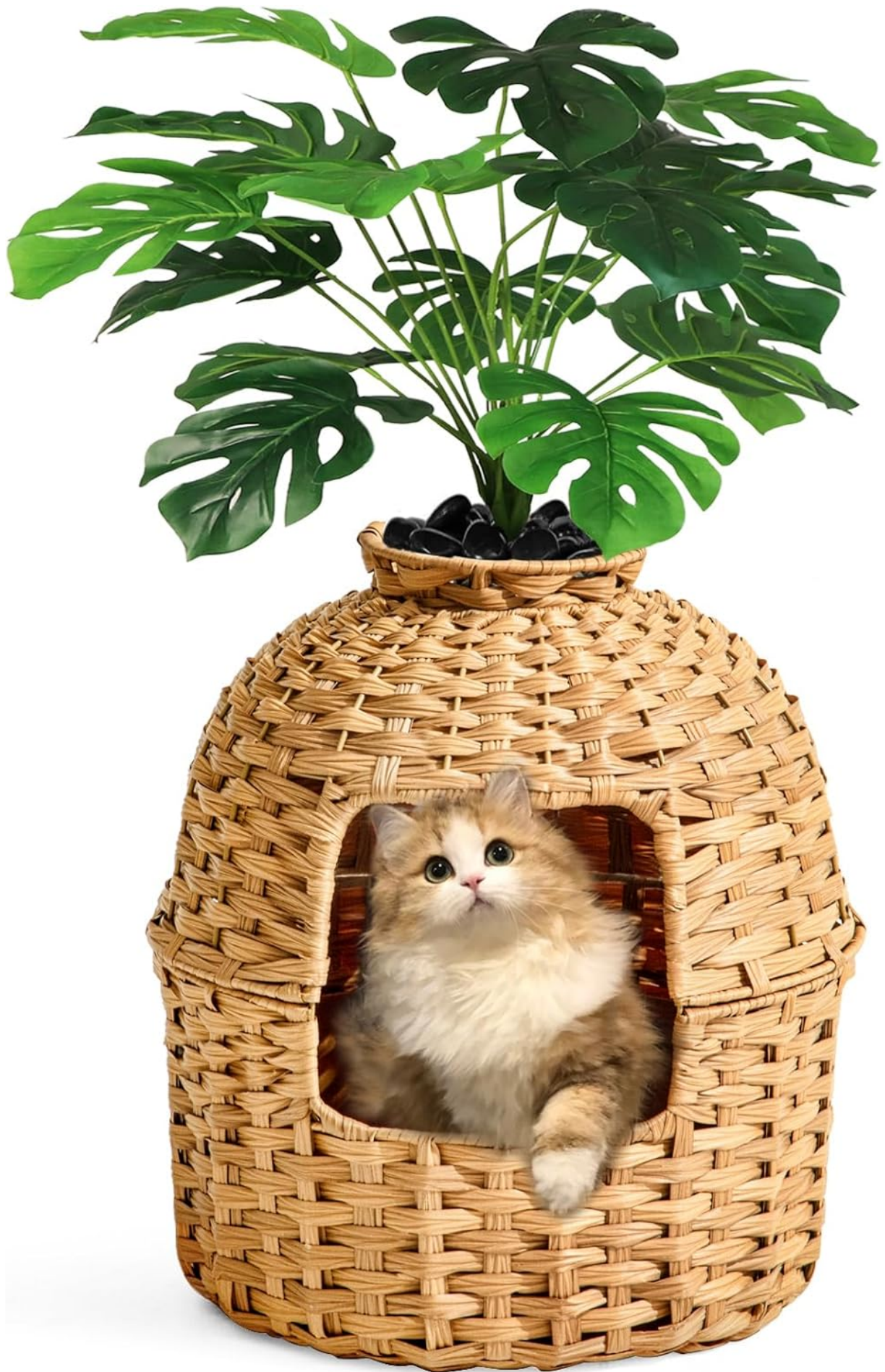
Image: The SETVSON Cat Litter Box Plant Furniture Enclosure, featuring a handwoven rattan design with an artificial plant on top and a cat peeking out from the entrance.

The SETVSON Cat Litter Box Plant Furniture Enclosure is designed to discreetly house a cat litter box