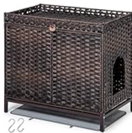
Image: A visual guide demonstrating how to adjust the handwoven rattan if gaps appear, ensuring the structural integrity and appearance of the enclosure.