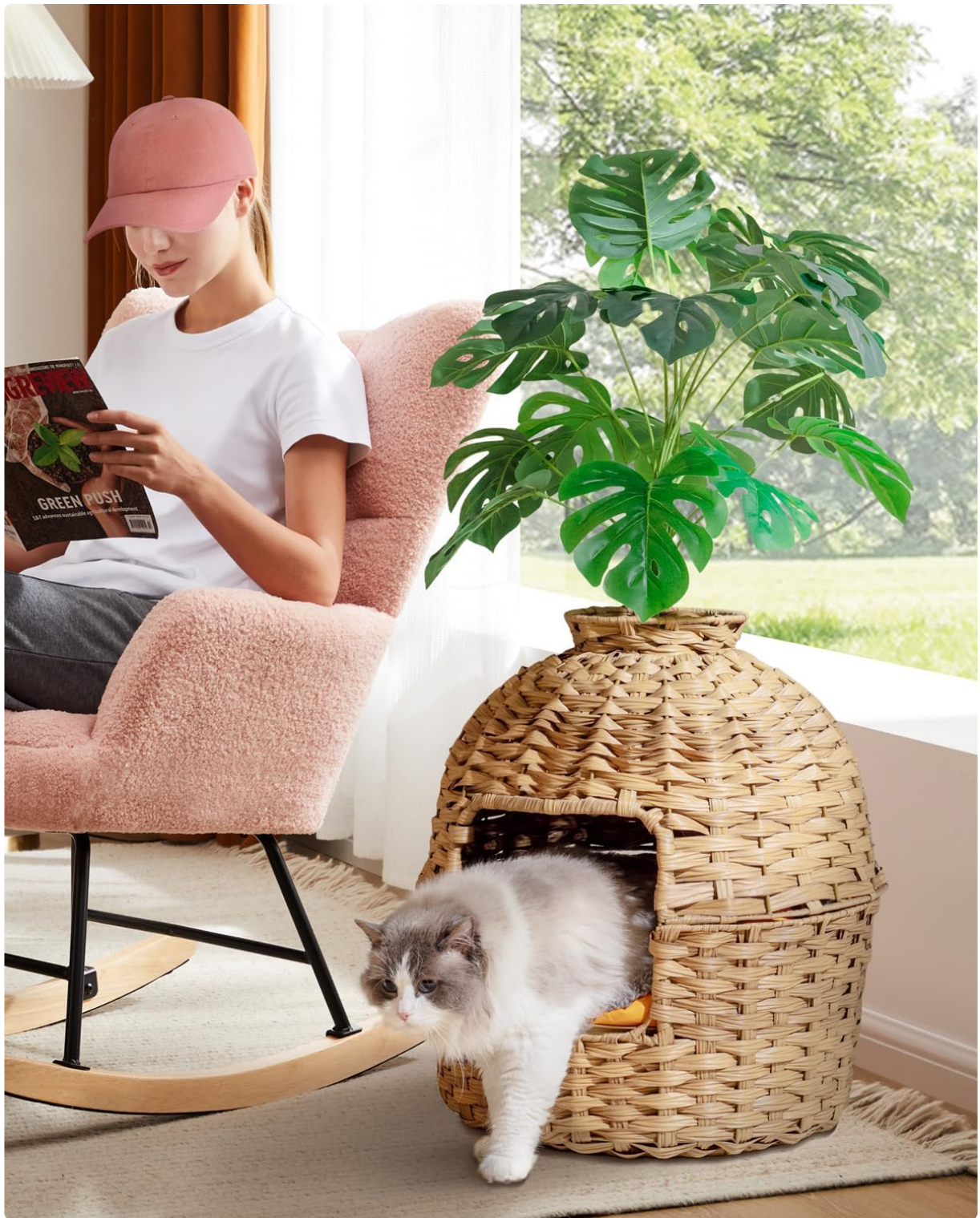
Image: A cat comfortably exiting the enclosure, highlighting the spacious entryway.