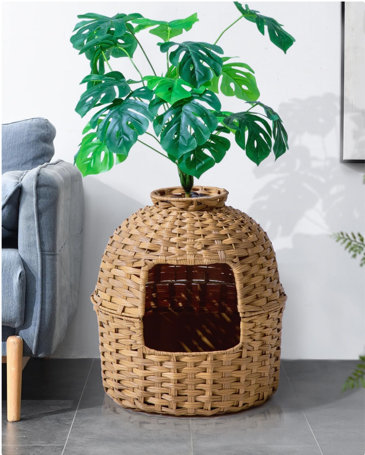
Image: The assembled enclosure positioned in a living space, demonstrating its integration as a piece of furniture.