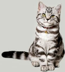
Medium cat 15.7-23.7Inch