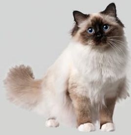
Large cat 23.7-31.5Inch