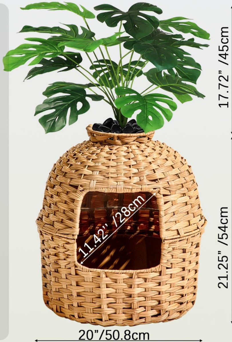
Image: A detailed diagram illustrating the dimensions of the enclosure and providing guidance on suitable cat sizes (small, medium, large).