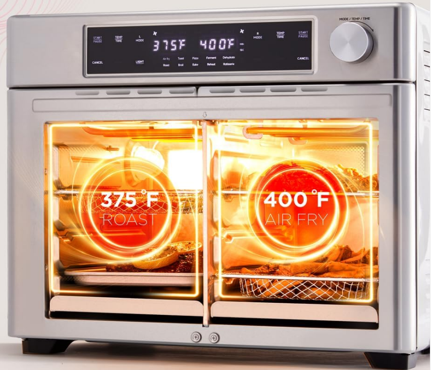
Image: The oven operating in dual cooking zone mode, demonstrating independent temperature control for each side, with one side set to 375°F for roasting and the other to 400°F for air frying.