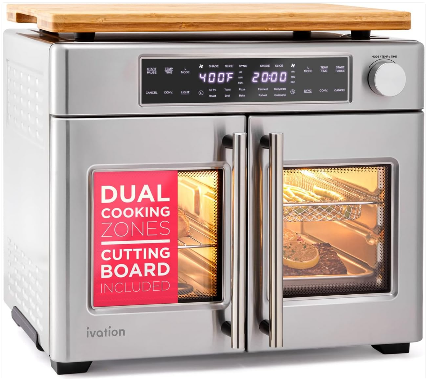
Image: The Ivation Dual Zone Air Fryer French Door Oven, showcasing its stainless steel finish, French doors, and integrated control panel. A wooden cutting board rests on top of the unit.