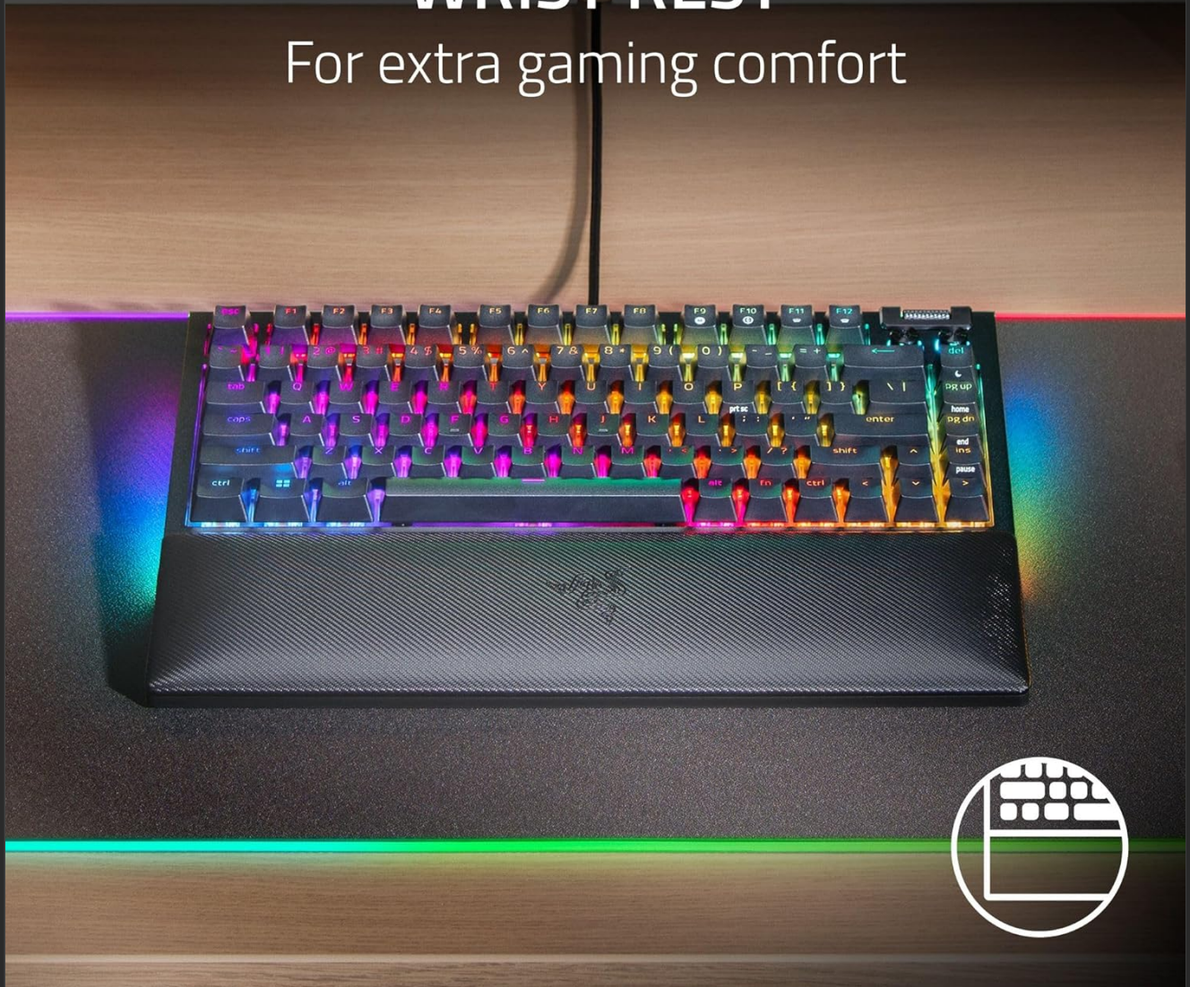
Figure 2: Magnetic Plush Leatherette Wrist Rest for ergonomic support.