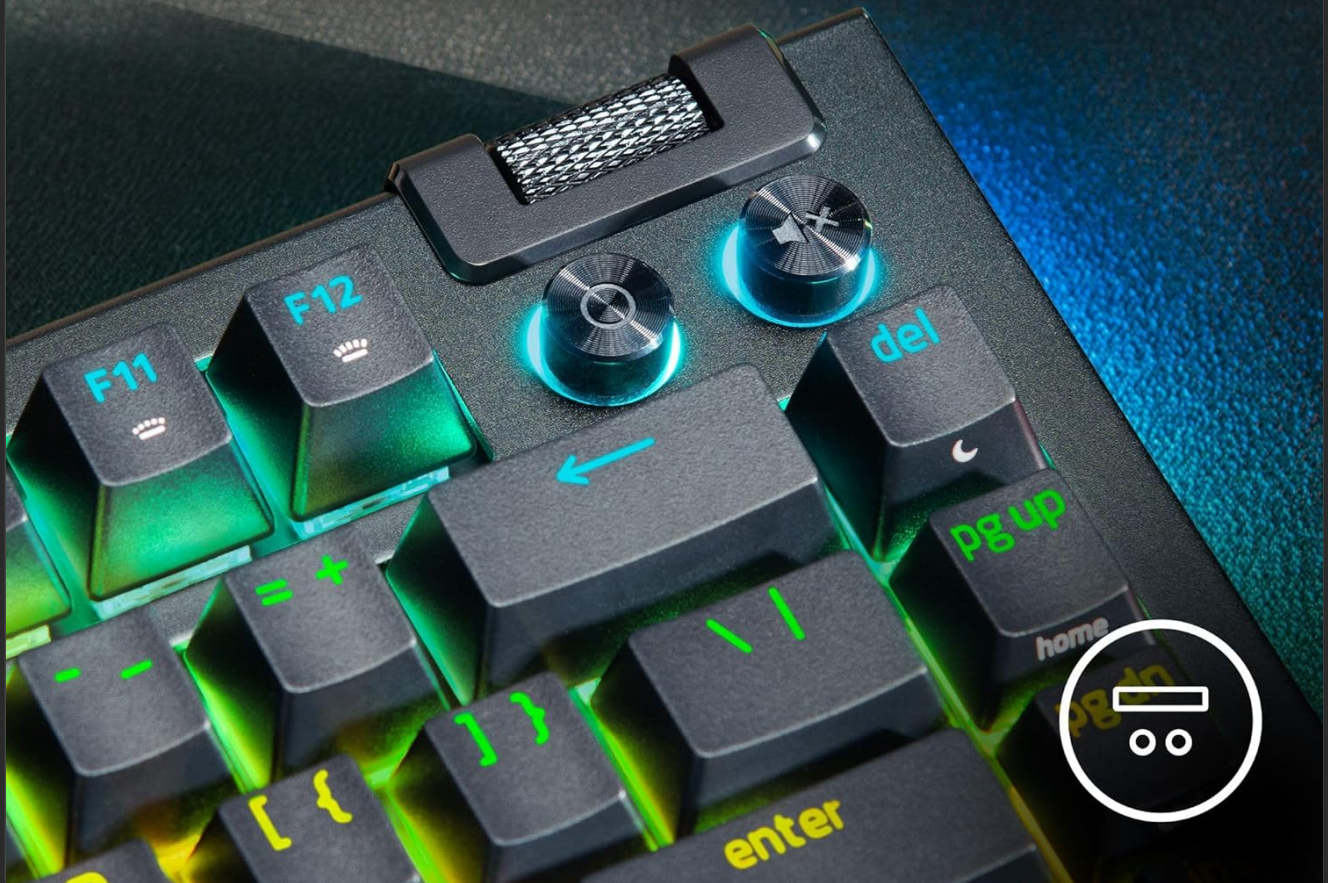
Figure 3: Multi-function roller and media keys for quick adjustments.