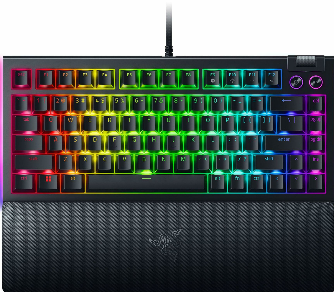
Figure 1: Razer BlackWidow V4 75% Mechanical Gaming Keyboard.