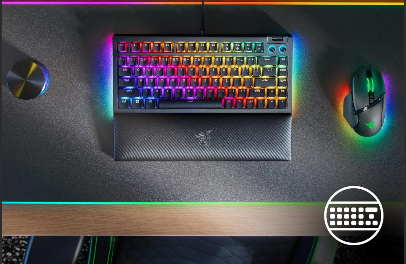
Figure 7: Compact 75% layout for balanced functionality and durability.

For balanced functionality and greater durability