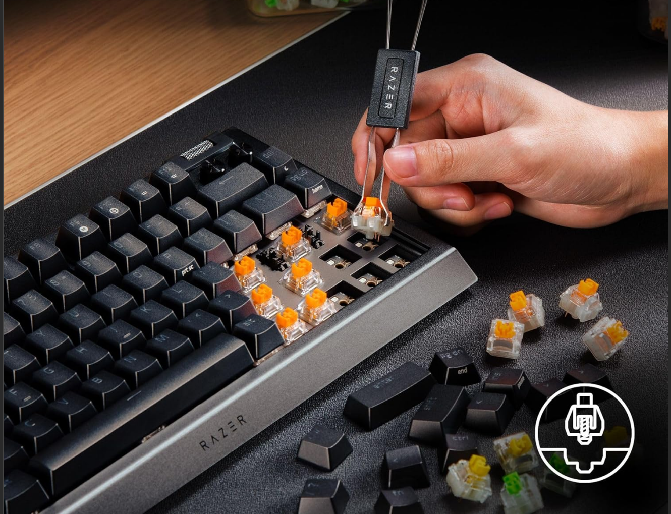
Figure 4: Demonstrating the hot-swappable switch feature.

With pre-loaded Razer Orange Tactile Switches Gen-3