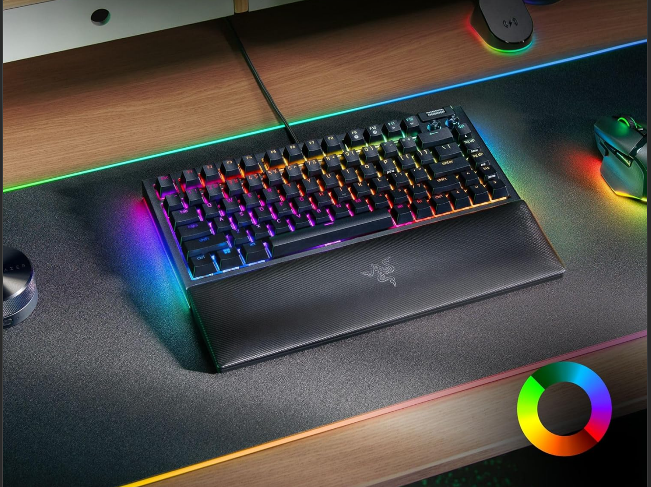
Figure 5: Razer Chroma RGB lighting in action.