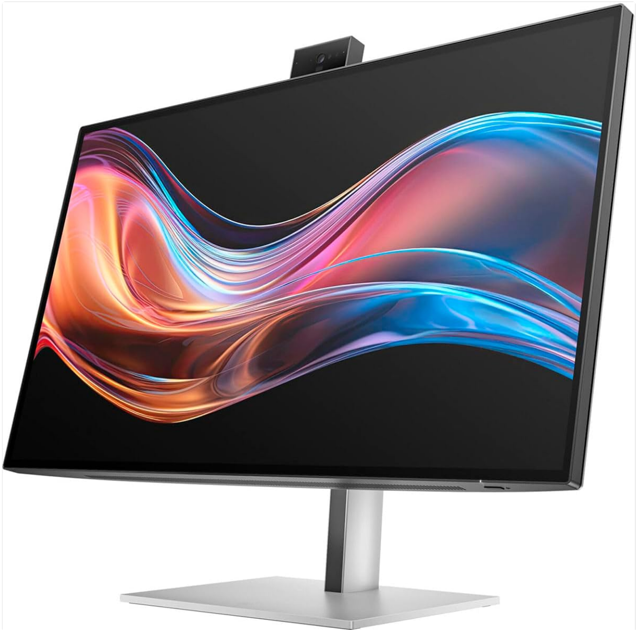
Figure 4.4: Angled view of the HP 727pm monitor, illustrating the flexibility of its stand for tilt and height adjustments.