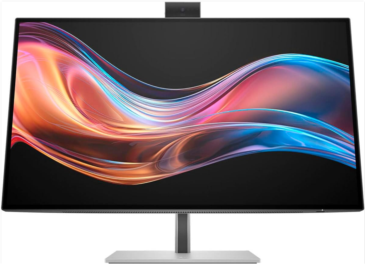
Figure 3.1: Front view of the HP 727pm monitor with its stand fully assembled, ready for use.