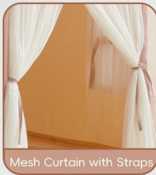
Mesh Curtain with Straps