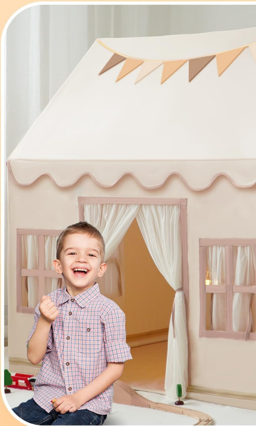
Image: The RONGFA Kids Tent Play House shown with its included accessories: a star light, pennant banners, and a carry bag for portability.