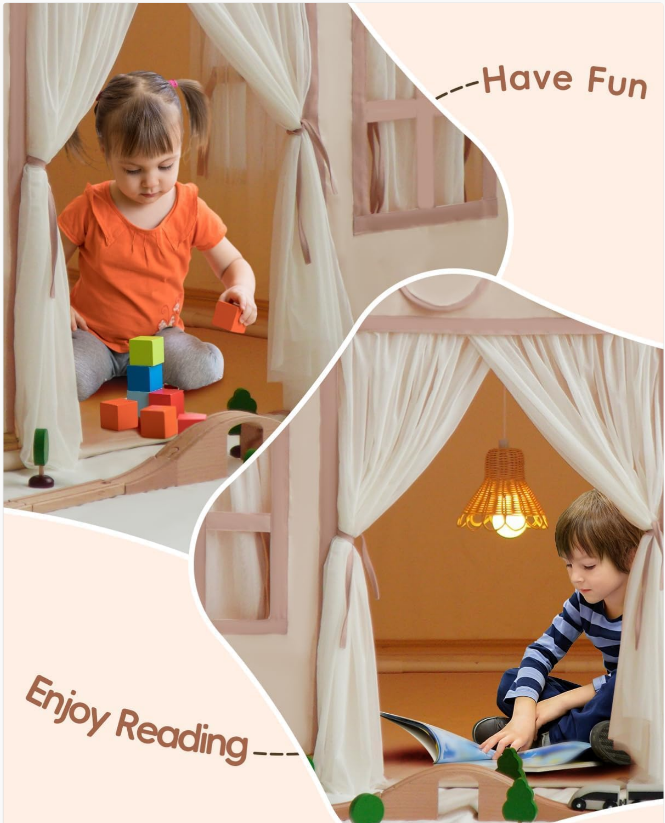
Image: Two scenes showing children engaging in activities inside the tent: one child playing with blocks, and another child reading a book, highlighting the tent's versatility.