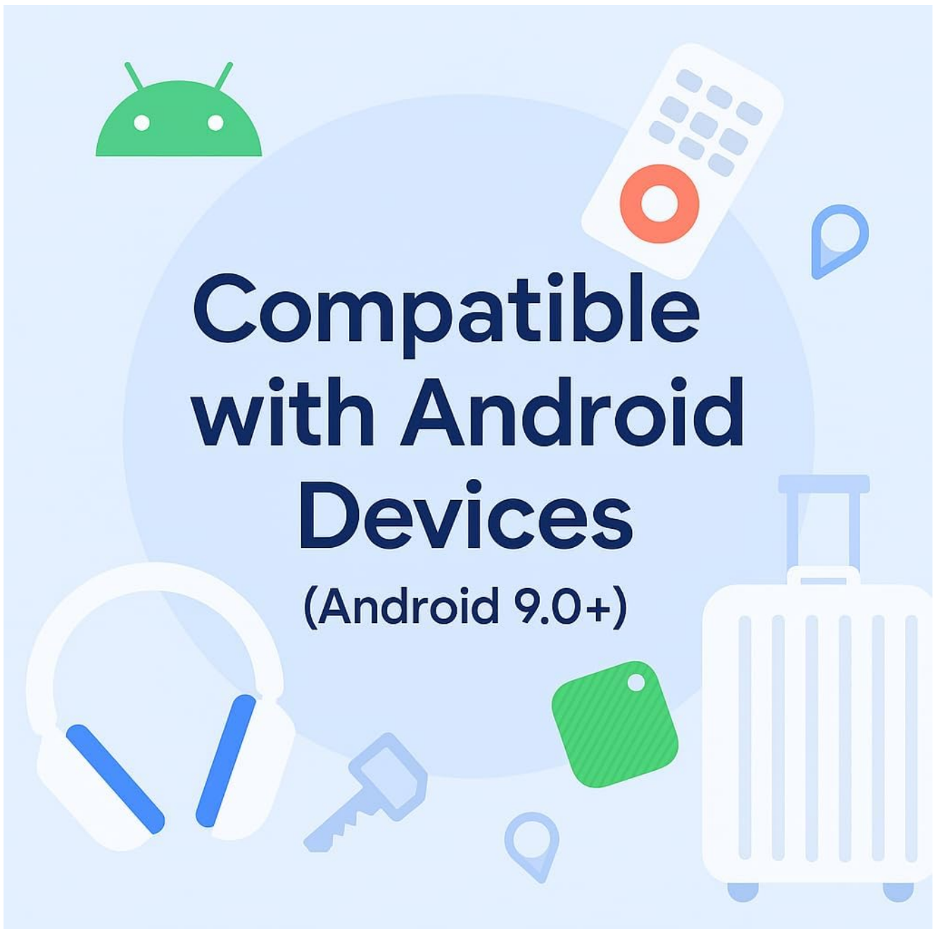
Figure 2: Compatible with Android Devices (Android 9.0+)