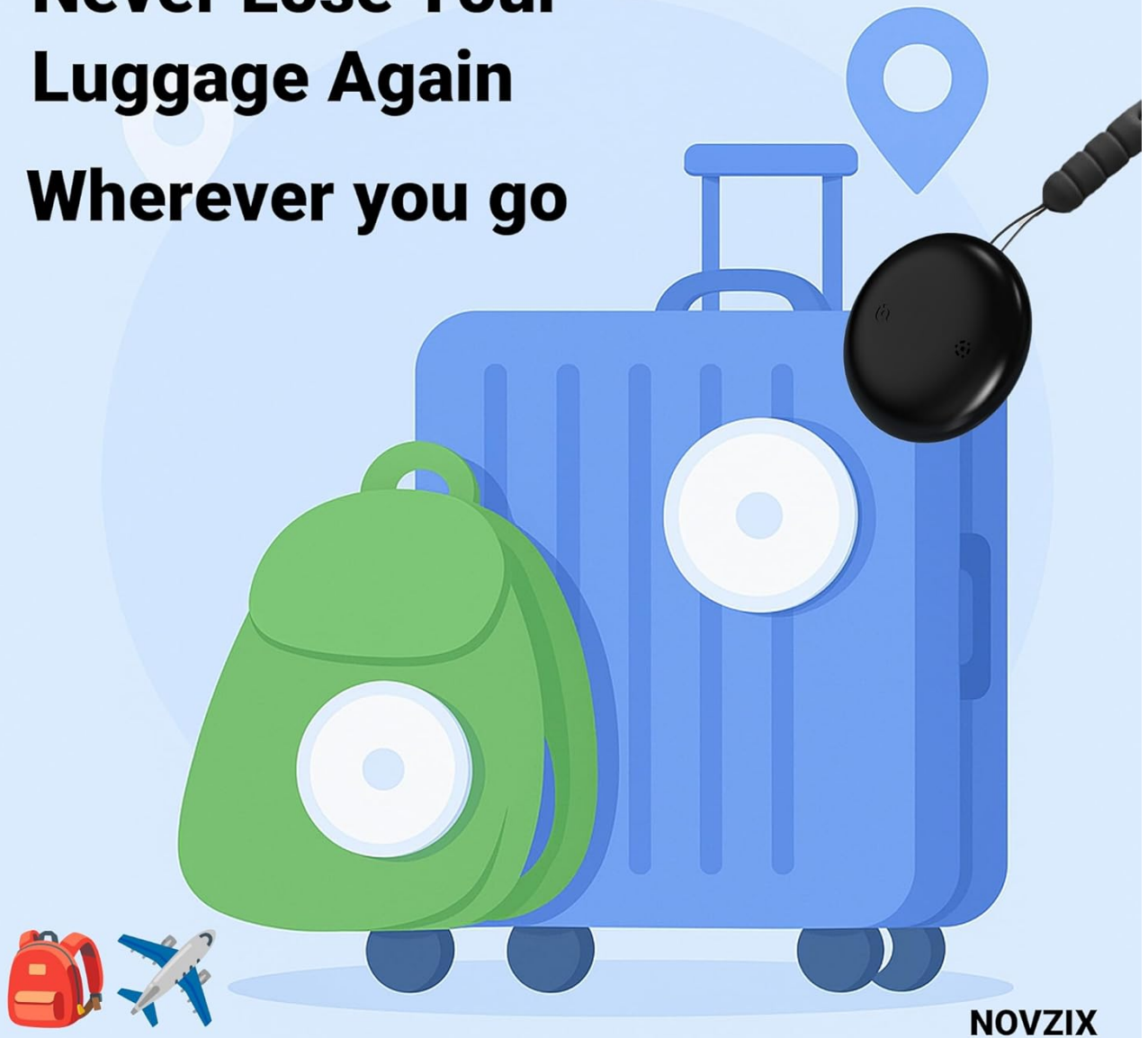
Figure 4: Never lose your luggage again.