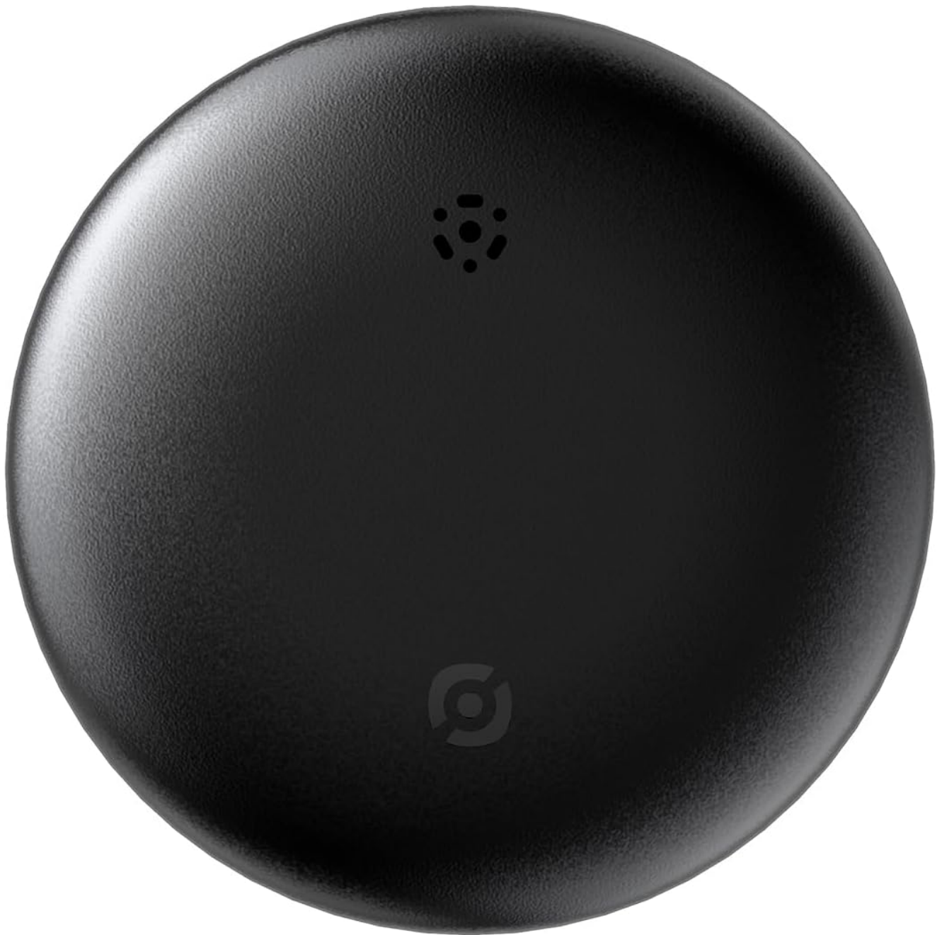
Figure 1: Novzix Android Compatible Tracker Tag (Black)