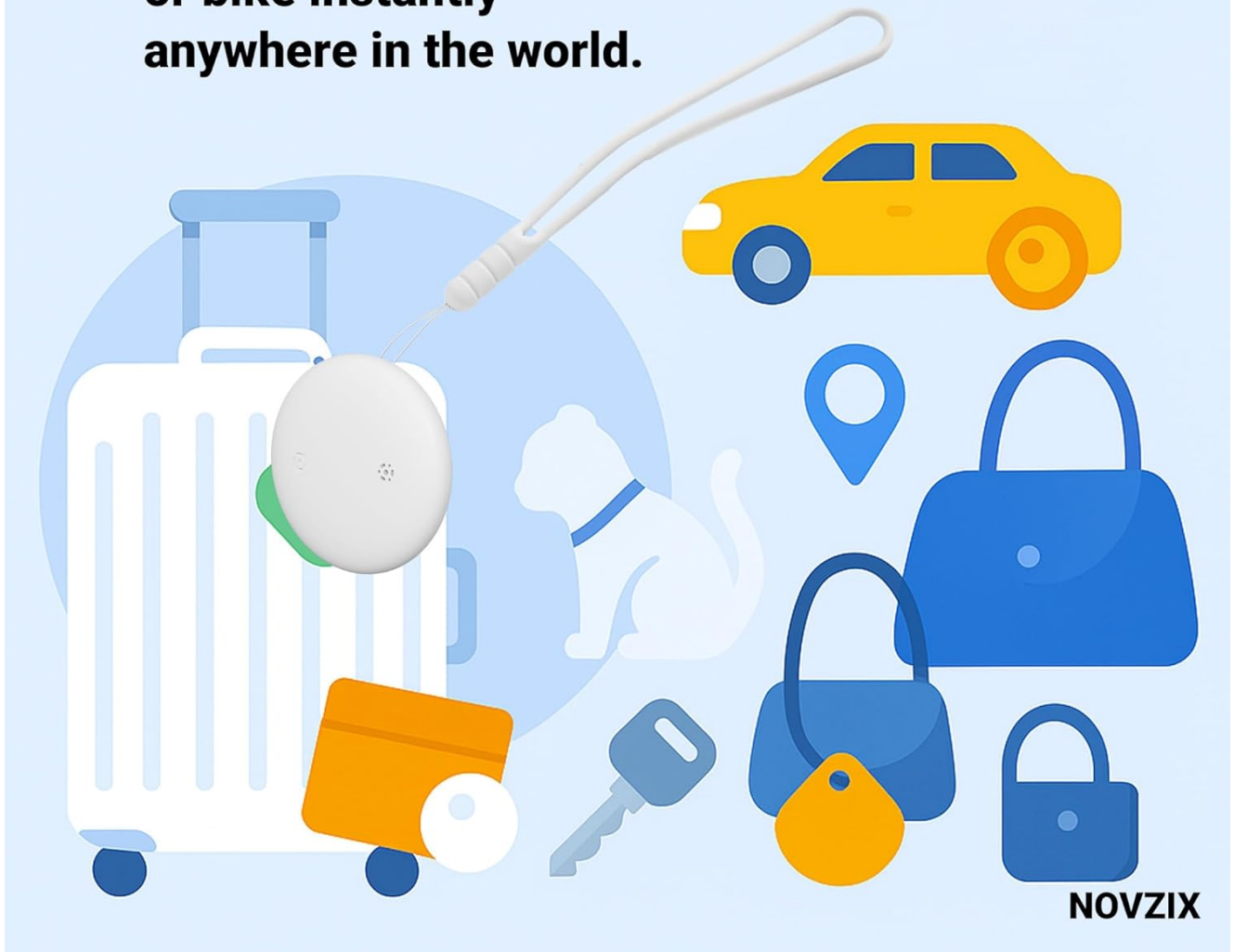
Figure 5: Protect your keys, bags, and other valuables.

Find your keys, bag, or bike instantly – anywhere in the world.