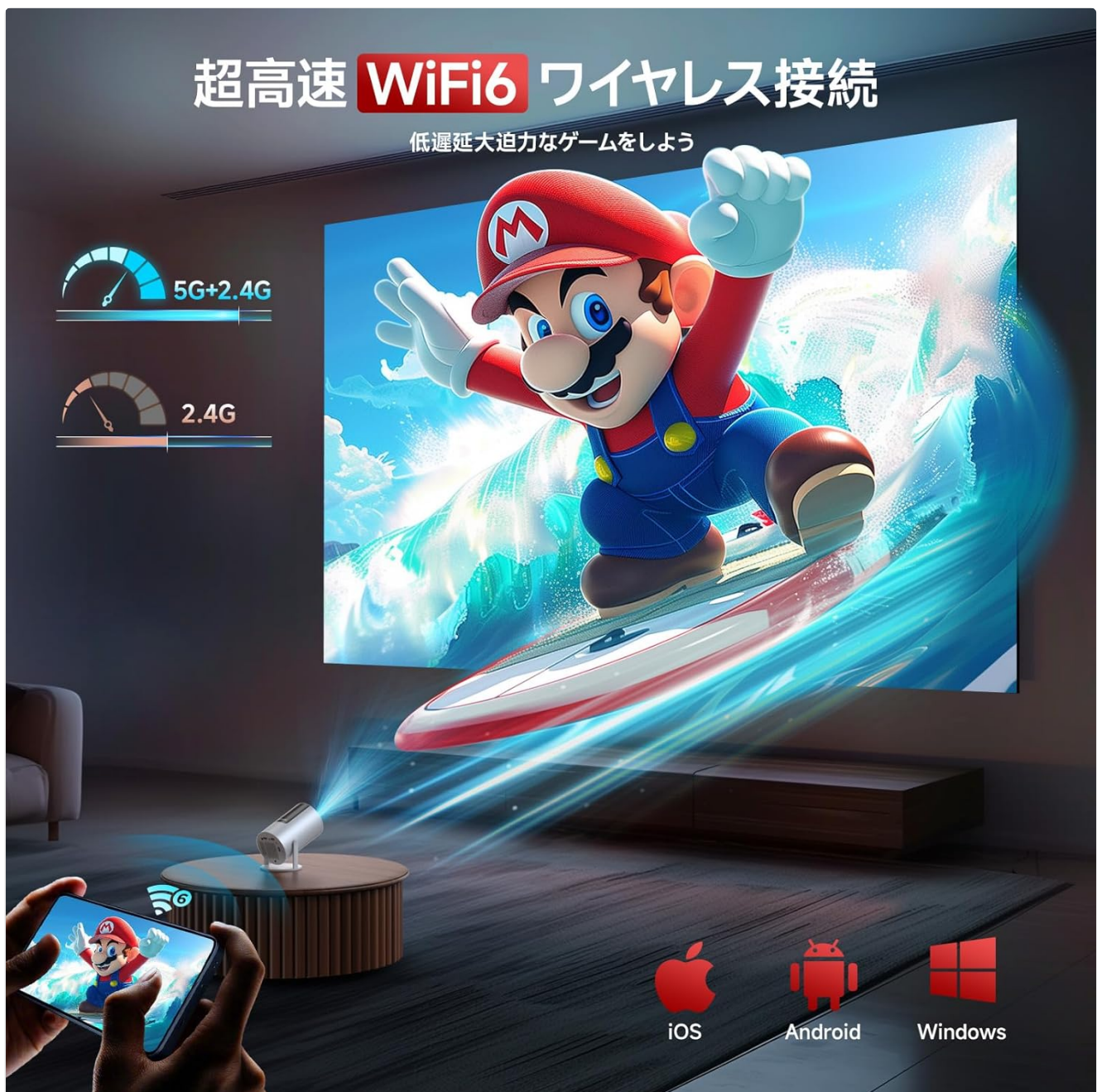
Figure 6.1: An illustration of the JOWLURK A30 projector utilizing Wi-Fi 6 for high-speed wireless connection, ideal for gaming. A large projected image of a video game character is shown on a wall, with a smartphone displaying the game in the foreground, emphasizing low latency.