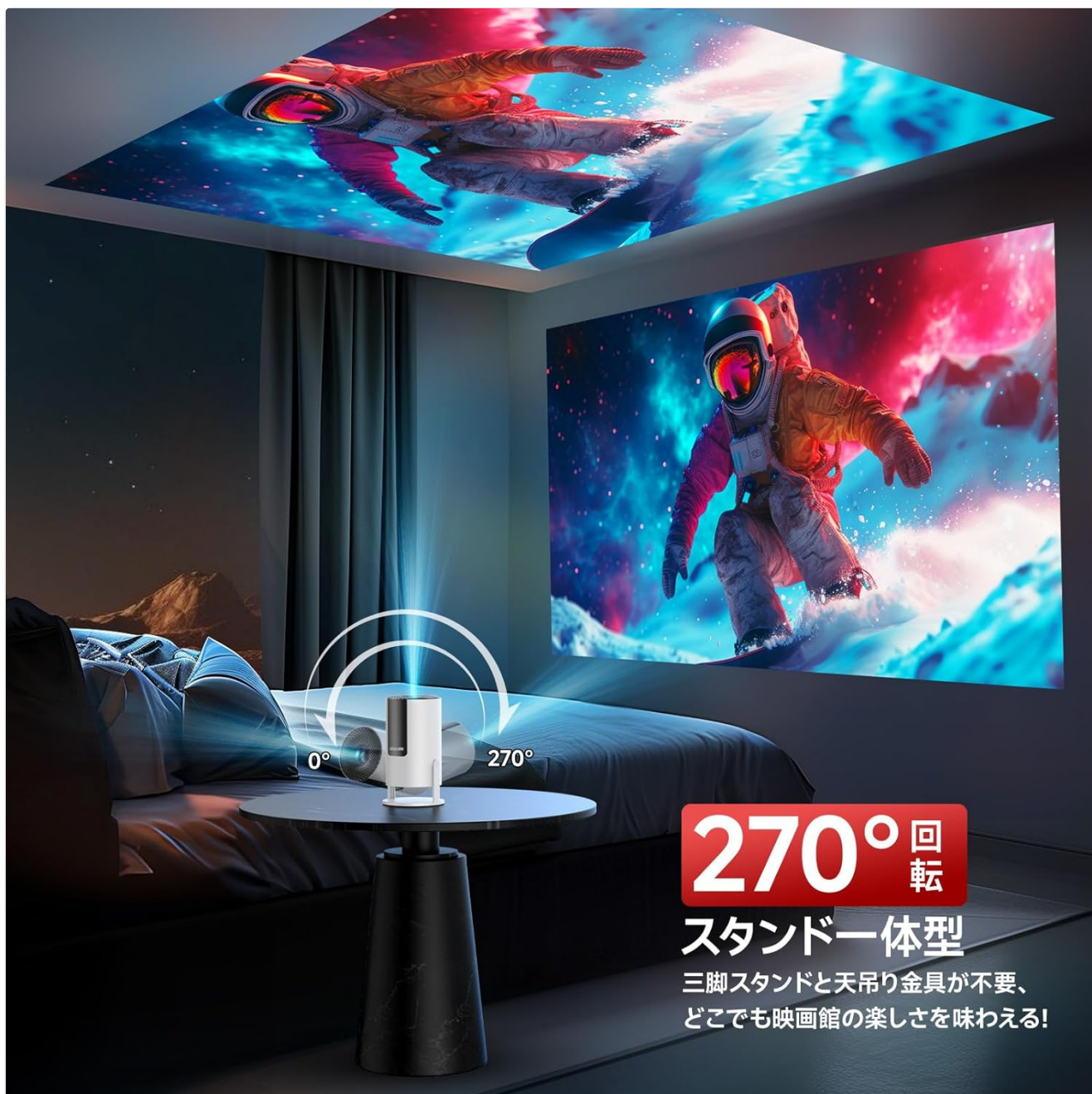
Figure 4.1: This image shows the JOWLURK A30 projector's 270-degree rotation capability, allowing it to project images onto a wall or ceiling. The projector is placed on a bedside table, projecting a large image onto the ceiling above a bed.