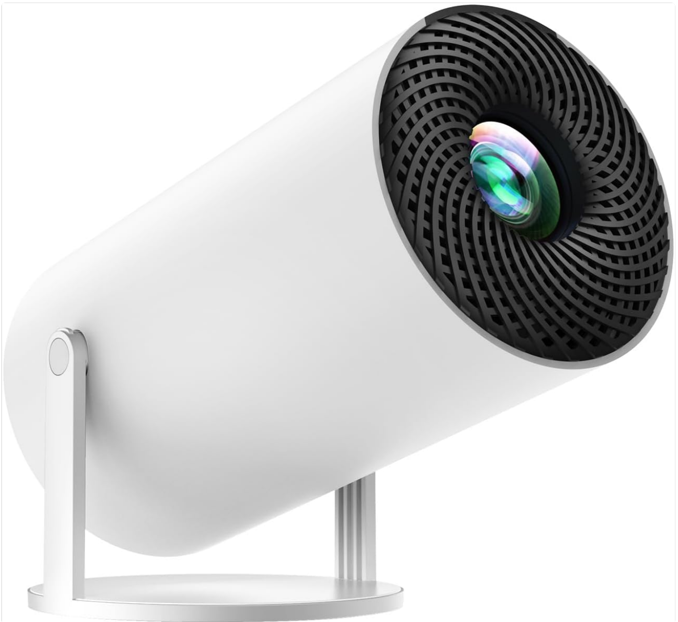
Figure 3.1: A front-side view of the JOWLURK A30 home projector, showcasing its compact cylindrical design and integrated stand. The lens is visible on the front, and the device is white with black grilles.