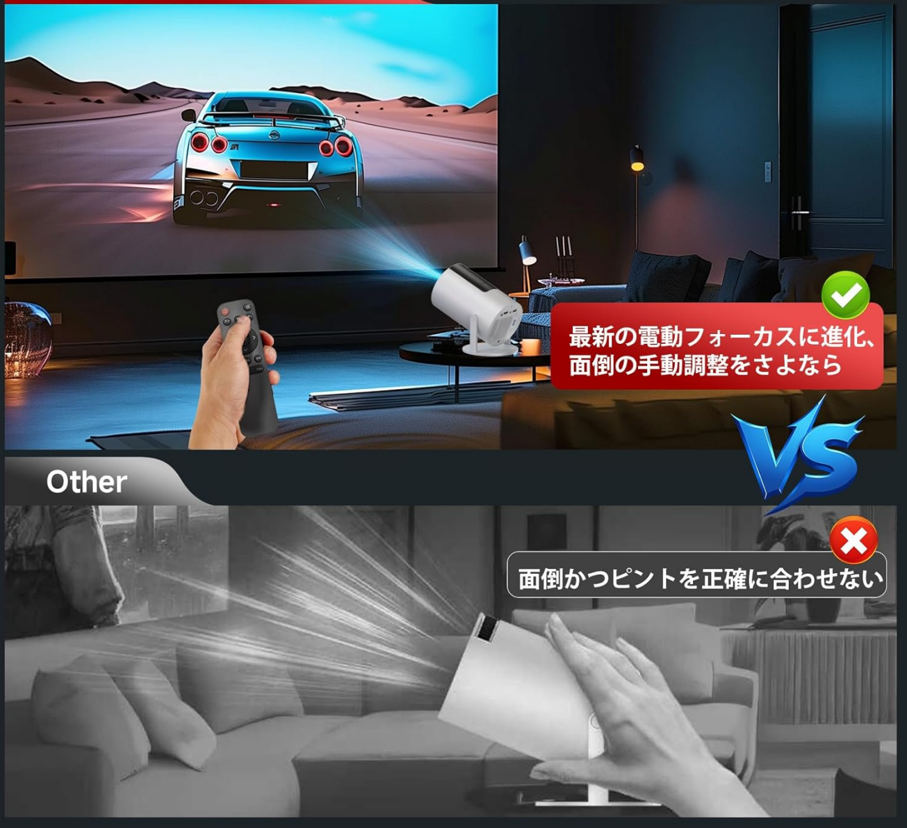
Figure 4.2: This image demonstrates the electric focus feature of the JOWLURK A30 projector. A hand holds a remote control, adjusting the focus of the projected image of a car on a screen, emphasizing ease of use compared to manual adjustment.