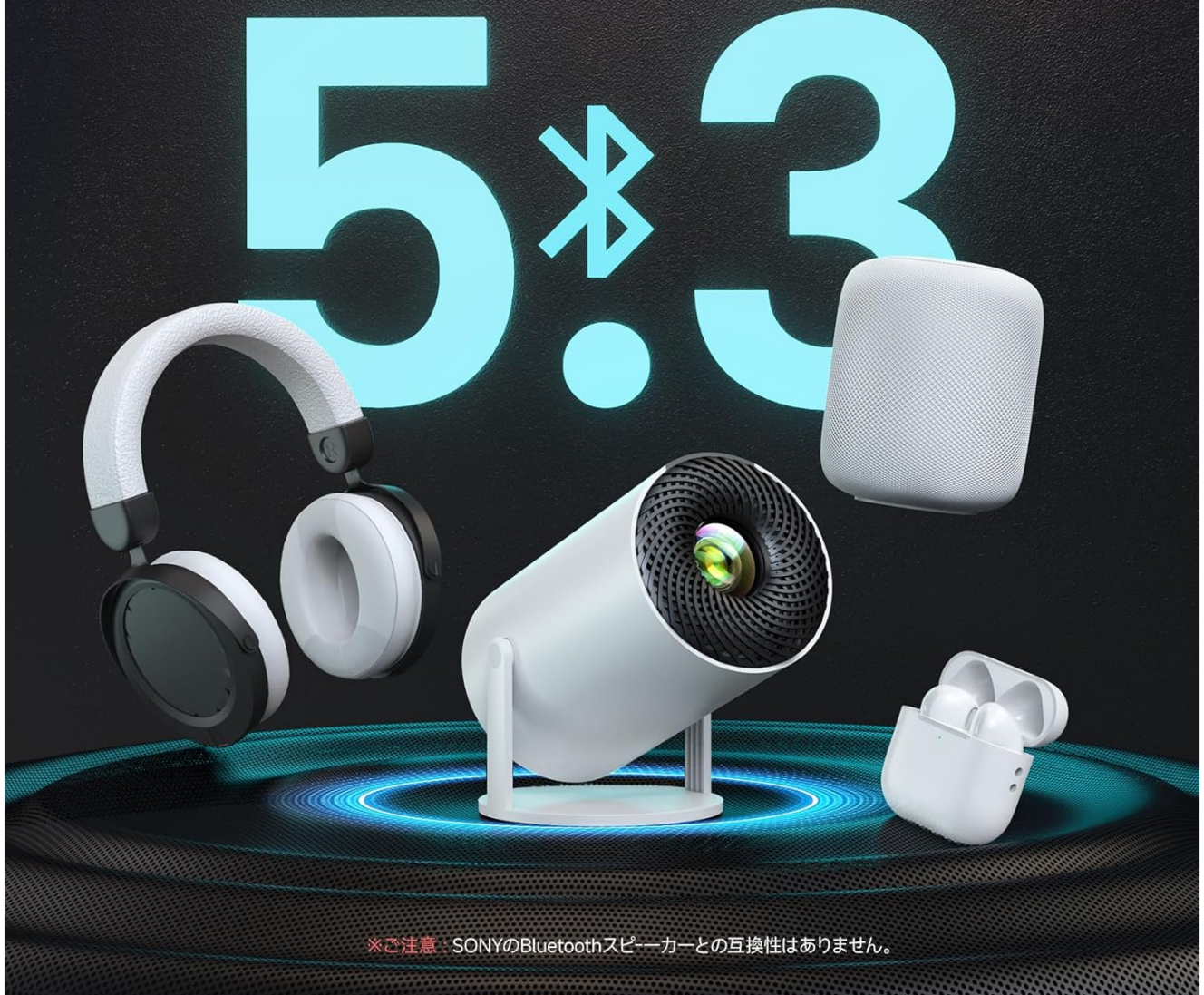
Figure 6.2: This image highlights the JOWLURK A30's Bluetooth 5.3 and built-in Hi-Fi speaker capabilities. The projector is shown surrounded by wireless headphones, a smart speaker, and earbuds, demonstrating its ability to connect to various audio devices for immersive sound.

ヘッドホンやスピーカーなどはもちろん、本体だけでも没入型3Dサラウンドを体験できる