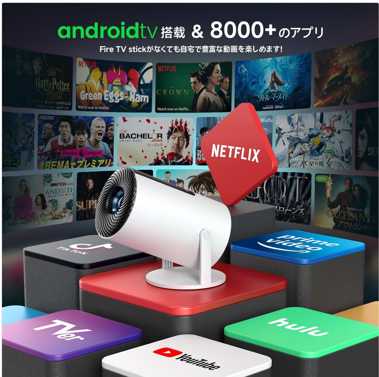
Figure 5.1: A visual representation of the JOWLURK A30's built-in Android TV interface, displaying various streaming service logos such as Netflix, YouTube, Prime Video, Hulu, and TikTok, indicating direct access to content without external devices.