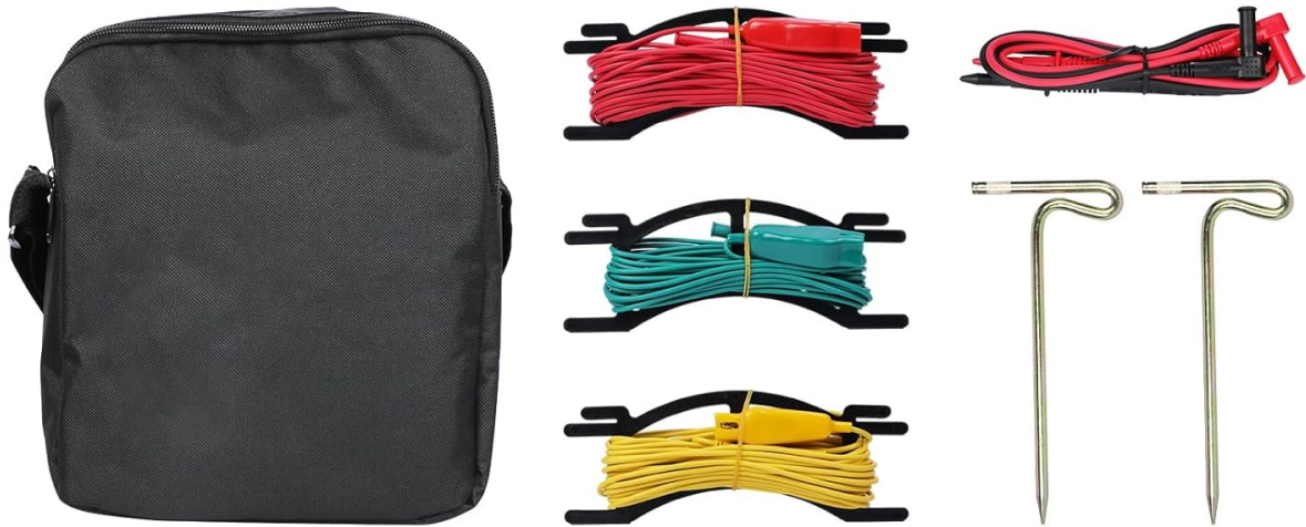
Image: The KAISAL DY4100A Earth Resistance Tester shown with its complete set of accessories, including test leads, ground rods, and a carry bag.