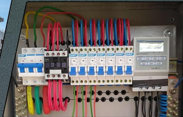
puesta a tierra de equipos eléctricos