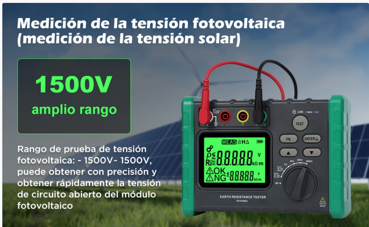
Image: The DY4100A connected to a solar panel setup, demonstrating its capability for photovoltaic voltage measurement up to 1500V.