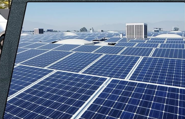
tensión solar fotovoltaica

Image: Examples of the DY4100A's broad applications, including building lightning protection, electrical equipment grounding, EV charging pile grounding, and solar PV voltage testing.