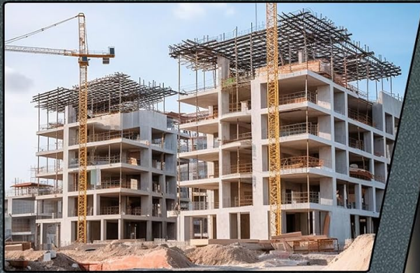
Puesta a tierra de protección contra rayos en edificios

Aplicable a la energía eléctrica, correos y telecomunicaciones, ferrocarriles, petróleo, industria química, comunicaciones, minería y otros sectores Medición