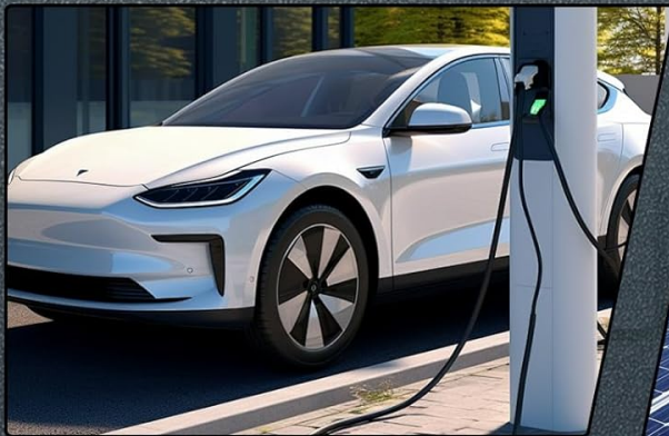
puesta a tierra de pilas de carga de automóviles