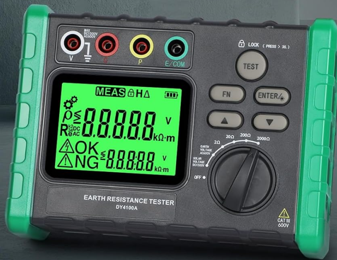
Image: An overview of the DY4100A tester highlighting its key features such as 2- and 3-wire testing, earth resistance and voltage testing, solar voltage testing, automatic measurement, data lock, and automatic shutdown.