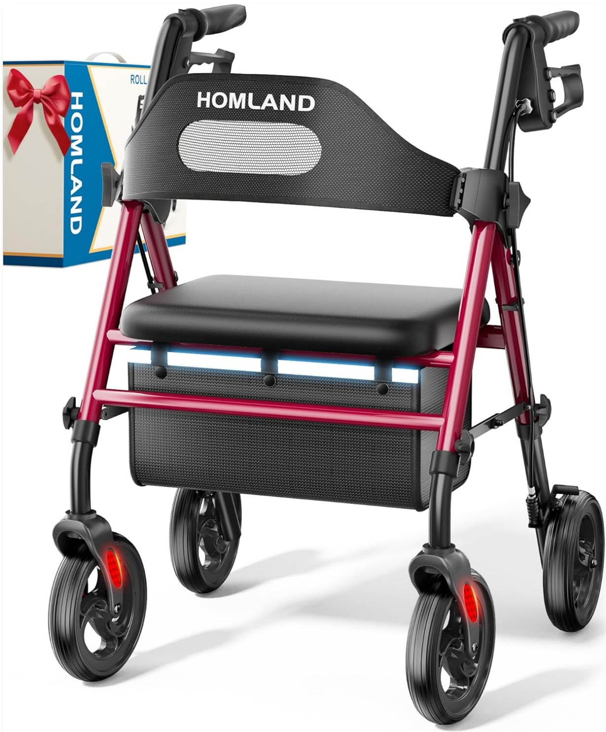
Image: The HOMLAND Foldable Rollator Walker with Seat, featuring a red frame, black seat, and 8-inch wheels.