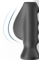
Image: Close-up view of the ergonomic hand grips and brake levers, showing how to engage the brake (squeeze) and lock (push down) functions.

Soft grips reduce hand fatigue, allowing easy use by individuals with limited strength.