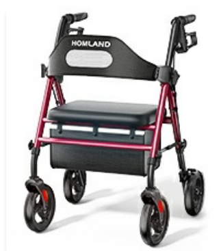
Image: A table summarizing key product details and specifications for the HOMLAND Rollator Walker.

Detailed specifications for the HOMLAND Foldable Rollator Walker, Model R2-RD: