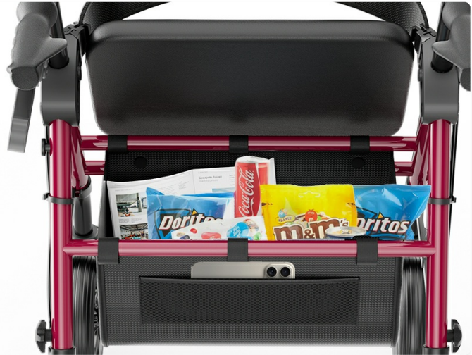
Image: Detailed view of the rollator's breathable backrest and extra-wide memory foam seat, emphasizing comfort and support.