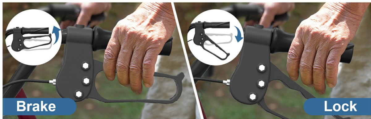
Image: Diagram highlighting the rollator's safety features, including ergonomic hand grips, reliable braking system, multi-reflector design, and pinch-proof design.

Features three modes (free, deceleration, stop) for ultimate control.