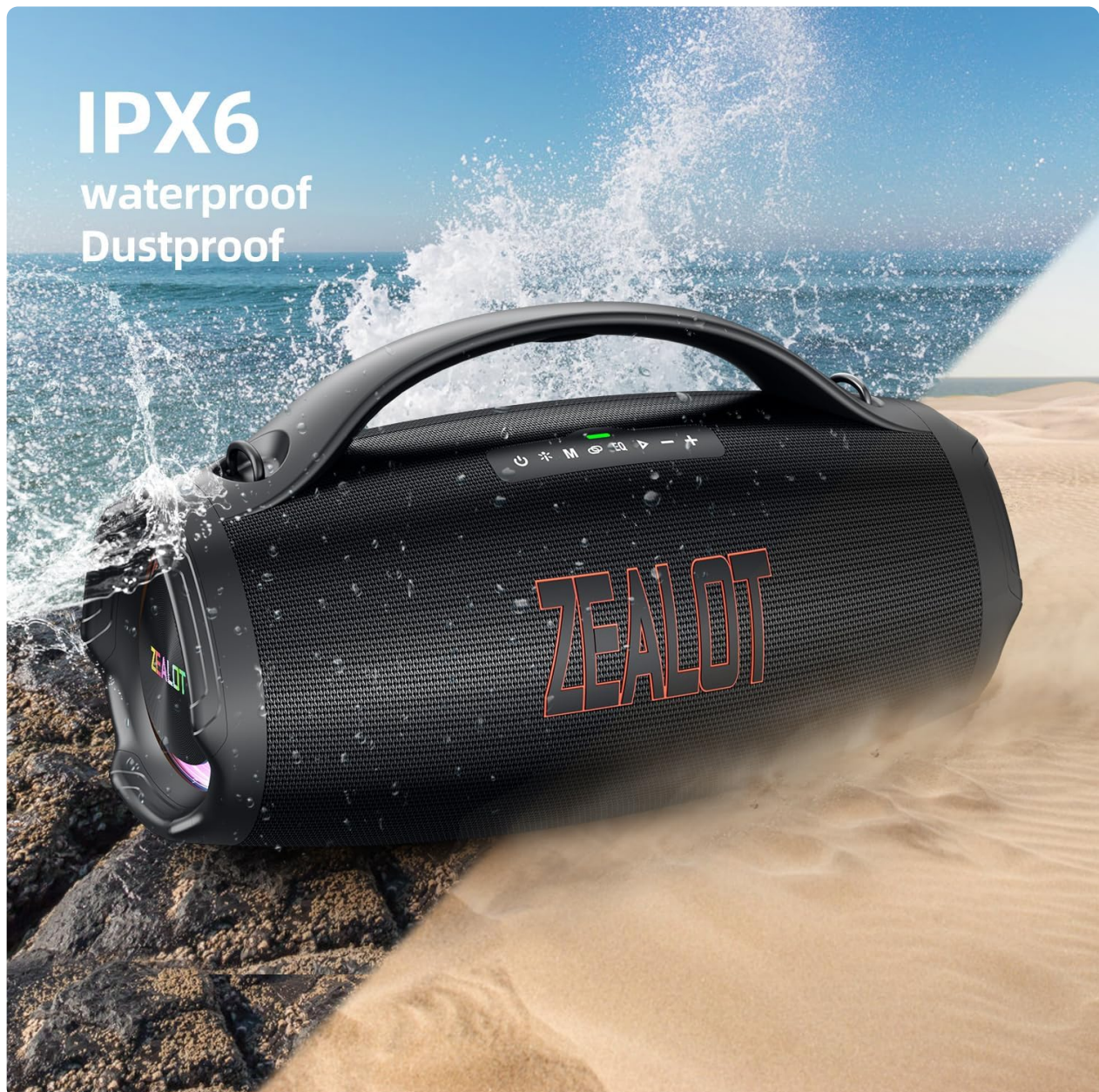
Image: The ZEALOT S98 speaker on a beach, showcasing its IPX6 waterproof and dustproof capabilities.

The speaker is IPX6 waterproof, meaning it can withstand powerful water jets. It is suitable for use in rainy conditions or near water bodies. However, it is not designed for submersion . Ensure the port cover is securely closed before exposing the speaker to water.