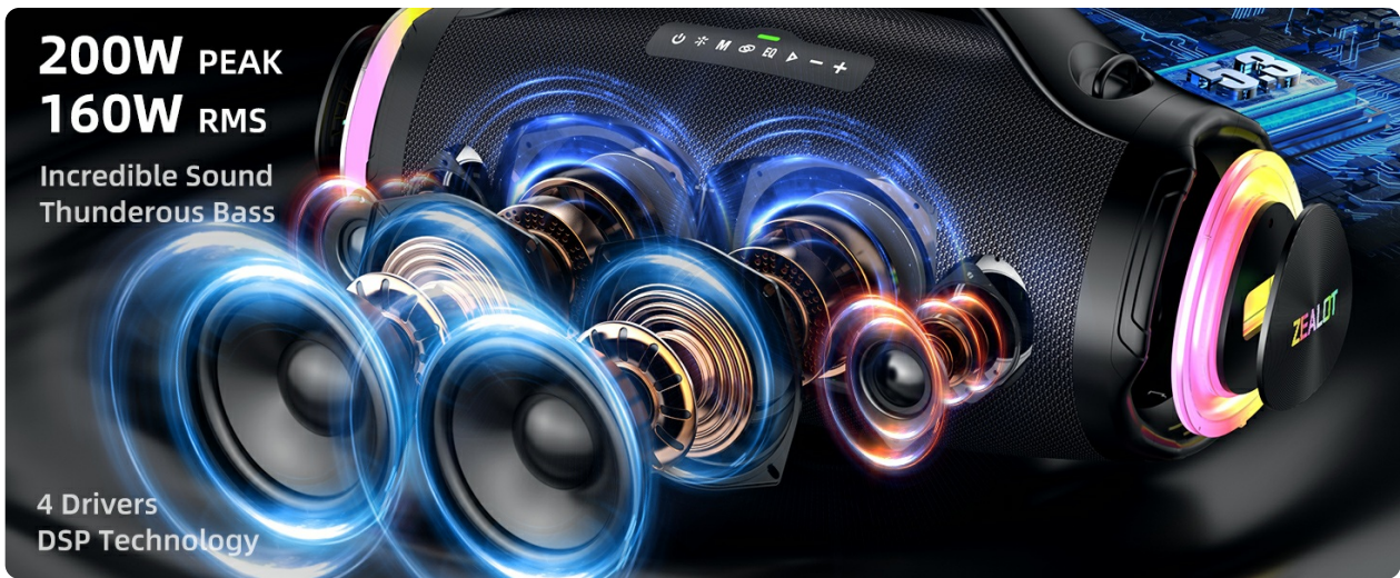
Image: Internal diagram illustrating the 160W high-power audio components of the ZEALOT S98 speaker.