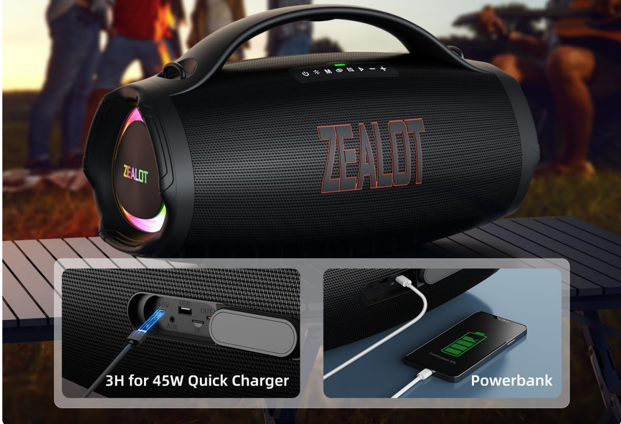
Image: Dimensions and weight of the ZEALOT S98 Portable Bluetooth Speaker.