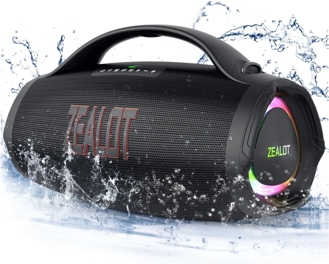
Image: Front view of the ZEALOT S98 Portable Bluetooth Speaker, highlighting its IPX6 waterproof design with water splashes.