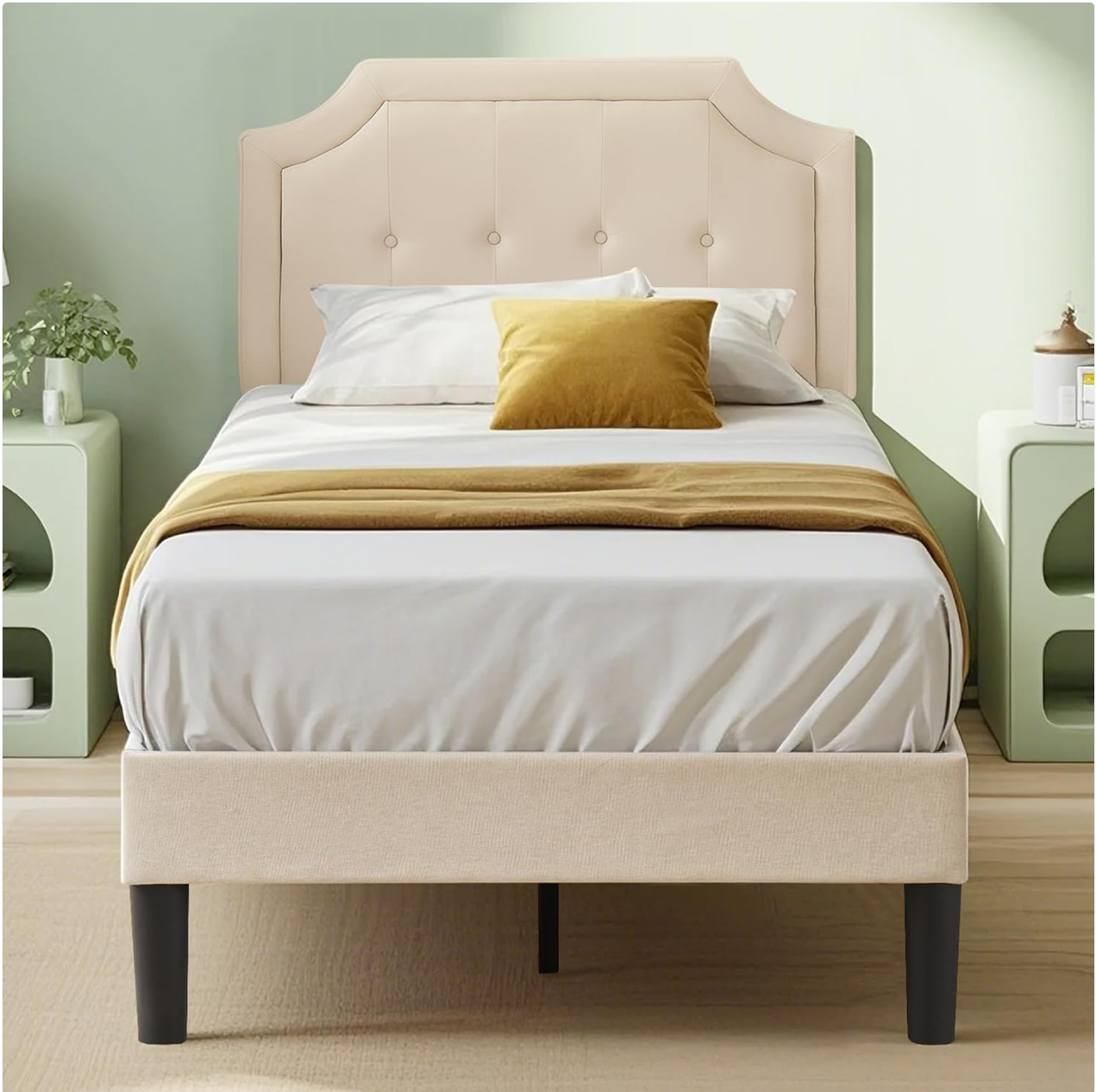
Figure 1: Fully assembled VECELO Twin Size Platform Bed Frame in beige.