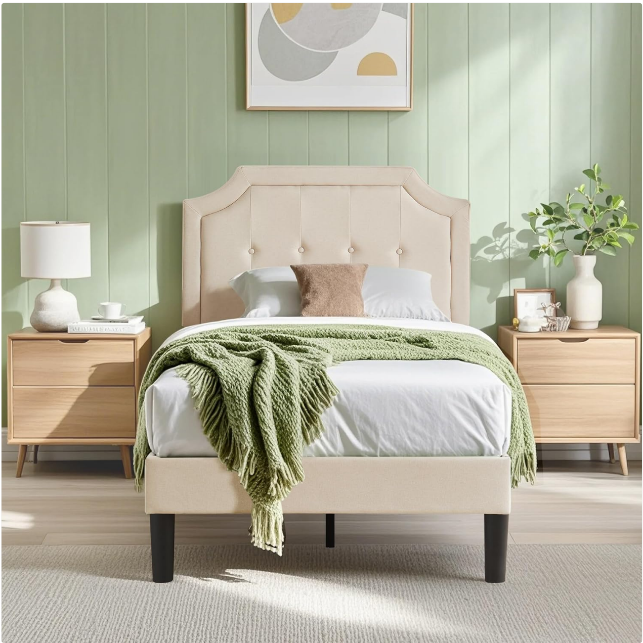
Figure 3: An assembled VECELO bed frame, highlighting the wooden slat support system.