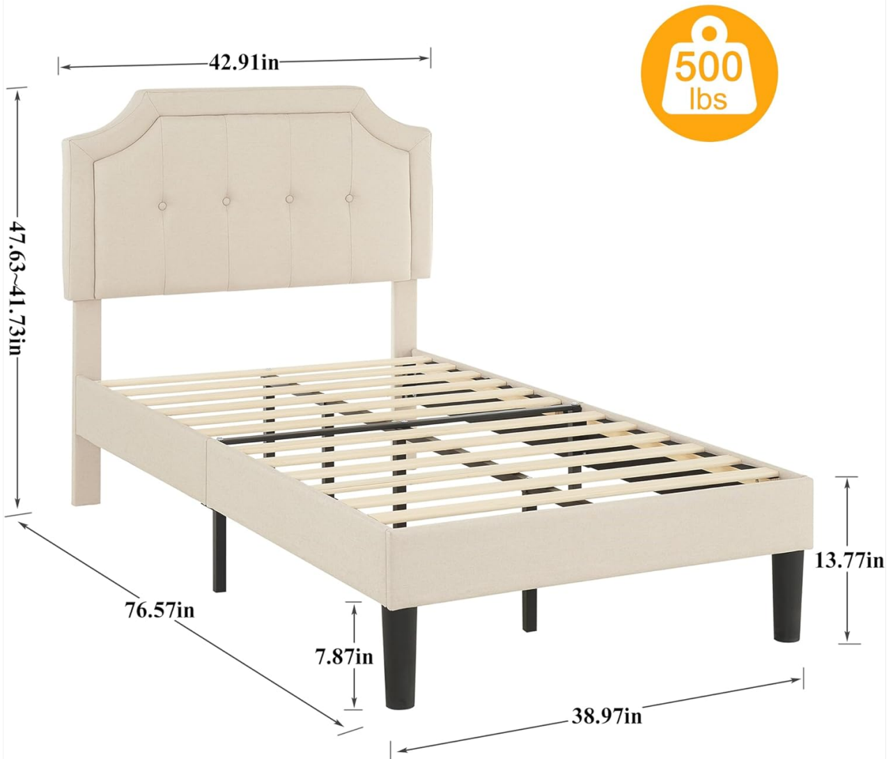
Figure 2: Diagram illustrating the dimensions and maximum load capacity of the twin size bed frame.