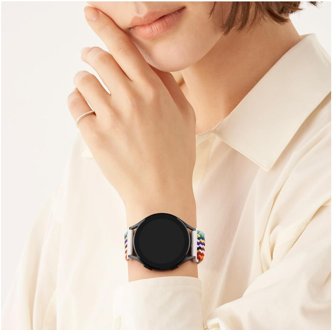
Image: A person wearing the Meliya elastic nylon strap with a smartwatch, demonstrating its appearance and fit on the wrist.