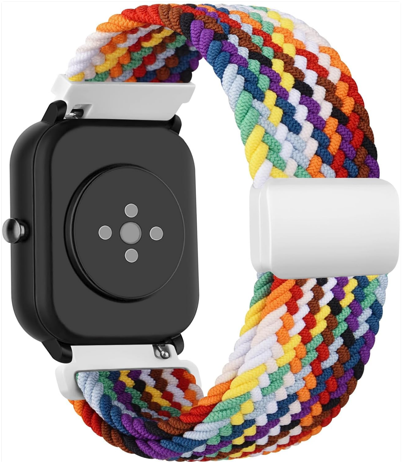
Image: Rear view of the smartwatch with the Meliya strap attached, illustrating the connection points.