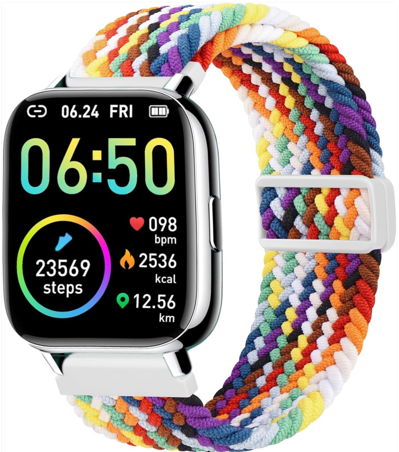
Image: Front view of a smartwatch featuring the colorful Meliya elastic nylon strap.