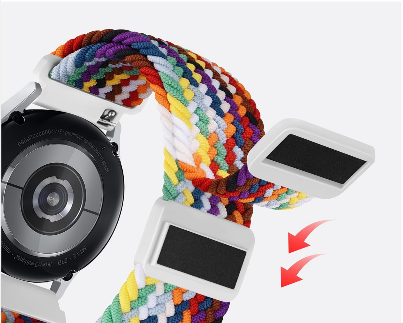
Image: Detailed view of the upgraded magnetic buckle, demonstrating its strong adsorption for stable and convenient length adjustment.

The magnetic buckle can strongly adsorb stable fit More convenient to adjust the length.