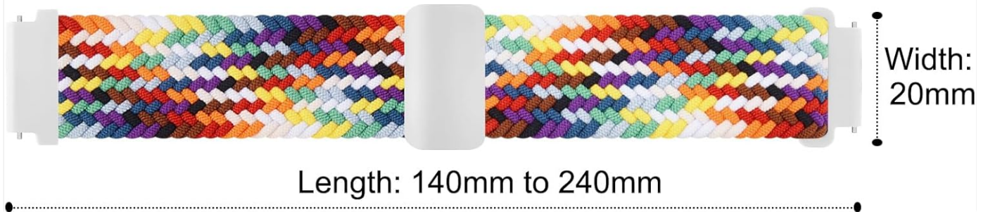
Image: Illustration of the adjustable nylon loop band, indicating a fit for wrist sizes from 5.5 to 9.4 inches (140mm-240mm) and a strap width of 20mm.

One size fit for wrist size: 5.5 Inch-9.4 Inch (140mm-240mm)