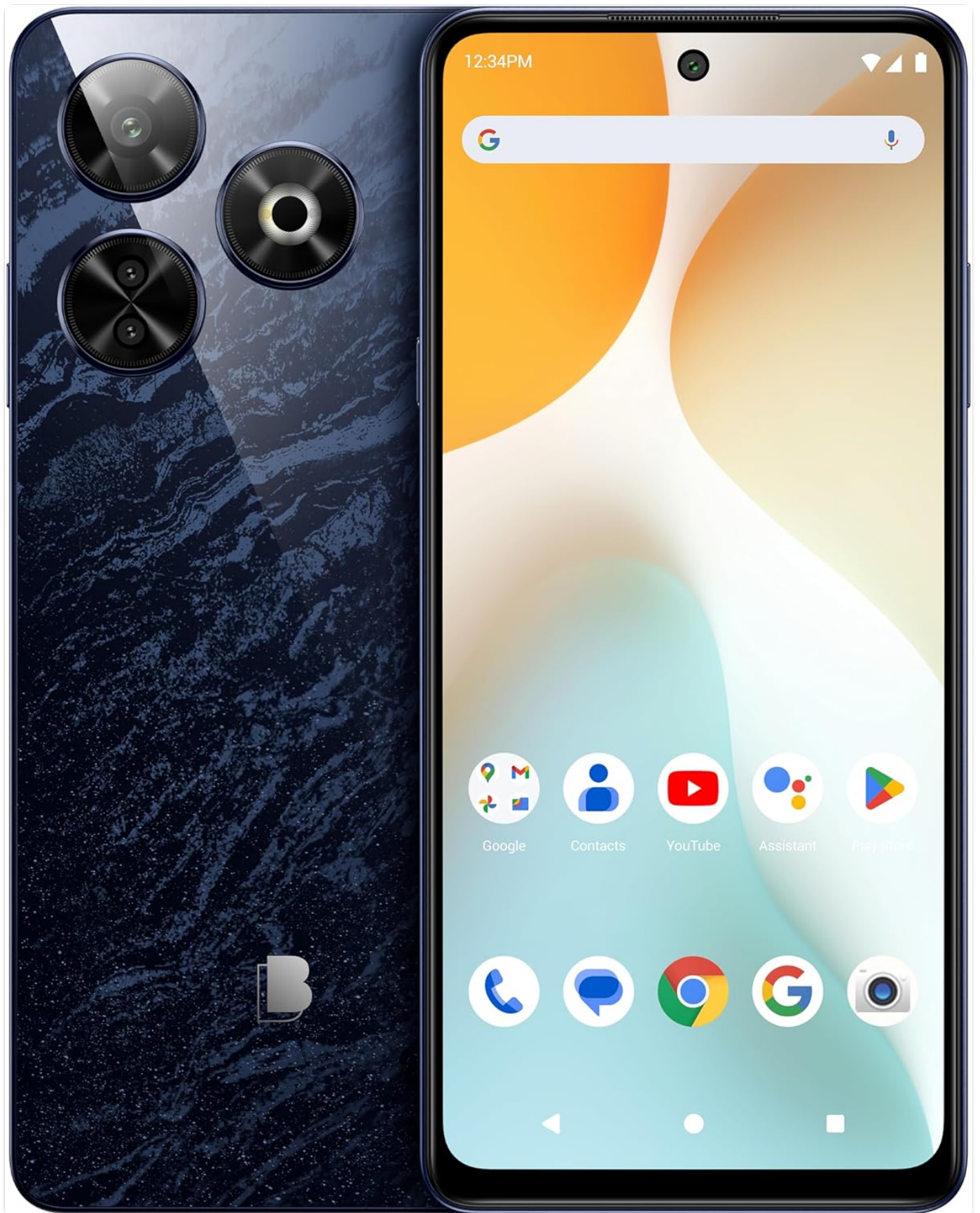
Image: Front and back view of the BLU G84 smartphone, showcasing its sleek design and camera module.