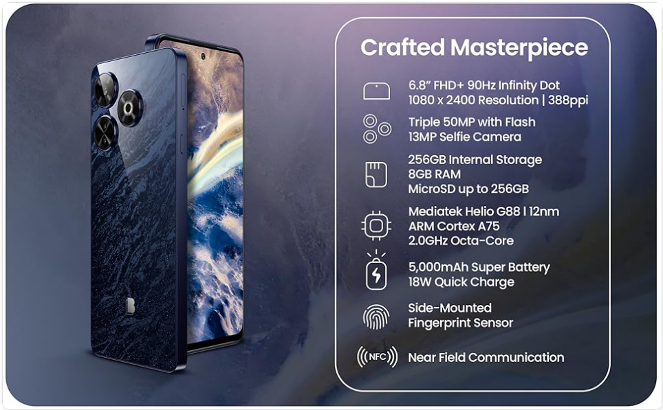
Image: An illustration highlighting the BLU G84's display and key specifications, including screen size, resolution, camera details, storage, RAM, processor, battery, and NFC capabilities.

The BLU G84 features a 6.8-inch FHD+ Infinity Dot Display. Navigate the interface using touch gestures: tap to select, swipe to scroll, pinch to zoom. The side-mounted fingerprint scanner provides quick and secure unlocking.