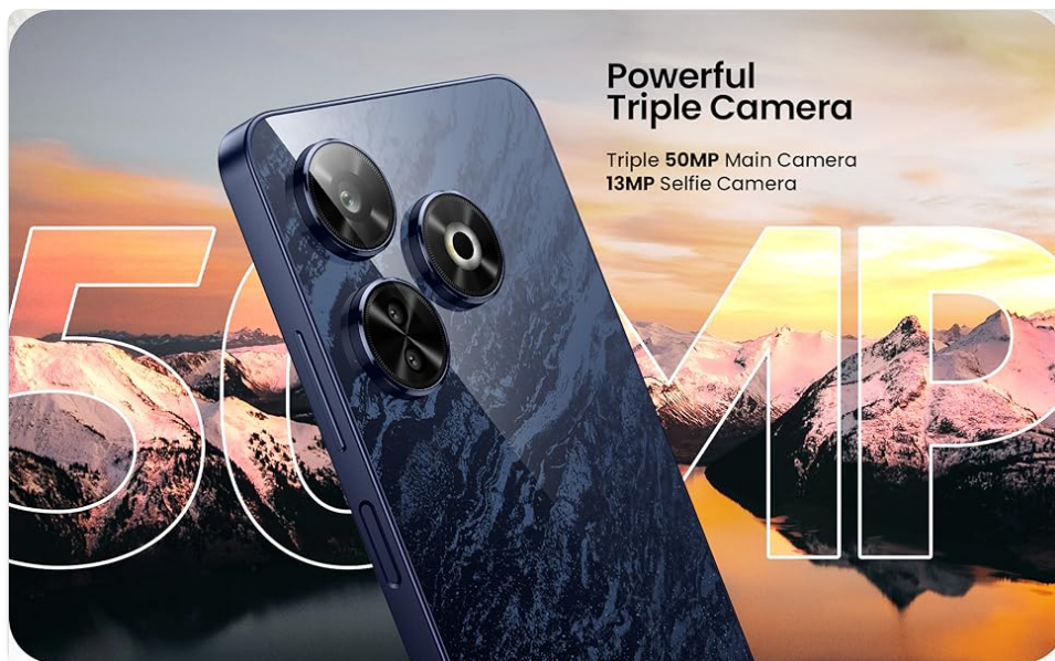
Image: A close-up view of the BLU G84's triple camera module, emphasizing its 50MP main sensor and photographic capabilities.