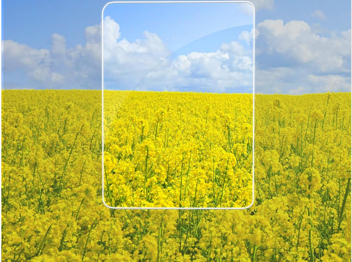
Image: A visual representation of the screen protector's high definition clarity, showing a clear rectangular overlay on a vibrant yellow field under a blue sky, indicating 99% visual transparency.

Provides 99% visual transparency that preserves crystal clear optical clarity with vibrant colors