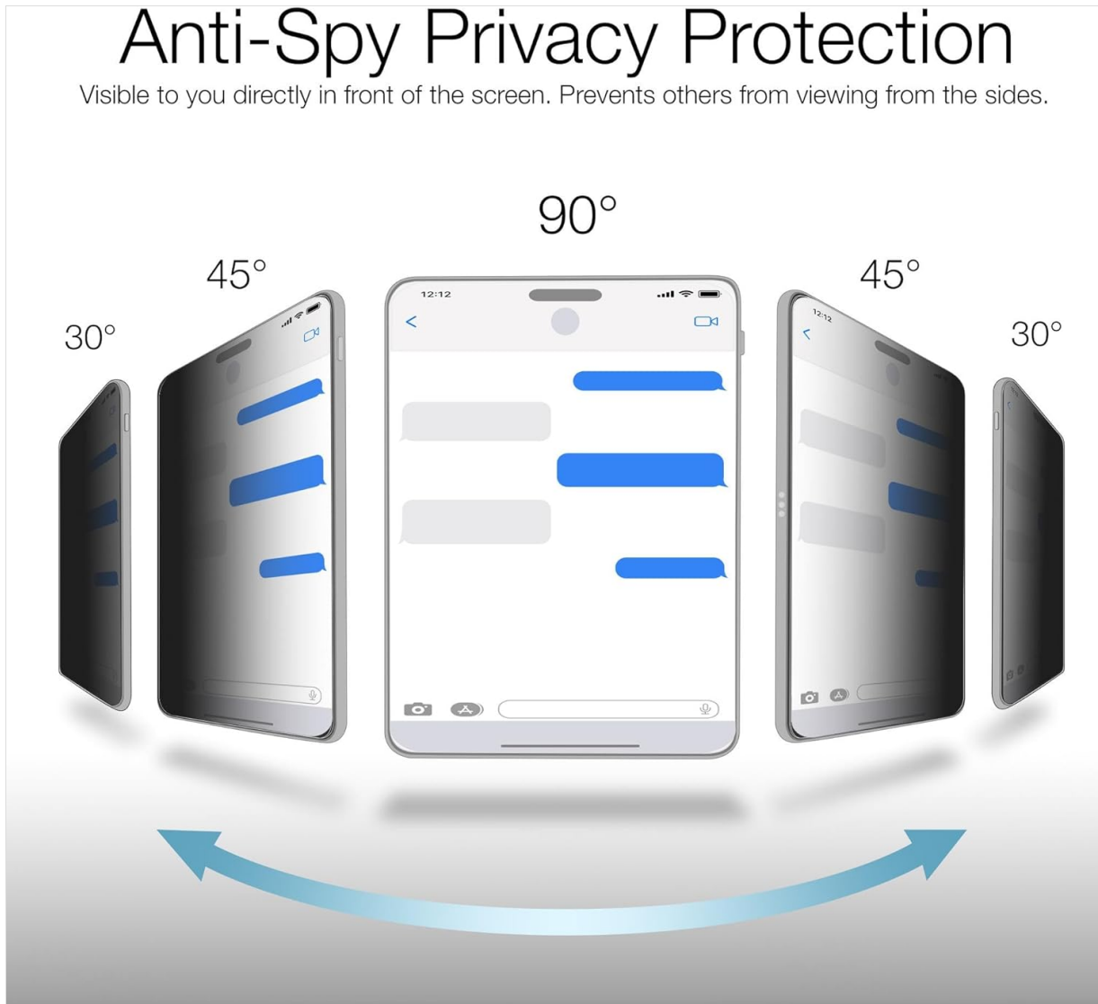
Image: A smartphone screen demonstrating anti-spy privacy protection. The screen is clear when viewed from 0 degrees (directly in front) but becomes obscured at 30 and 45-degree angles, preventing side viewing.