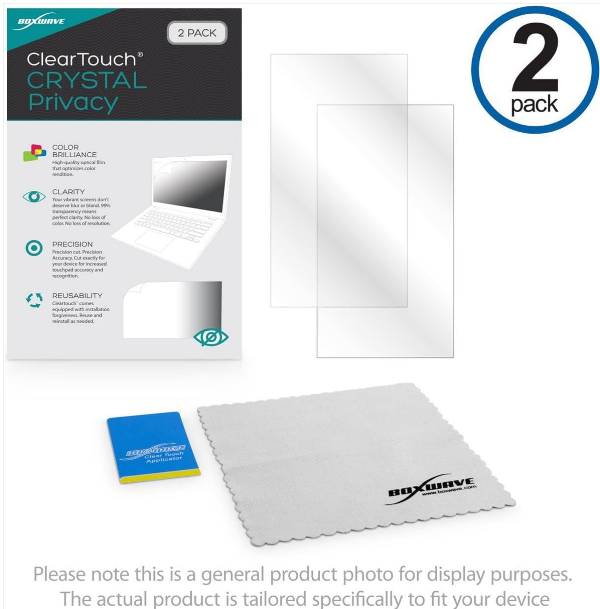
Image: Contents of the BoxWave ClearTouch Crystal Privacy 2-Pack, showing two screen protectors, a microfiber cleaning cloth, and an applicator card. This image is a general product photo for display purposes; the actual product is tailored specifically to your device.

Important Note: The Energizer E288s device is not included with this product.