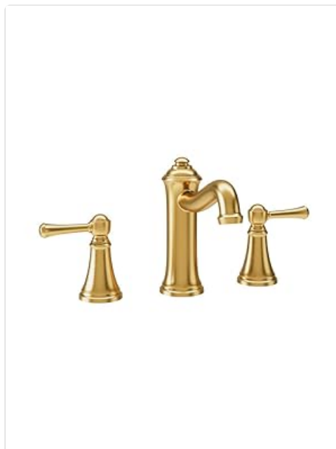
Image 9.1: Details regarding the Symmons Residential Lifetime Limited Warranty.

For warranty claims, technical assistance, or to order replacement parts, please contact Symmons customer support. Keep your proof of purchase for warranty validation.