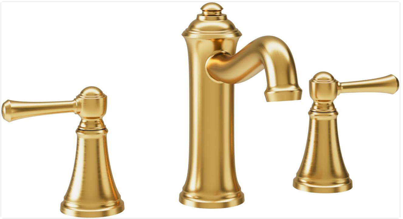
Image 3.1: The complete Braston widespread two-handle bathroom faucet in Brushed Bronze.