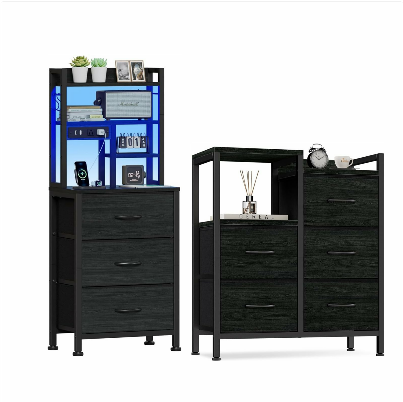
Image 1.1: Furnulem Tall Nightstand with LED lights and charging station.