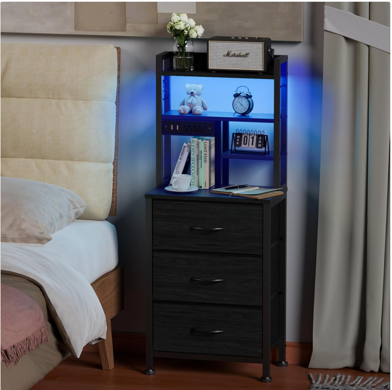
Image 4.2: Nightstand with active LED lights and charging station.