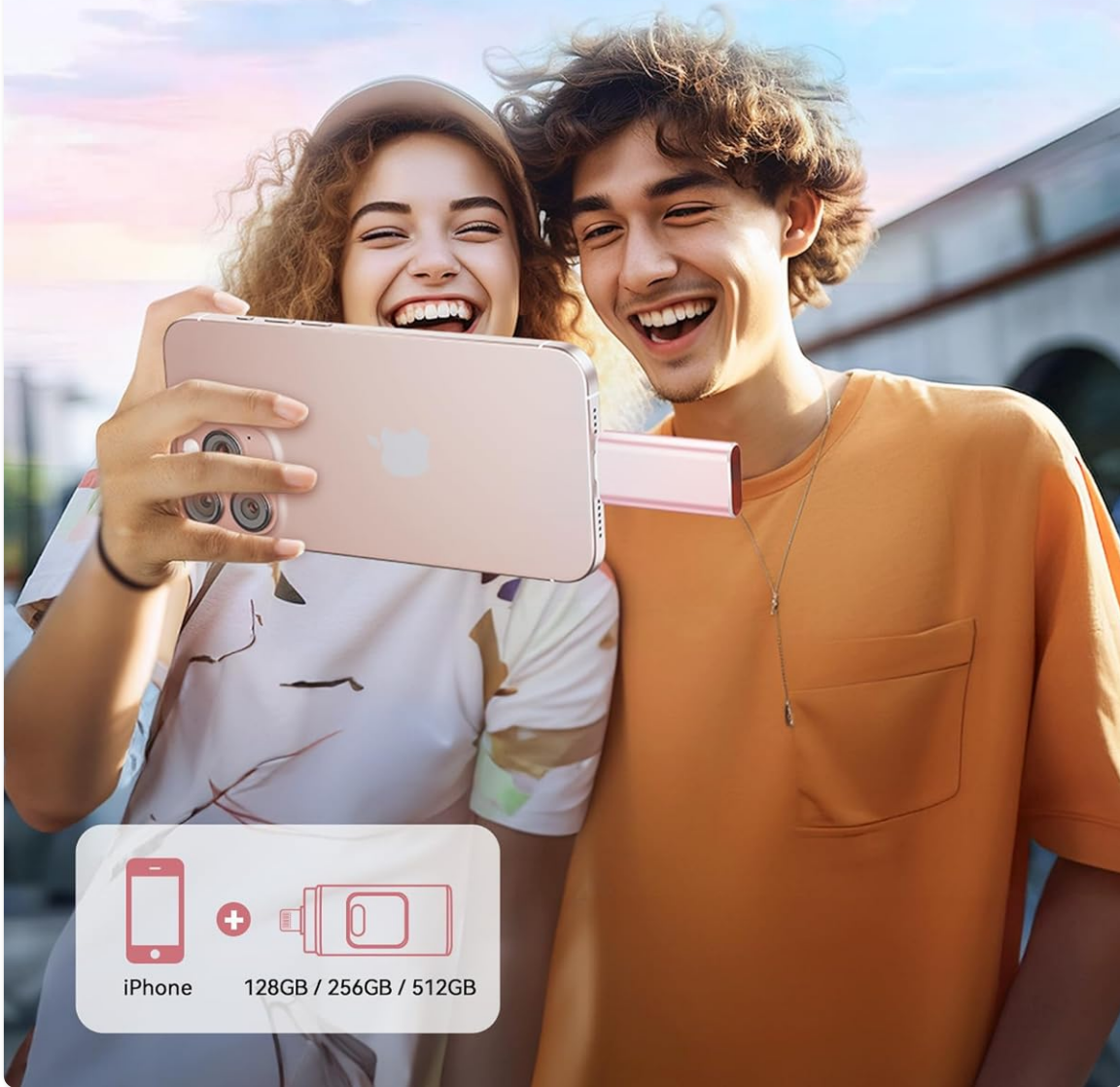
Figure 5: The ROSPE Flash Drive showcasing its multi-interface design, compatible with iOS, Type-C, and USB devices for broad connectivity.

Instantly capture photos and videos, automatically stored on a photo stick