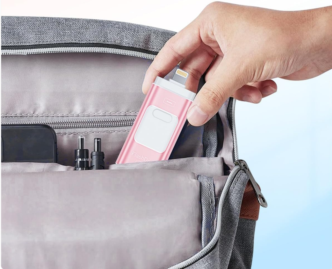
Figure 1: The compact ROSPE Flash Drive, shown fitting easily into a backpack pocket, highlighting its portability.

computer&Android side: No need to install any app