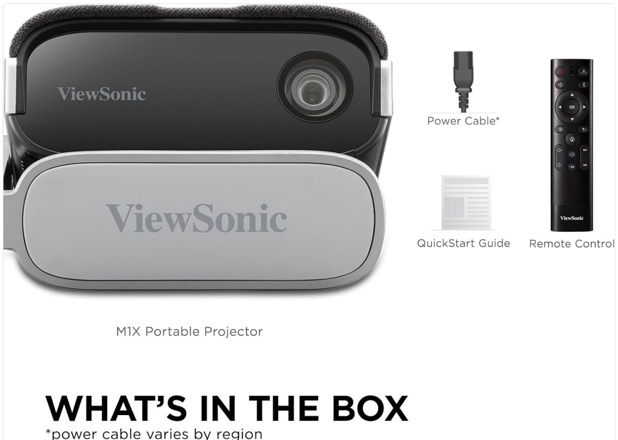
M1X Portable Projector