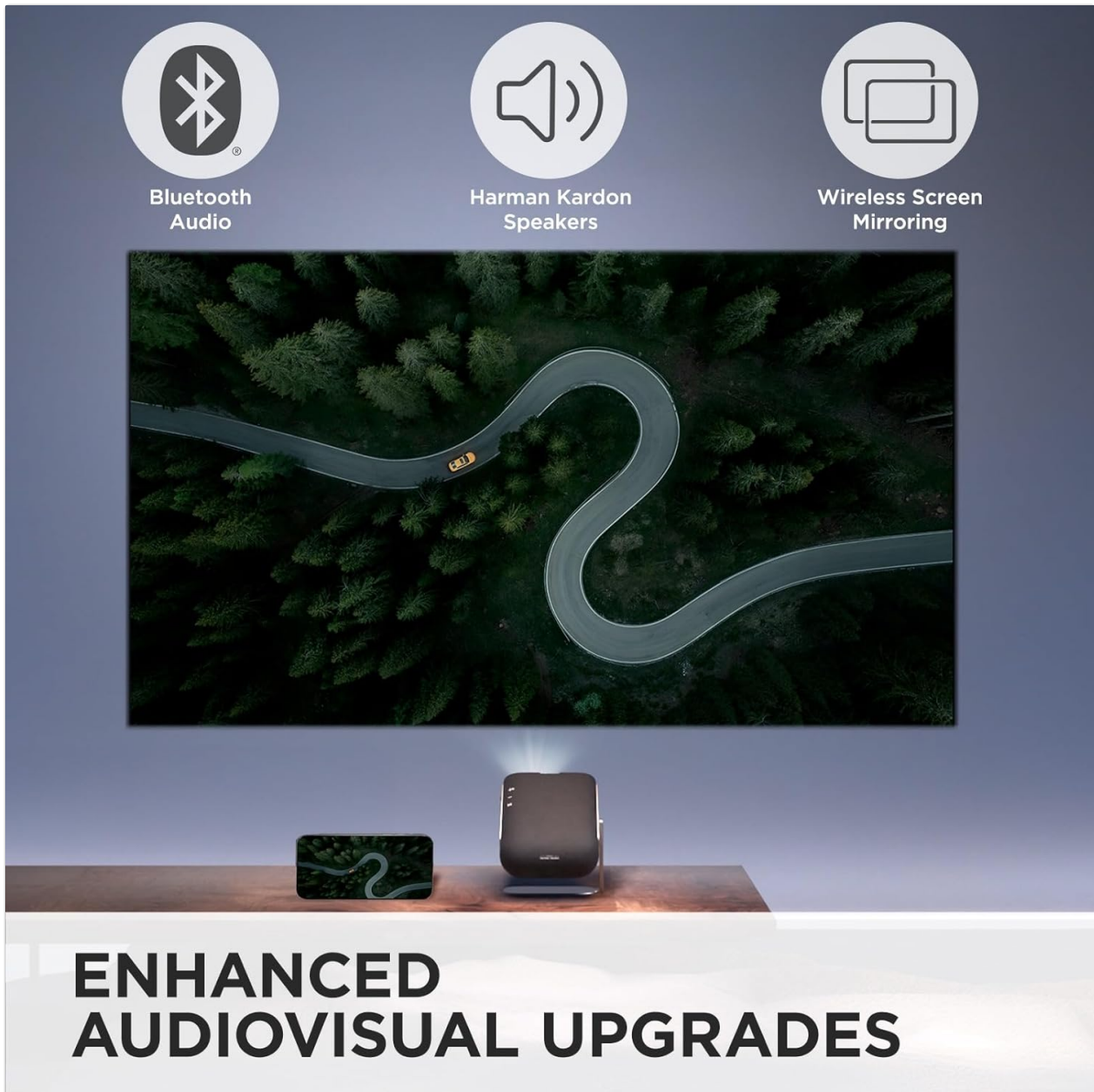
Figure 5.1: Enhanced Audiovisual Features