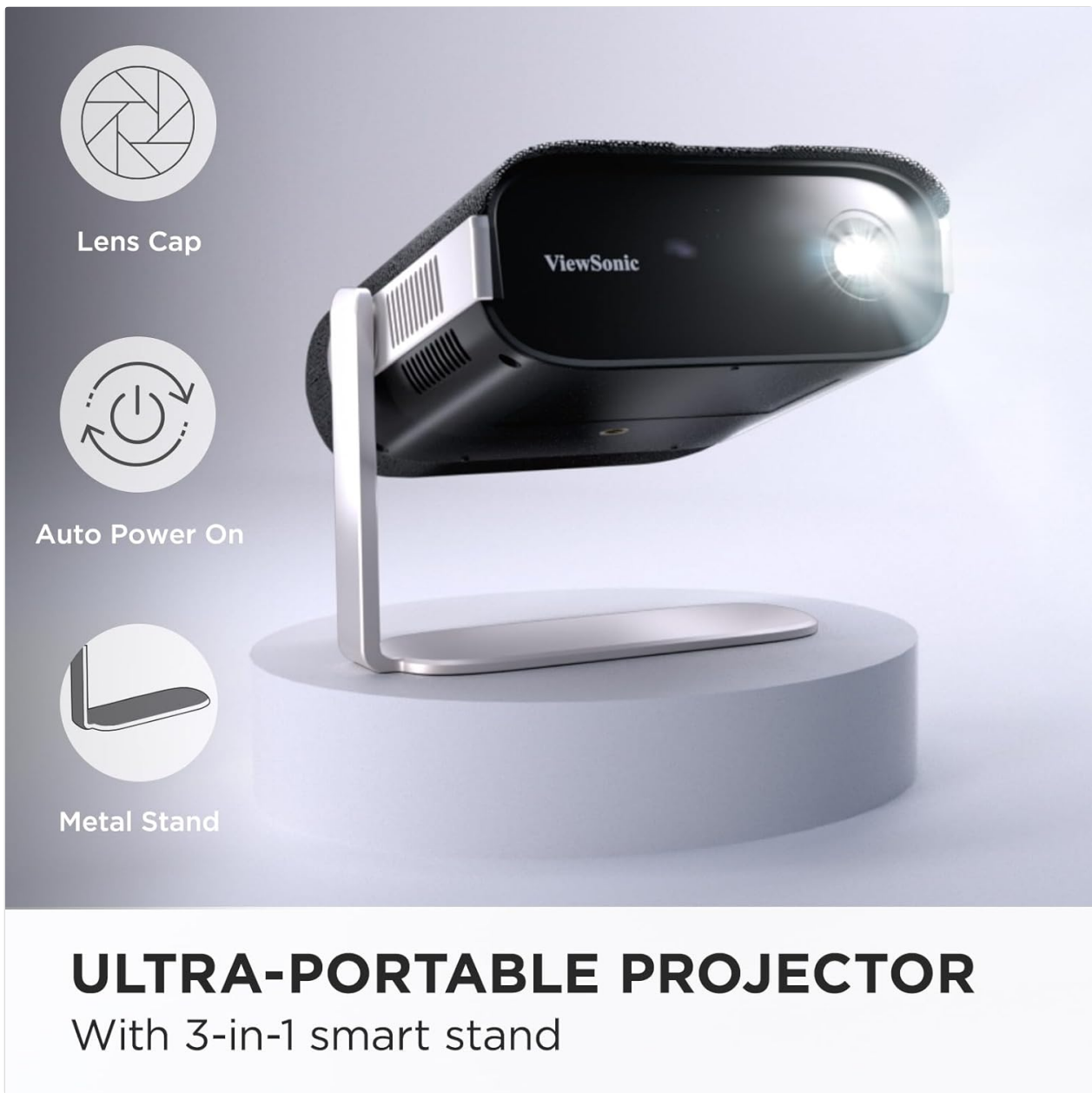
Figure 3.2: Ultra-Portable Projector with 3-in-1 Smart Stand