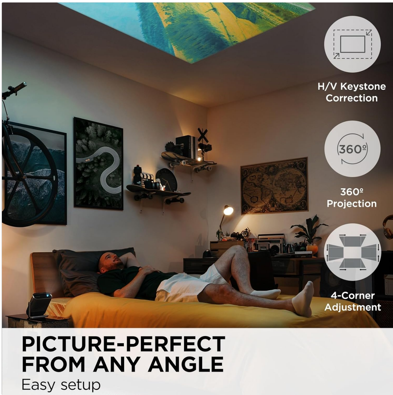
Figure 4.2: Picture-Perfect from Any Angle with Easy Setup