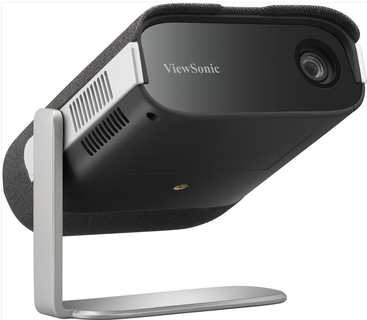
Figure 1.1: ViewSonic M1X Portable LED Projector