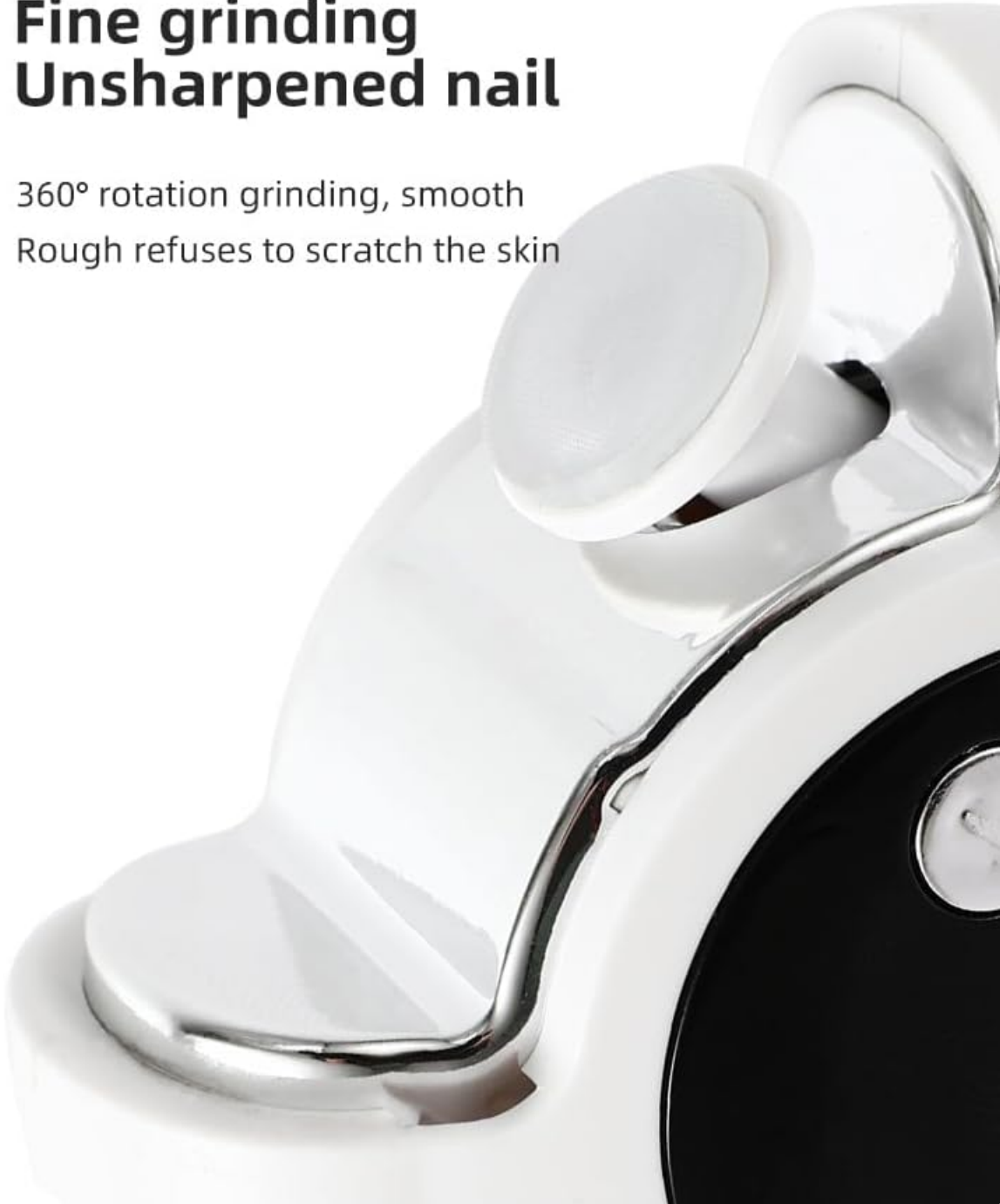
Image: A close-up view of the internal grinding mechanism, designed for smooth and safe nail shaping.

360° rotation grinding, smooth Rough refuses to scratch the skin