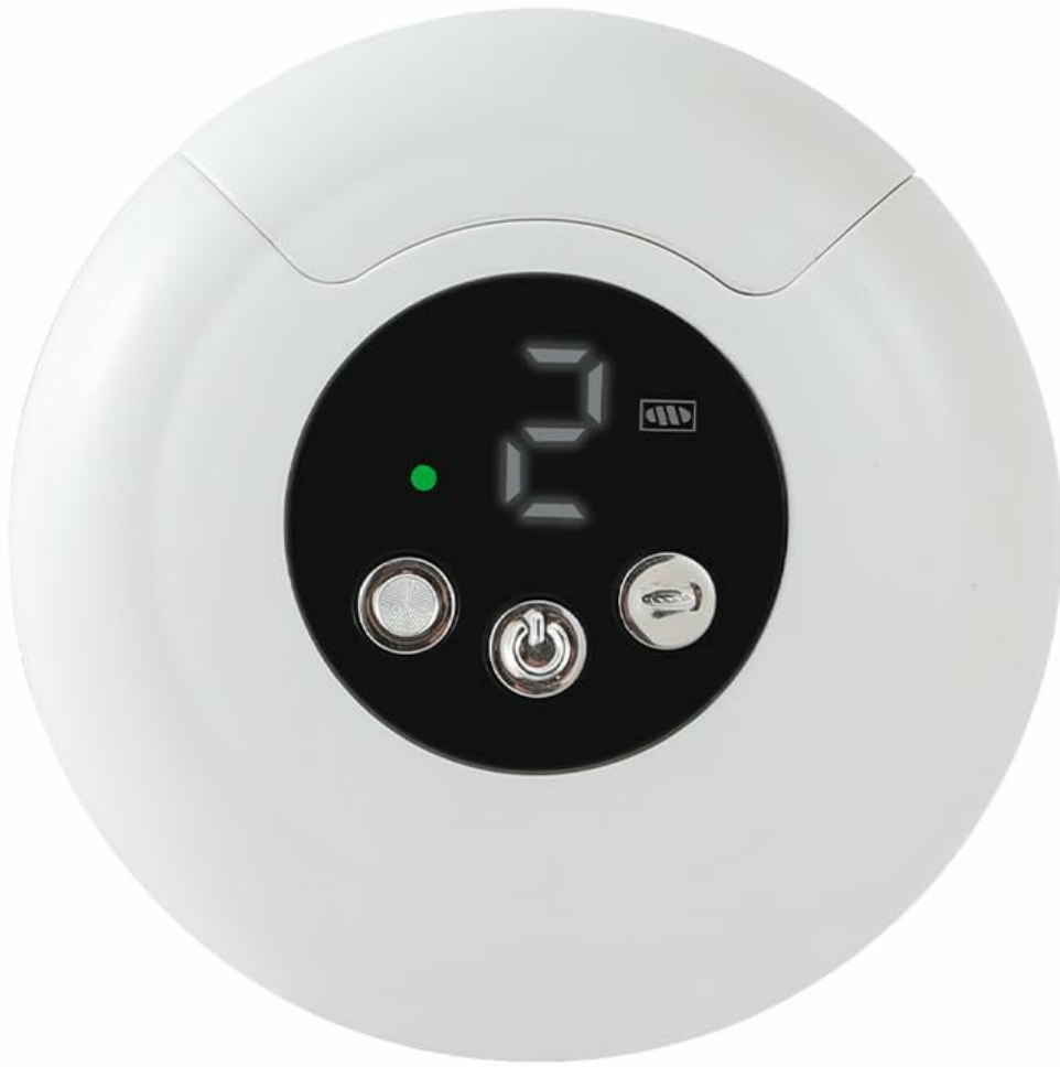
Image: The Laviniar Automatic Electric Nail Clipper in white, showcasing its compact design.