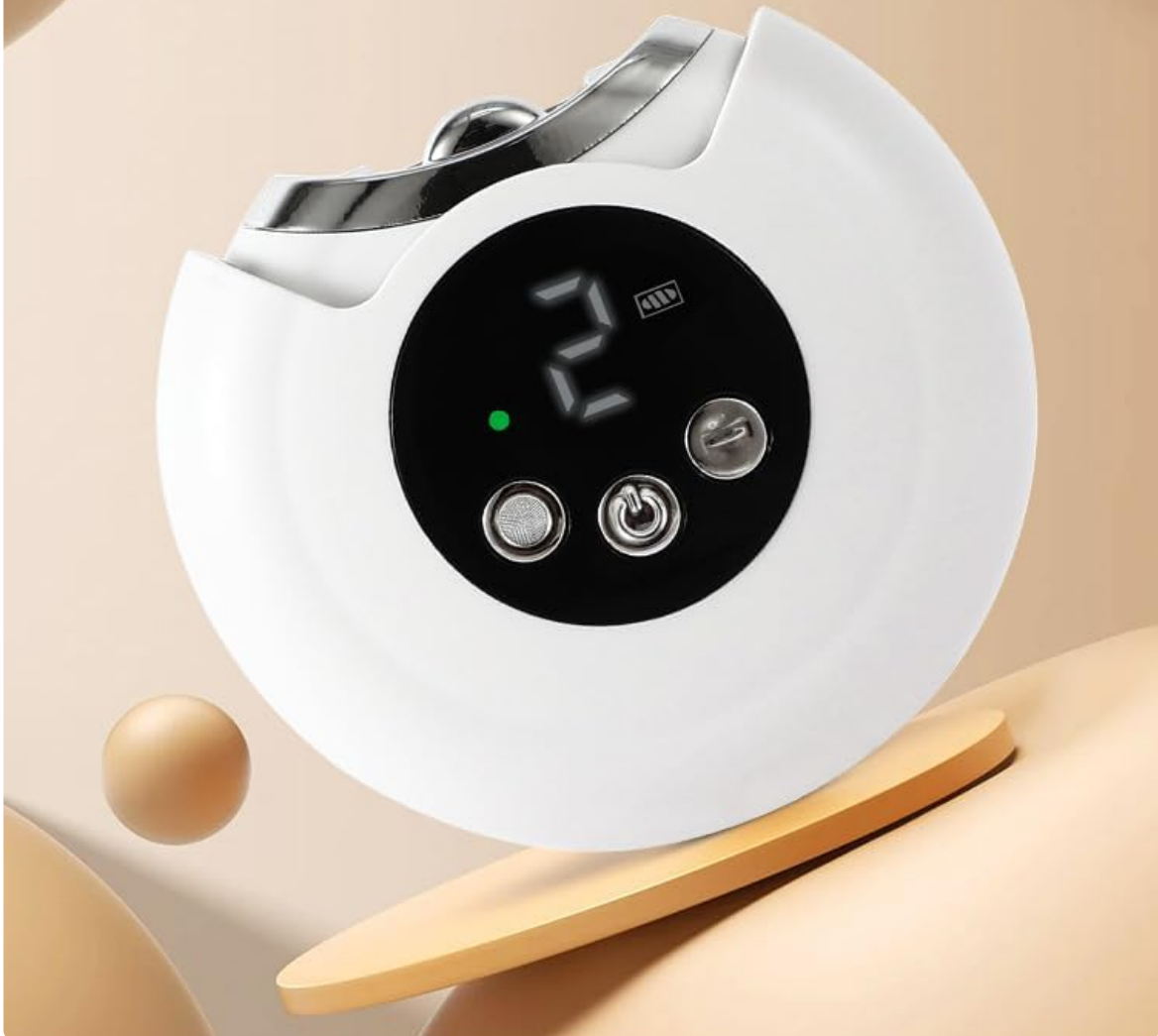
Image: The device displaying its LCD screen, indicating speed settings and battery status.

Numerous design modifications For a simple and stylish look