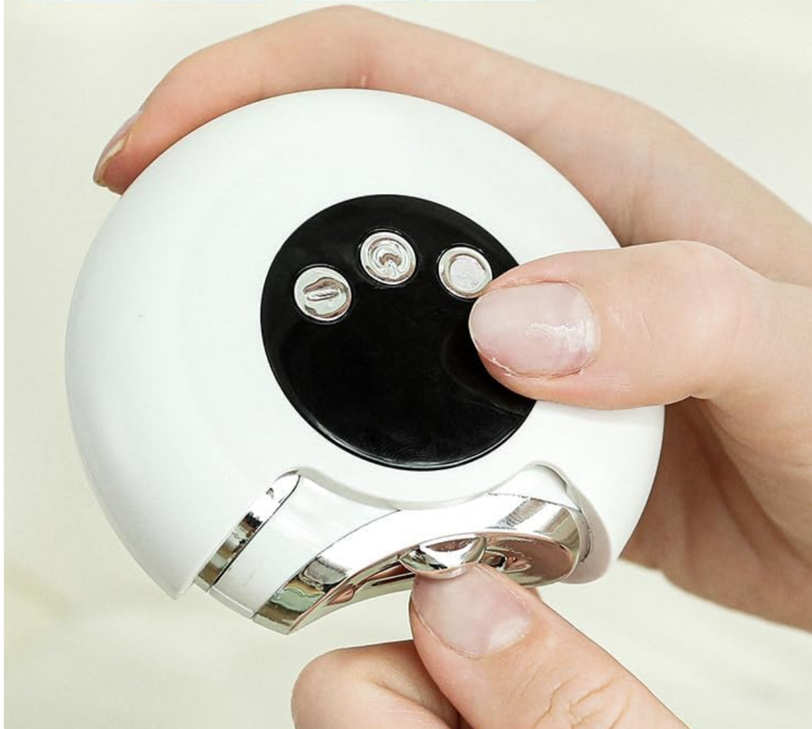
Image: Illustration of the two-in-one functionality, showing how the clipper trims and polishes nails for a smooth, glossy finish.