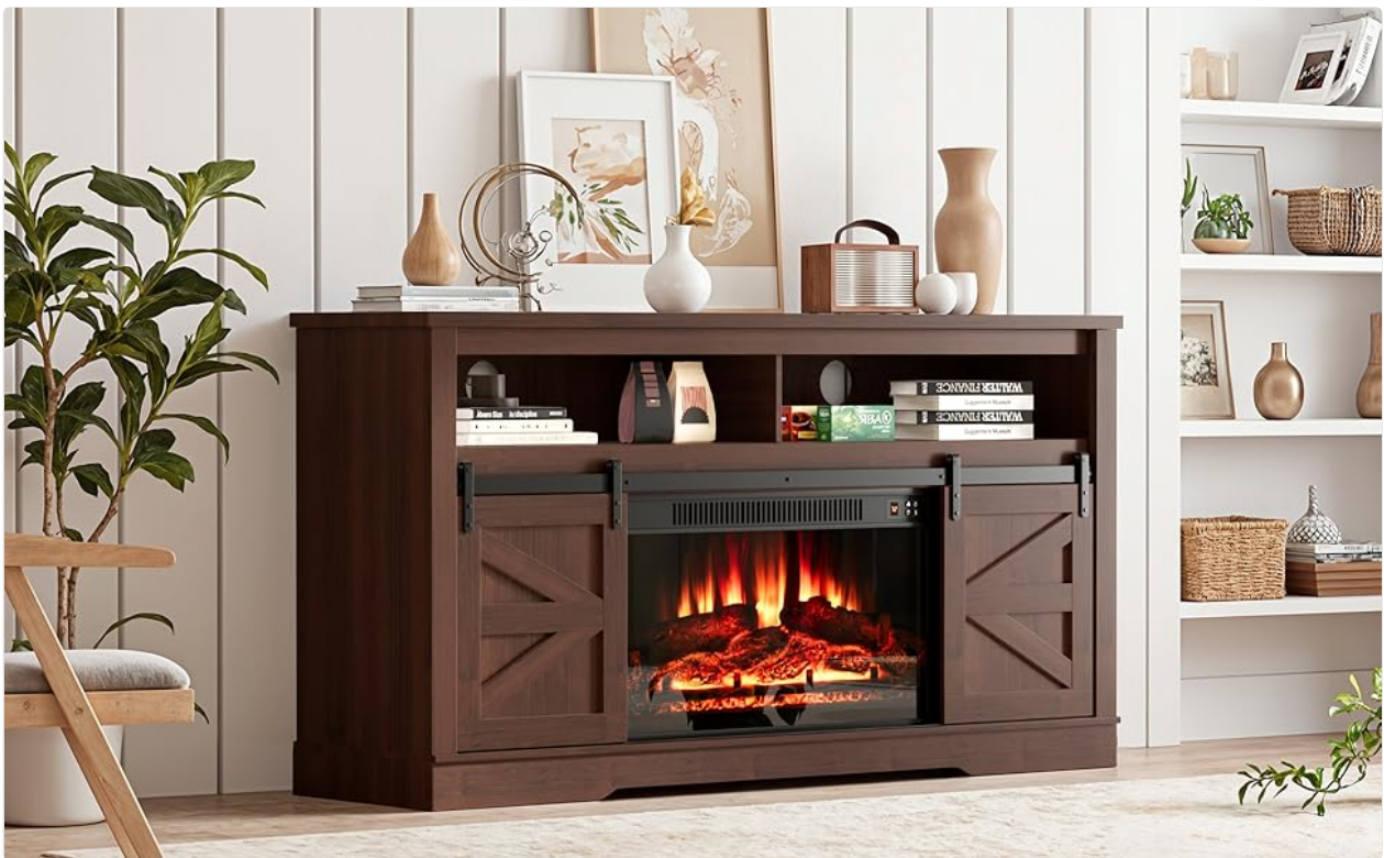
Figure 4.1: Detachable fireplace feature, allowing for versatile use of the TV stand.