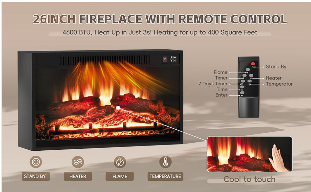
Figure 5.1: Electric fireplace features and remote control functions.