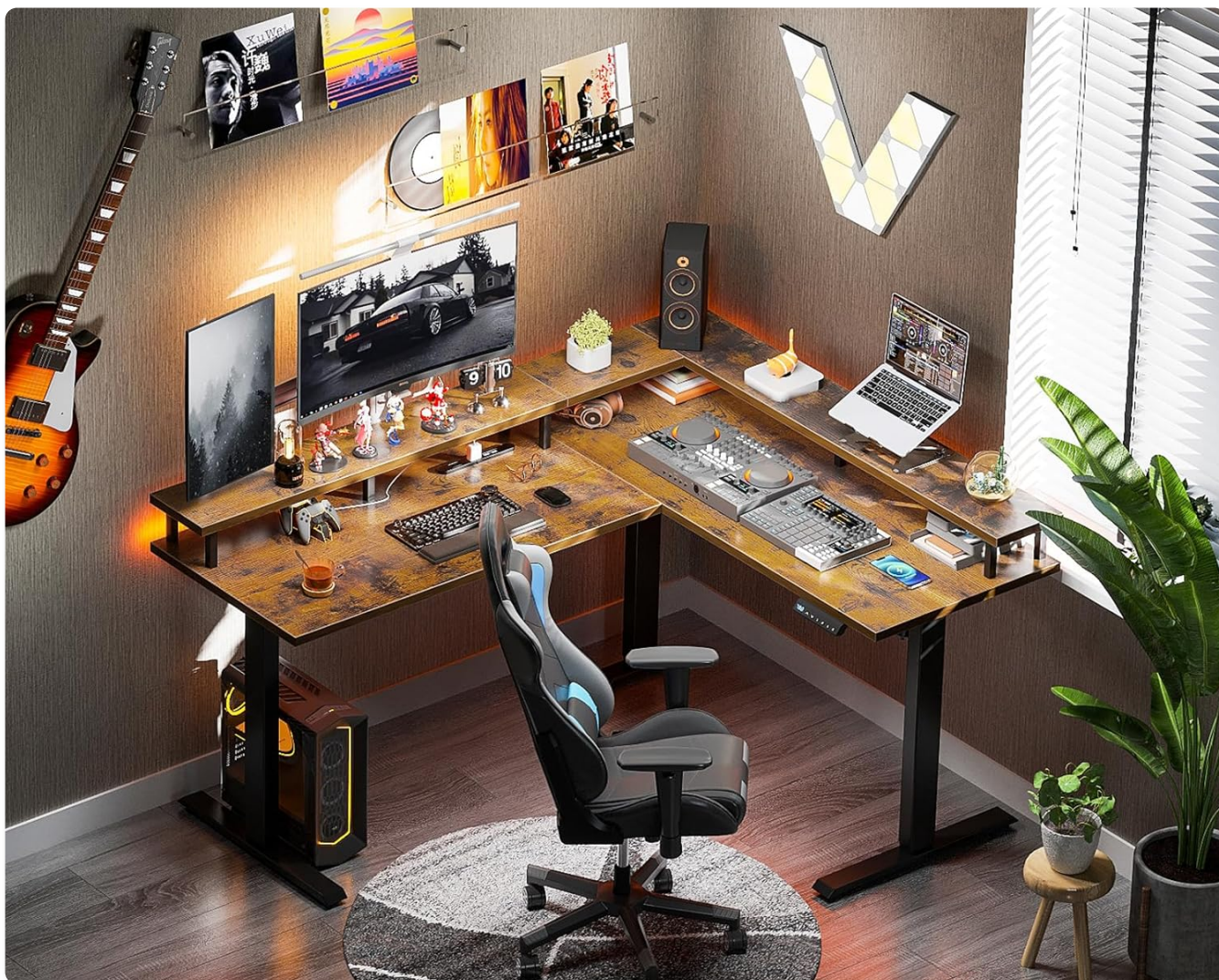
Figure 1: ODK L-Shaped Electric Standing Desk in a modern office setup.

Thank you for choosing the ODK Electric L-Shaped Standing Desk. This manual provides essential information for the safe assembly, operation, and maintenance of your new desk. Please read it thoroughly before use and keep it for future reference.