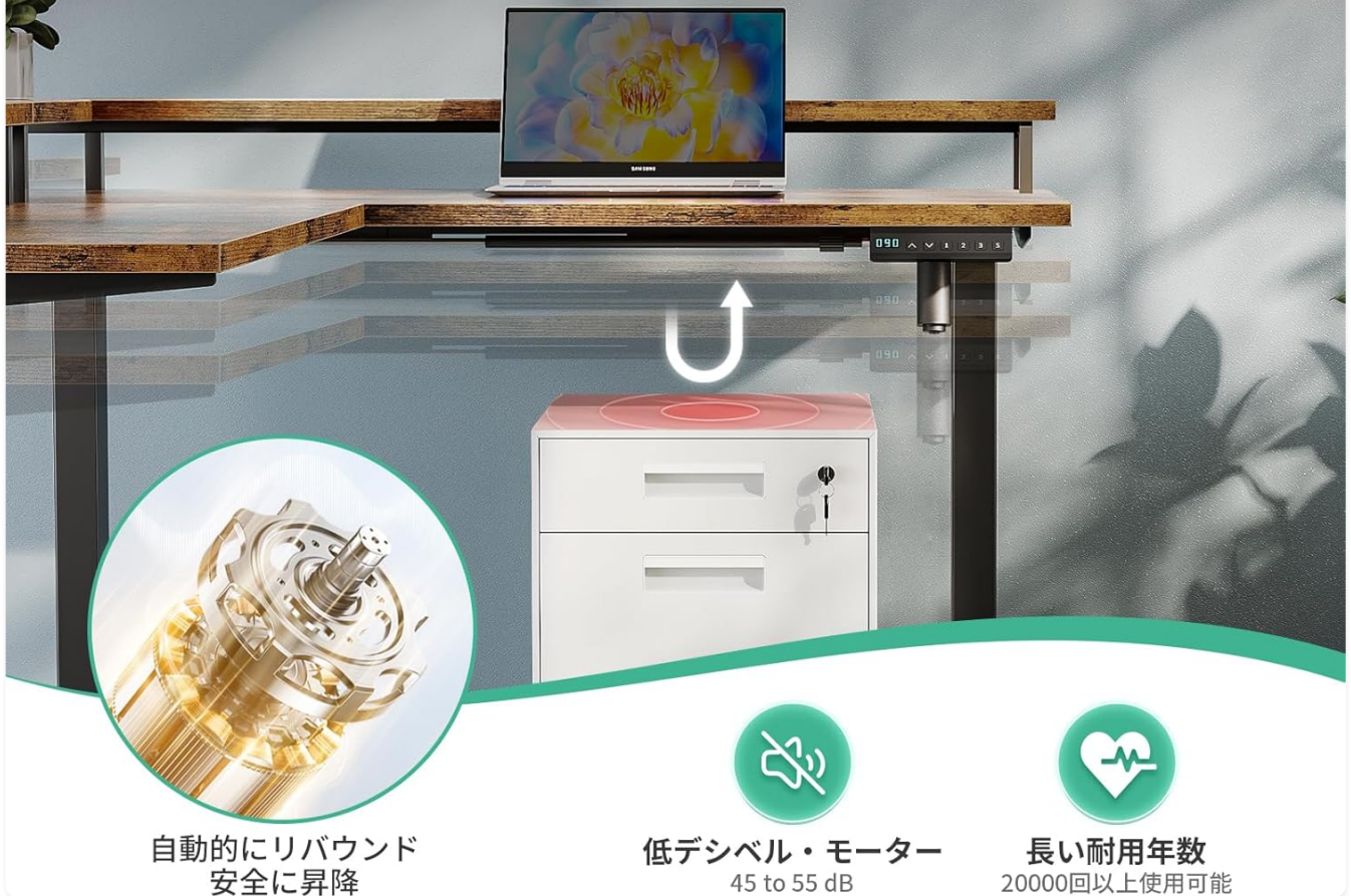
Figure 4: Anti-Collision Motor and Safety Features.