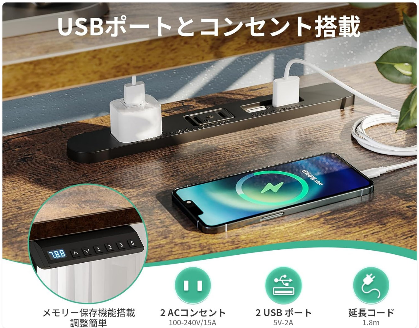
Figure 3: Control Panel with Memory Presets and Power Outlets.