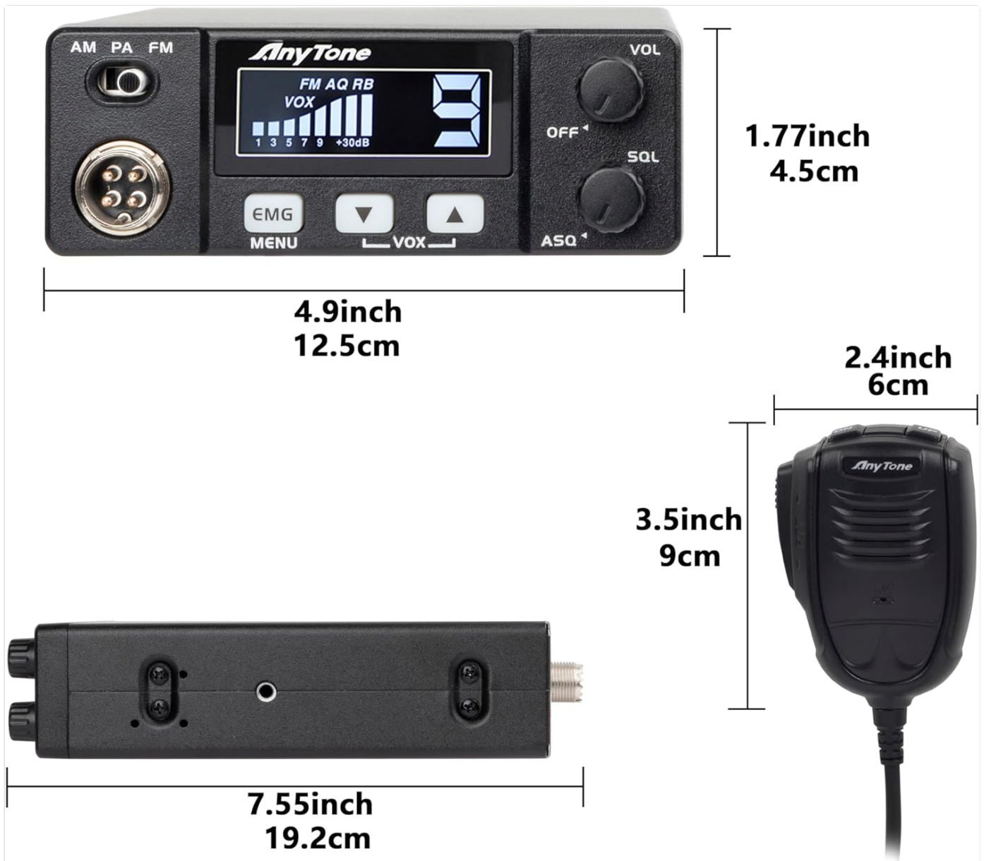
Figure 4: Dimensions of the AT-505PRO CB Radio and Microphone.