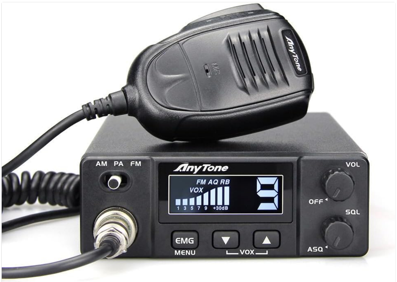
Figure 3: AnyTone AT-505PRO CB Radio in operation.