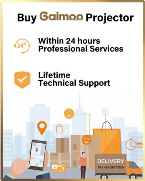
Image: Gaimoo's commitment to customer satisfaction, highlighting 24-hour professional services and lifetime technical support.