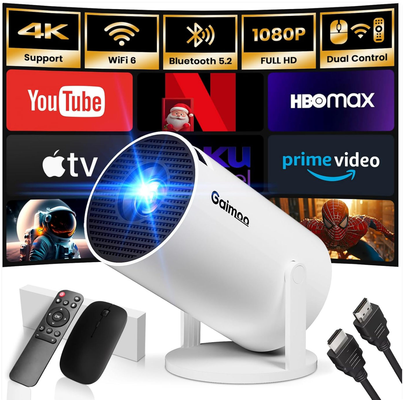
Image: The Gaimoo GM200 Mini Projector shown with its included accessories, highlighting the compact design and the dual control options.