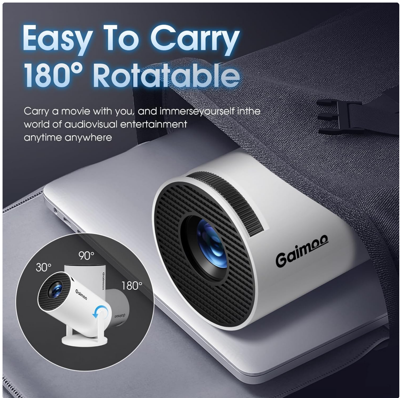
Image: The Gaimoo GM200 projector demonstrating its 180-degree rotatable stand, allowing for flexible projection angles.

Position the projector on a stable, flat surface. The 180° rotatable stand allows you to adjust the projection angle to suit your viewing needs, whether projecting on a wall, ceiling, or screen.