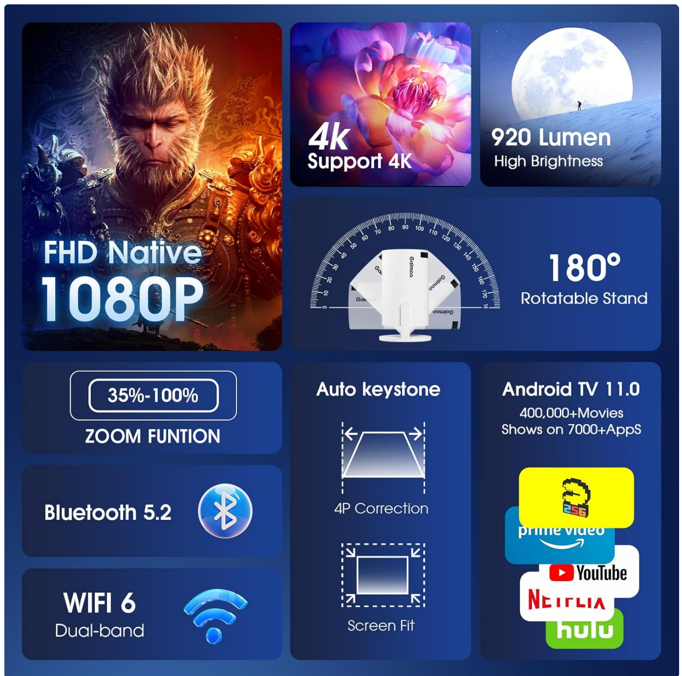
Image: A visual representation of the projector's auto keystone correction feature, which automatically adjusts the image to be rectangular, and the digital zoom function.

perpendicular to the screen. Manual adjustments may also be available in the settings menu for fine-tuning.