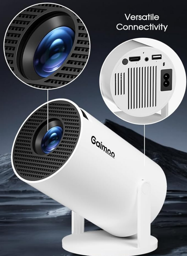
Image: A detailed view of the Gaimoo GM200 projector, illustrating its various input/output ports including HDMI, USB, and 3.5mm audio jack, along with the projection lens.