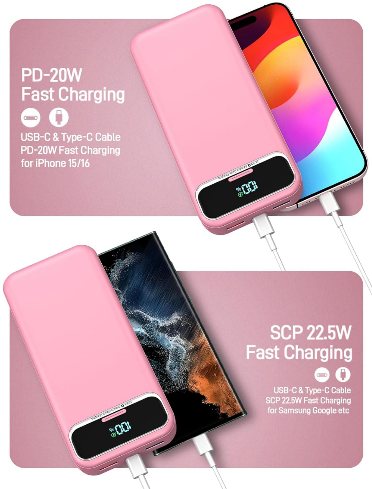
Image 5.1: Charging an iPhone using the built-in iOS cable, demonstrating PD-20W fast charging.

Once connected, your device should begin charging automatically. The LED display on the power bank will show the remaining battery percentage.