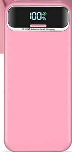
Image 4.2: Recharging the power bank using the Type-C cable input.