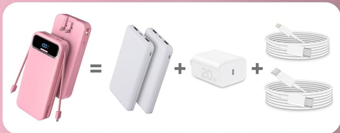
Image 3.1: The Nusyddy AC-02EP Portable Charger highlighting its built-in cables and foldable AC wall plug.