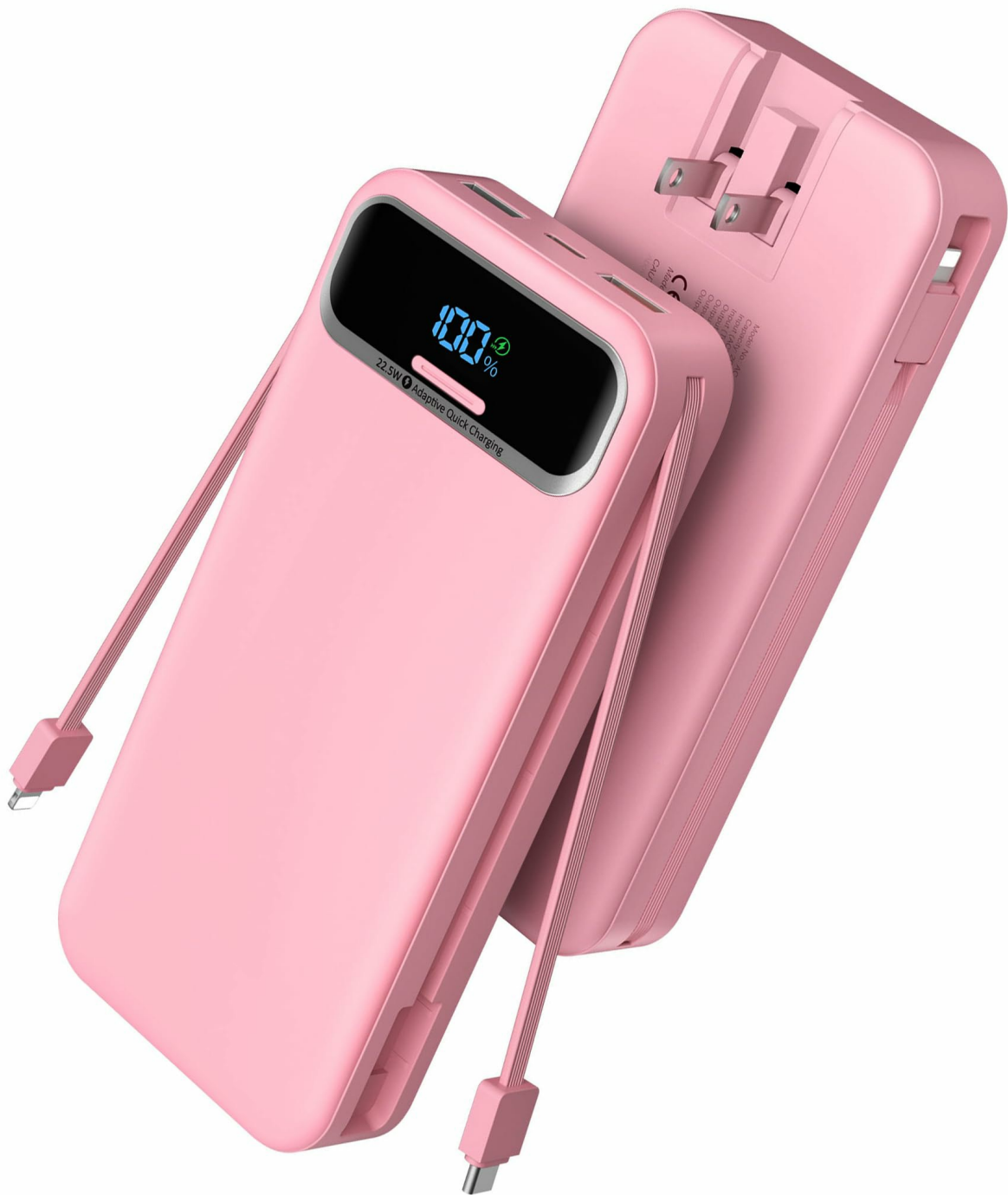
Image 7.1: Overview of the multiple safety protection features integrated into the power bank.