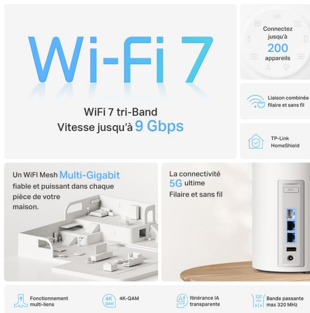
Figure 3: Overview of the Deco BE65 Pro's key WiFi 7 features.