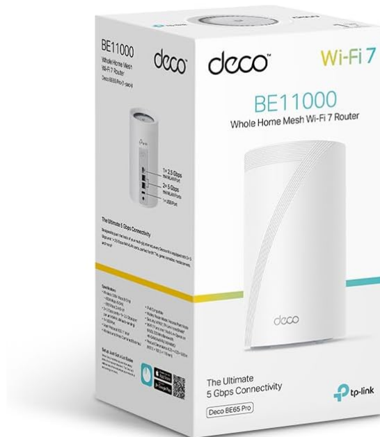
Figure 2: The product packaging, indicating the contents and model information.