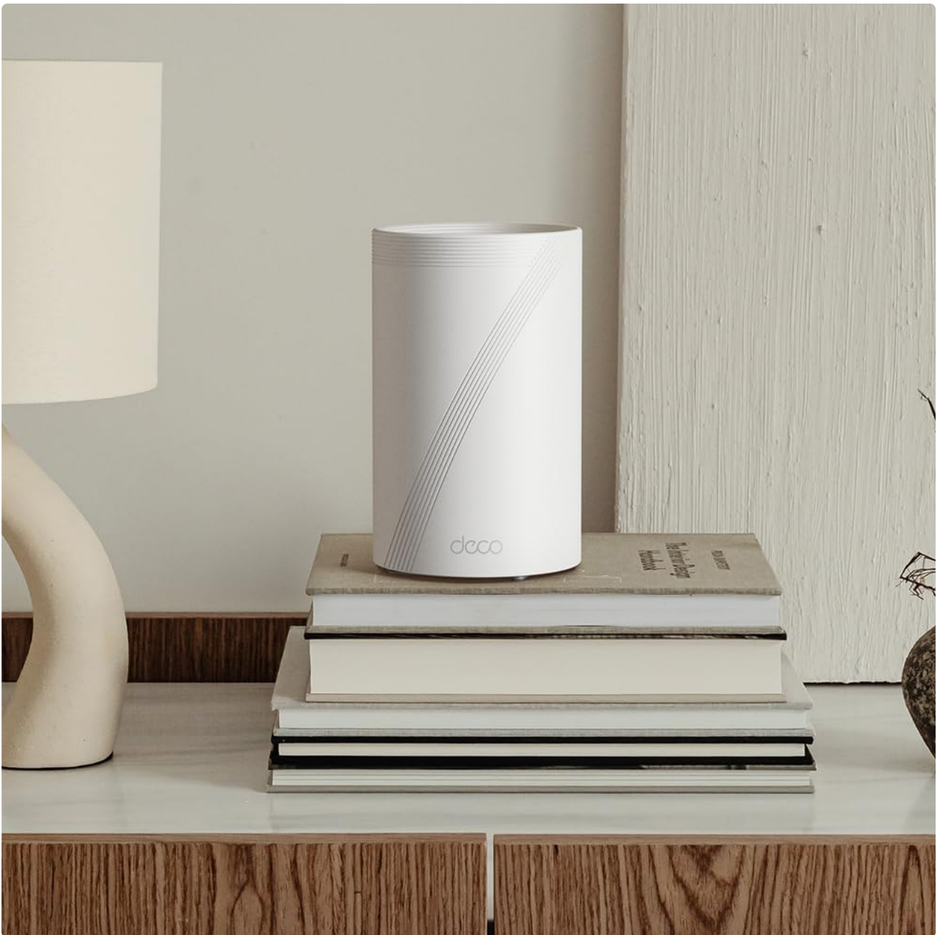
Figure 1: A single TP-Link Deco BE65 Pro unit in a home environment.