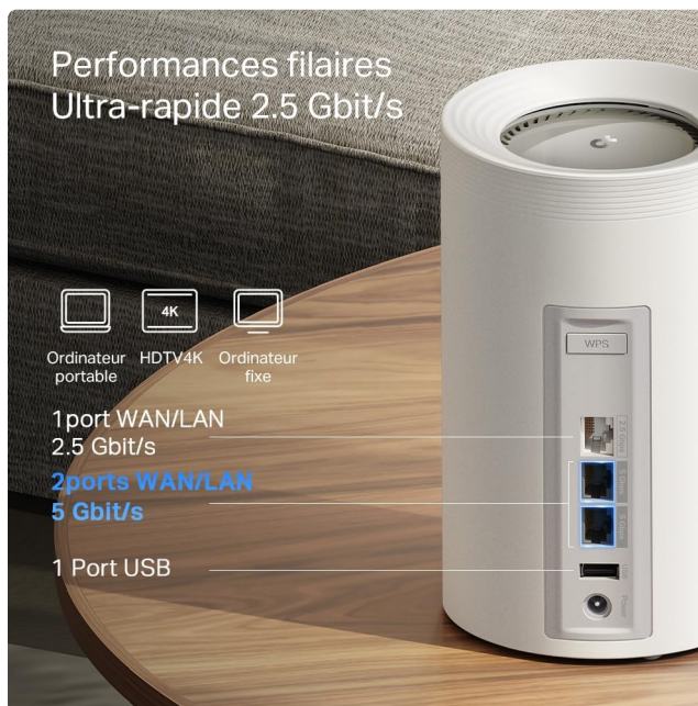
Figure 4: Detailed view of the high-speed WAN/LAN and USB ports on a Deco BE65 Pro unit.