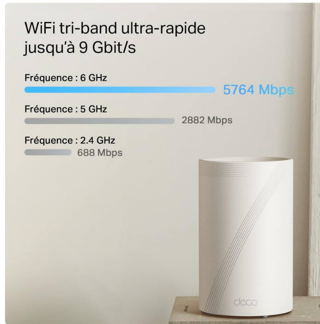
Figure 6: Illustration of the ultra-fast tri-band Wi-Fi speeds.

Below are the technical specifications for the TP-Link Deco BE65 Pro Mesh System: