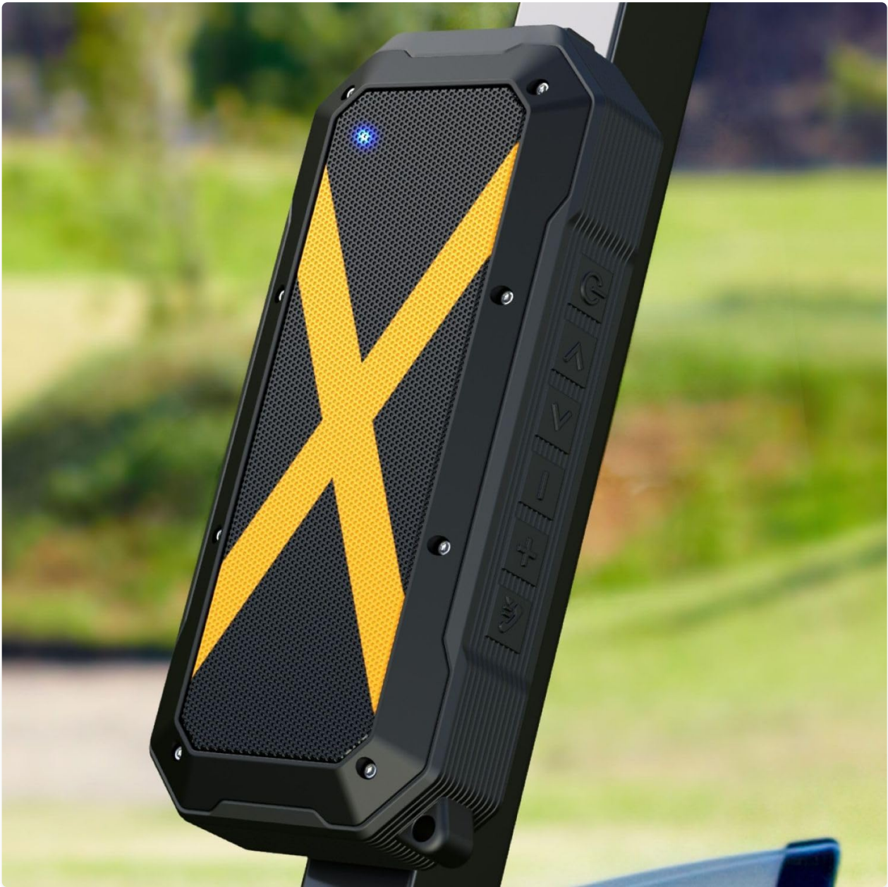
The ShellHome SP-003 speaker magnetically attached to the metal frame of a golf cart, demonstrating its primary mounting feature for outdoor use.