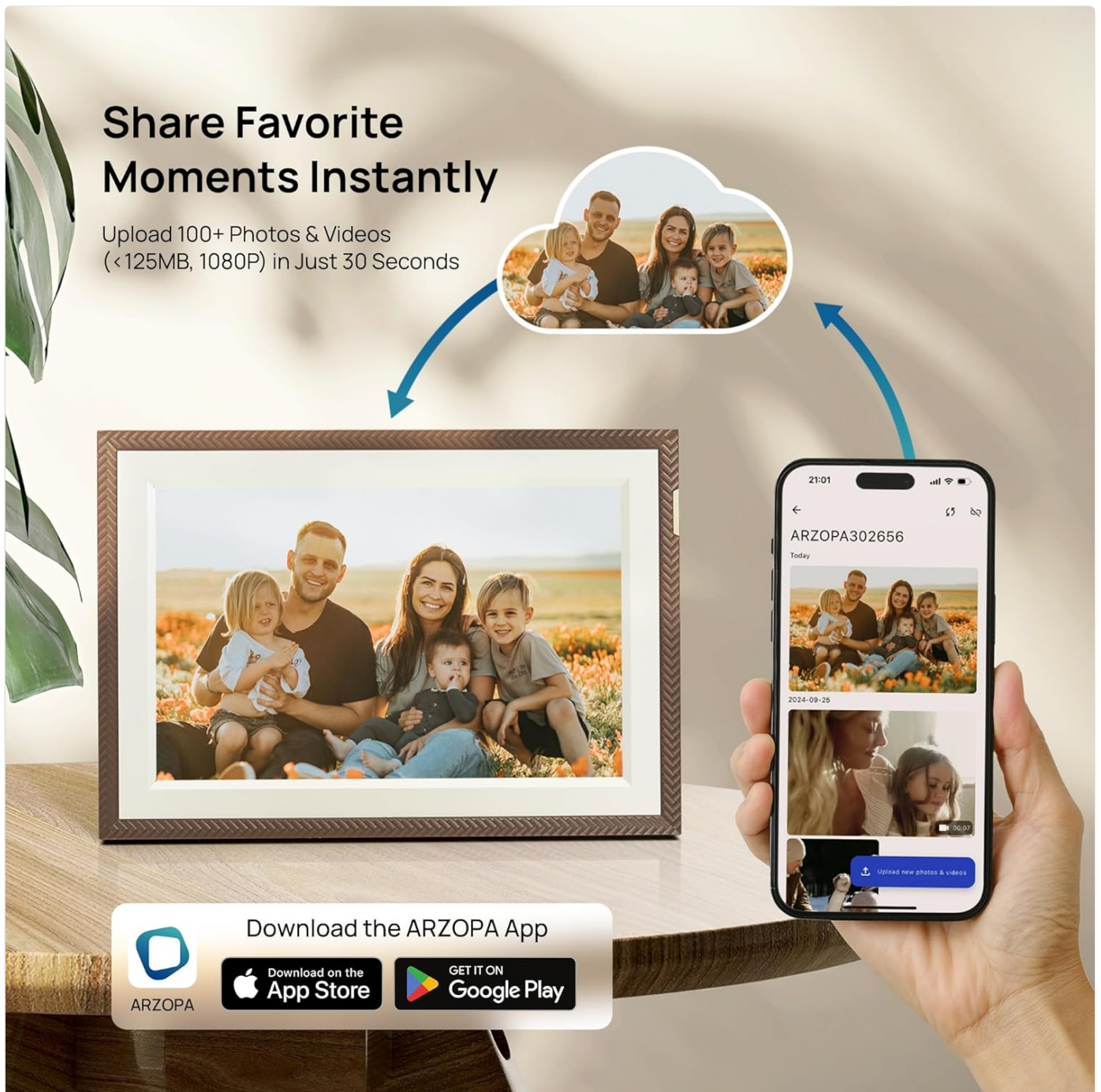
Figure 6.1: Share Favorite Moments Instantly