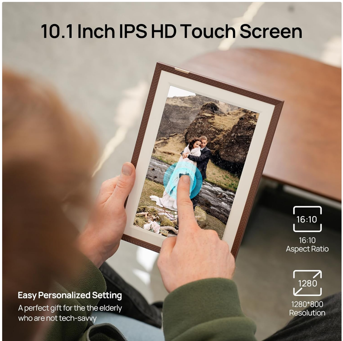
Figure 4.1: Front View - 10.1" IPS HD Touch Screen

The front of the frame features a 10.1-inch IPS HD anti-glare touch screen for vibrant photo and video display and easy interaction.