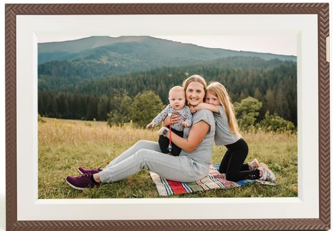
Receiving photos at home