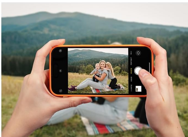
Photos taken outdoors