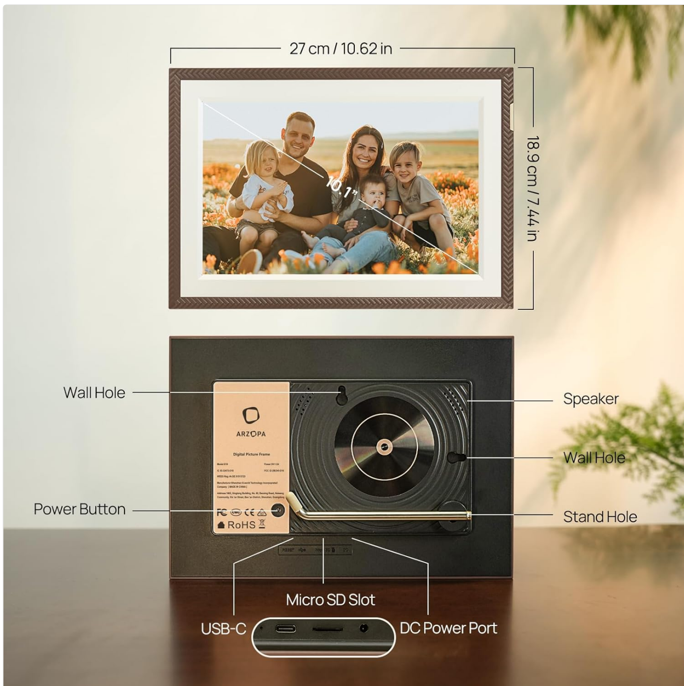
Figure 4.2: Rear View with Ports and Controls