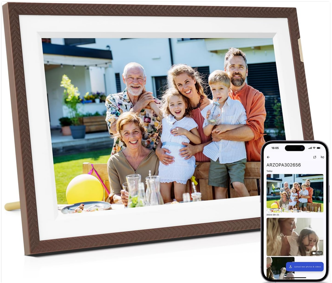
Figure 1.1: ARZOPA 10.1" WiFi Digital Picture Frame