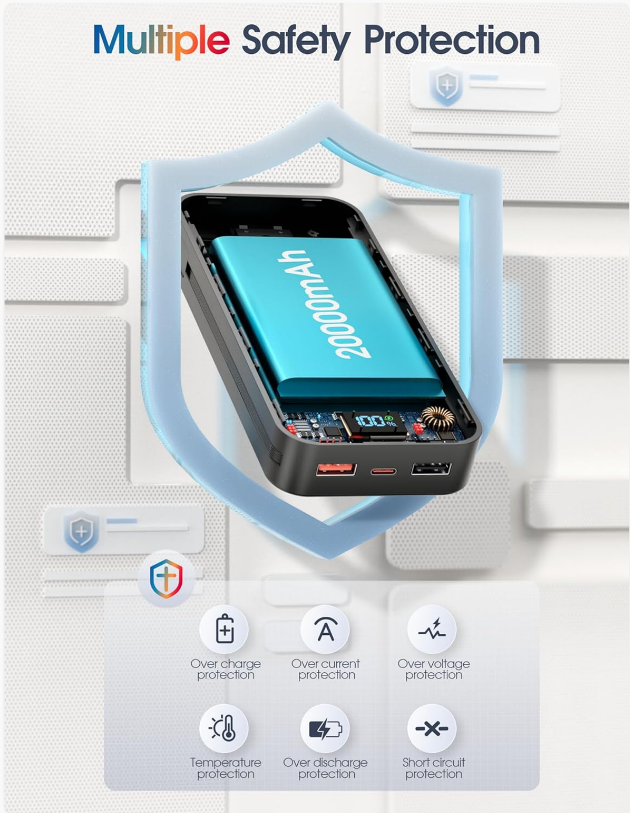
Figure 10: The power bank incorporates a superior safety protection system, guarding against overcharge, overcurrent, overvoltage, high temperature, over-discharge, and short circuits.