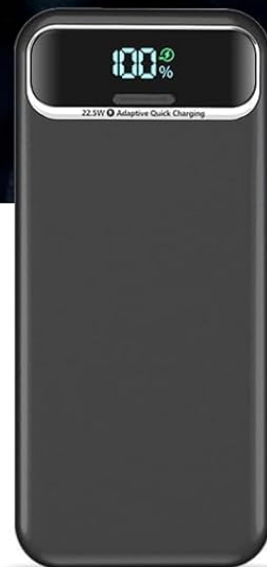
Figure 8: The integrated LED digital display provides a precise real-time indication of the remaining power, allowing you to monitor the battery level easily.