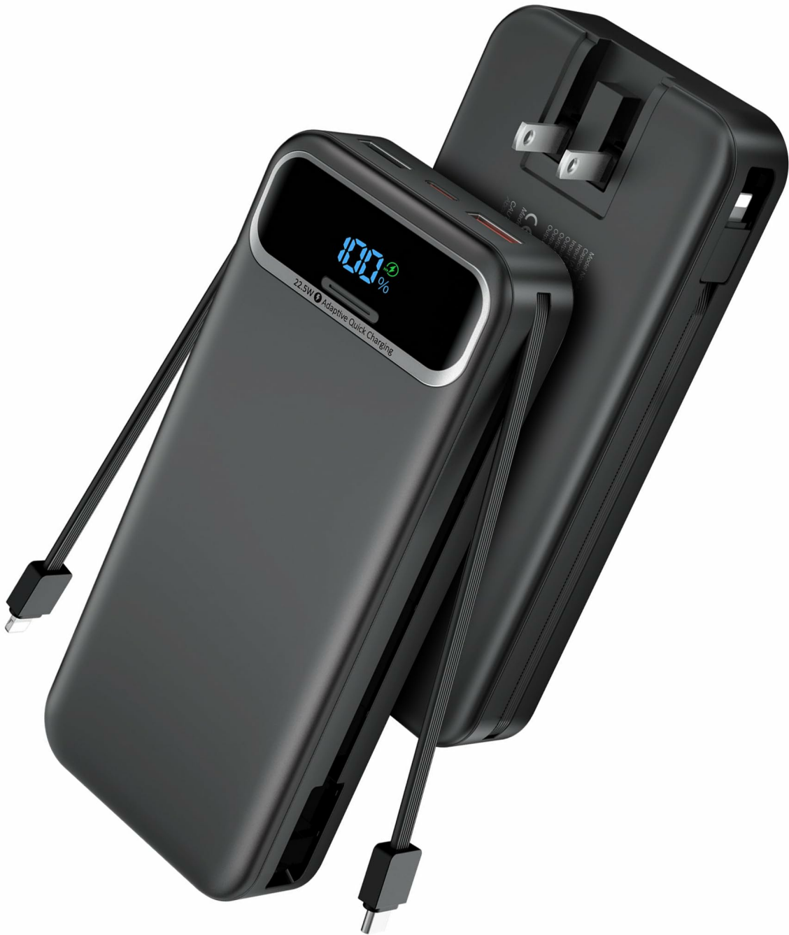
Figure 1: Nusydd 20000mAh Portable Charger with built-in cables and wall plug, showcasing its compact design.