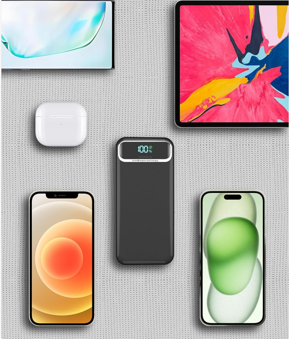
Figure 9: The power bank is designed to charge up to 5 devices concurrently, including smartphones, tablets, and wireless earbuds, using its various output ports and built-in cables.