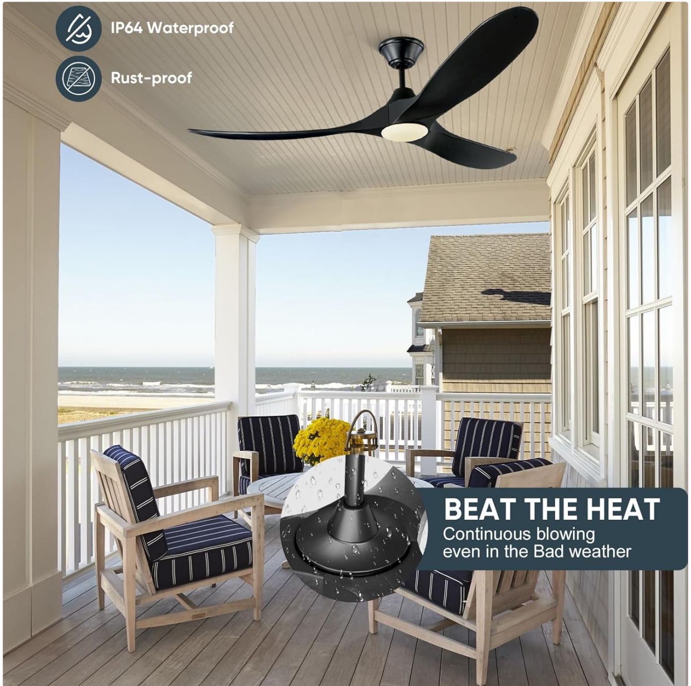
Image: The fan's damp-rated design makes it suitable for covered outdoor areas, requiring minimal maintenance against elements.