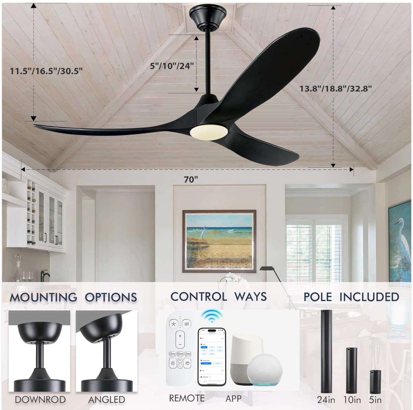
Image: The XCWIIIE 70-inch ceiling fan components, including the motor housing, three solid wood blades, light kit, remote control, and three downrods (5", 10", 24").