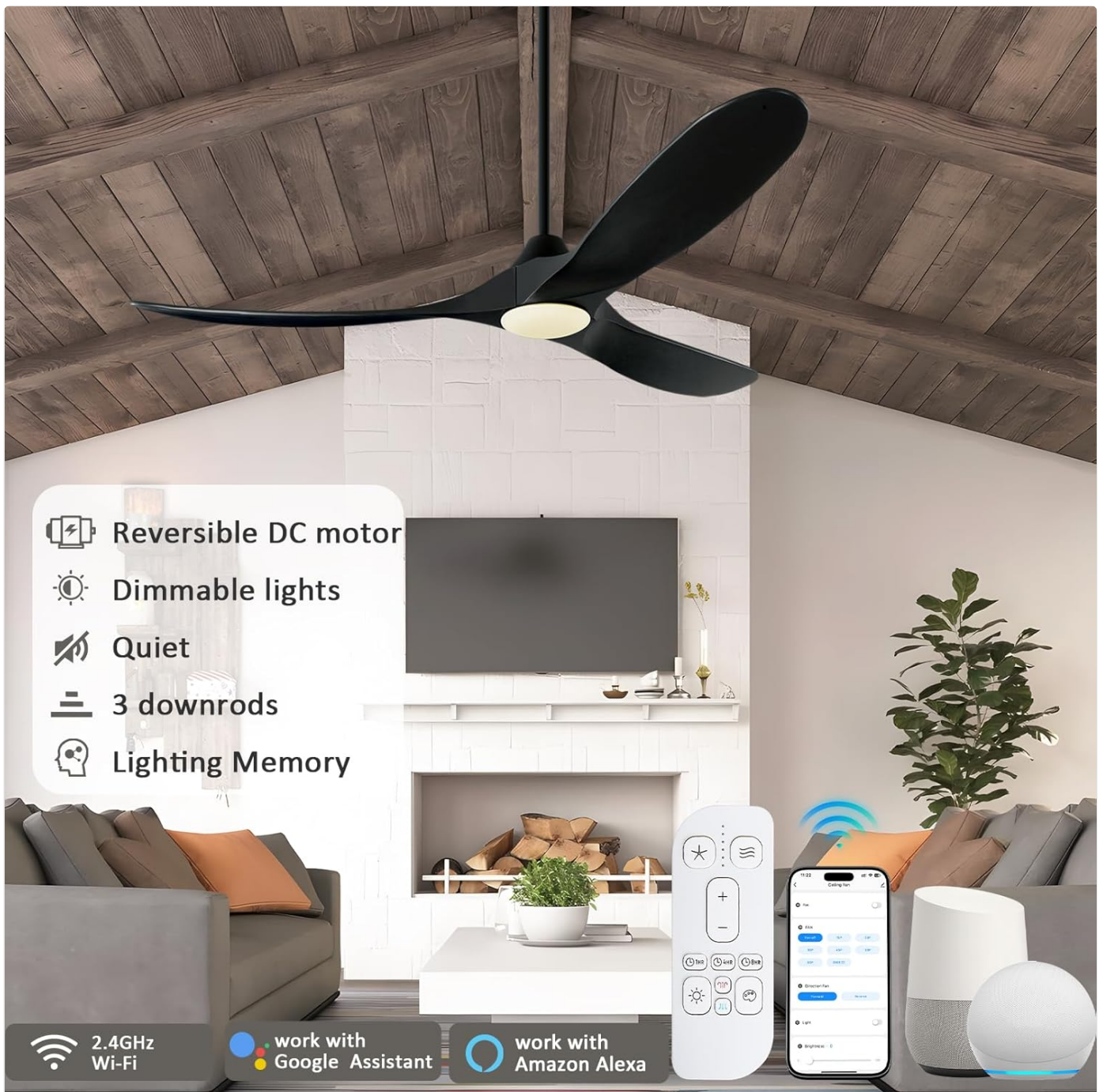
Image: The XCWIE ceiling fan installed in a living room, showcasing its modern design and key features.