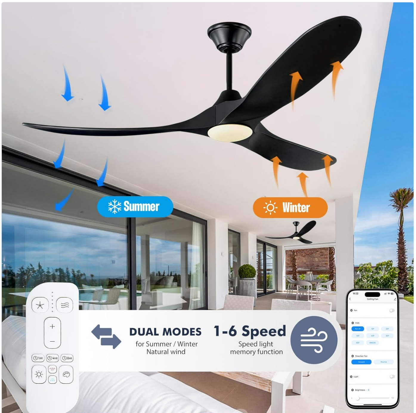
Image: The remote control for the XCWIIE ceiling fan, illustrating its various buttons for fan speed, light control, and seasonal modes.