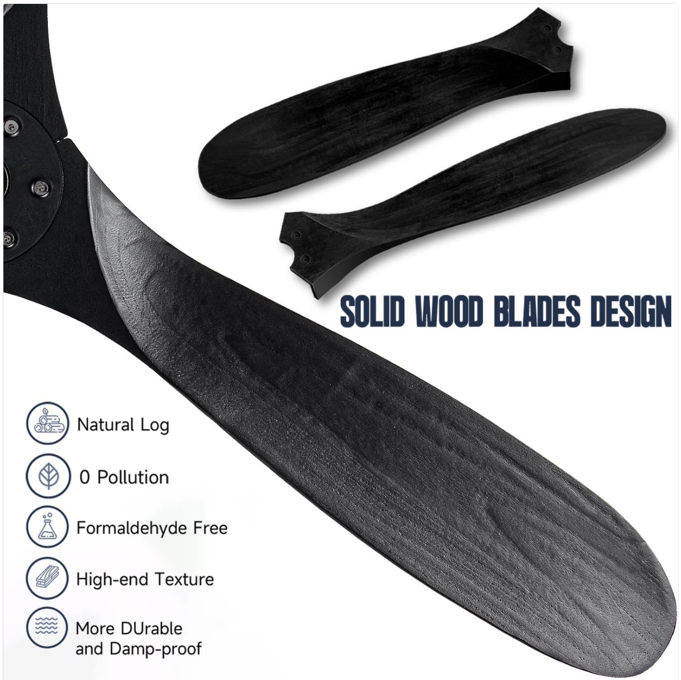
Image: Detailed view of the fan's solid wood blades, emphasizing their natural log appearance and quality construction.