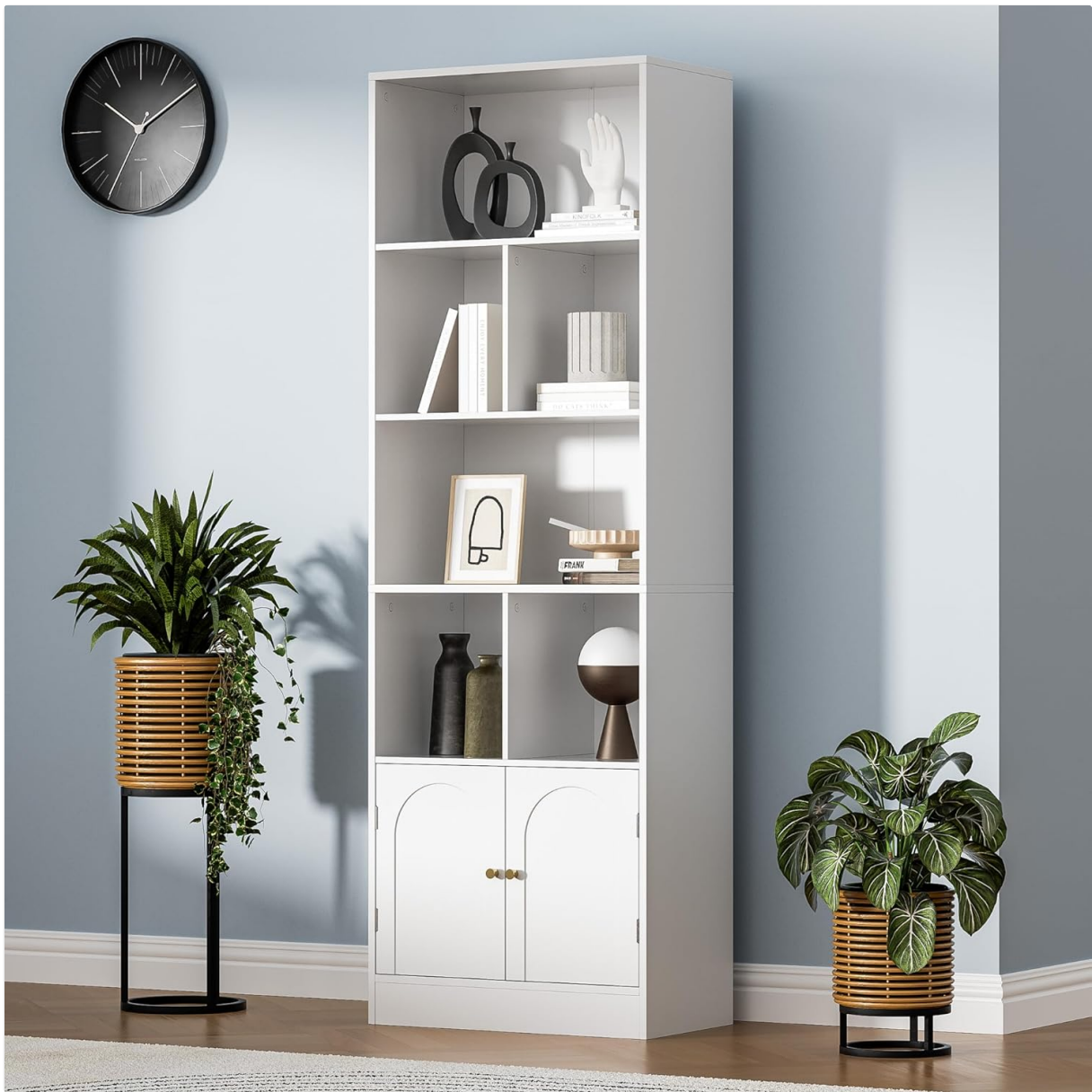
Image: The assembled Housoul bookshelf in a living room, showcasing its storage capacity and modern design with various items displayed on its open shelves and within its cabinet.