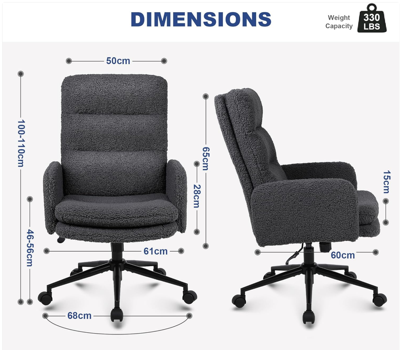
Image: Detailed dimensions of the chair, including height, width, depth, and seat height range, along with a 330 lbs weight capacity.