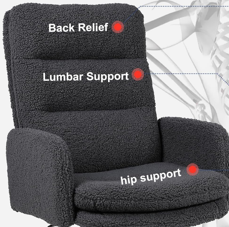
Image: Diagram illustrating the ergonomic design of the chair, showing points of back relief, lumbar support, and hip support.