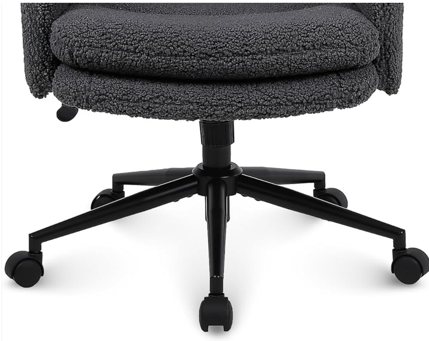
Image: Front view of the dark grey Youhauchair Cashmere Office Chair, showcasing its high back and padded armrests.