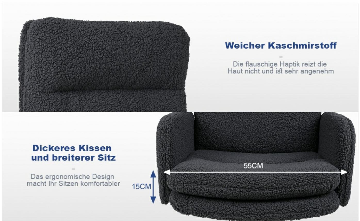
Image: Detailed view of the soft cashmere fabric and the 15 cm thick seat cushion, emphasizing comfort.