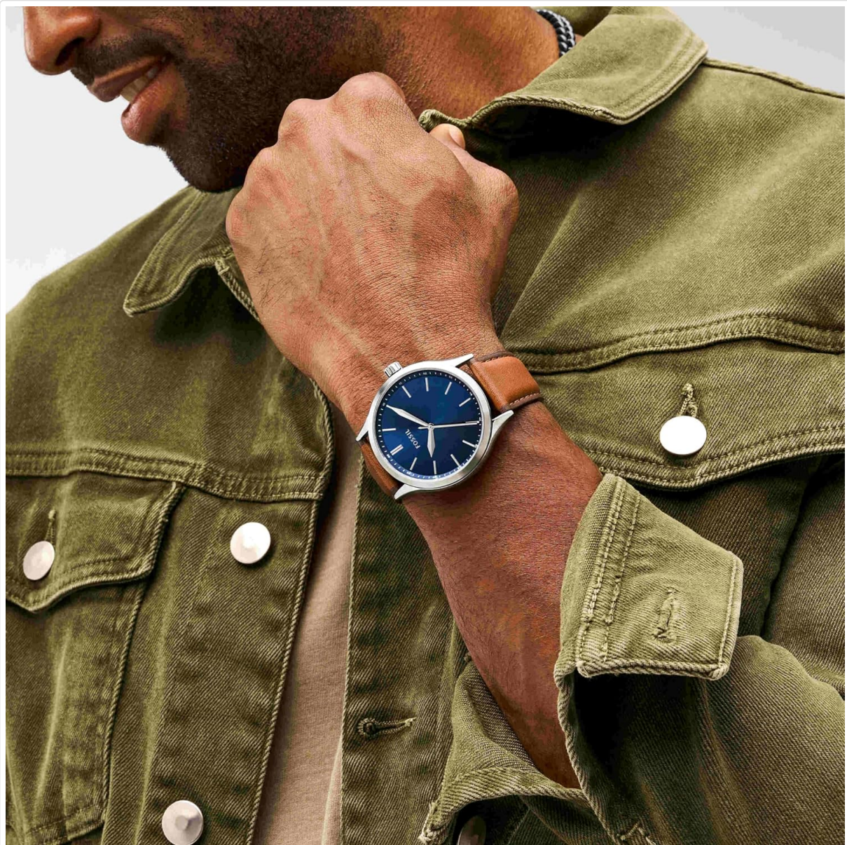
Image: The Fossil Fenmore BQ2863 watch displayed on a wrist.

Your Fossil Fenmore BQ2863 watch is powered by a precise quartz movement, providing accurate timekeeping. Ensure the crown is fully pushed in for continuous operation.