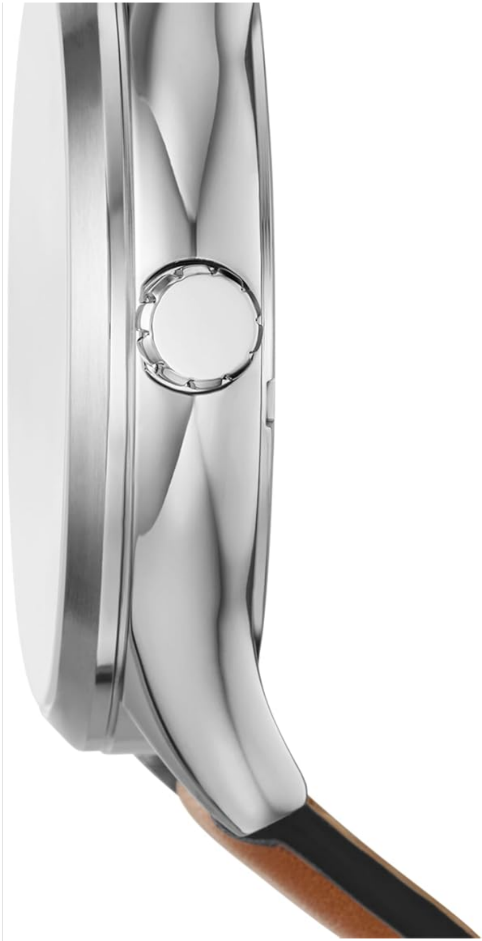
Image: Side view of the watch, highlighting the crown for time adjustment.