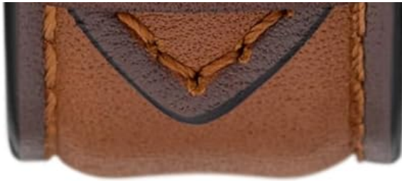
Image: Detail of the watch's leather strap and toggle clasp mechanism.