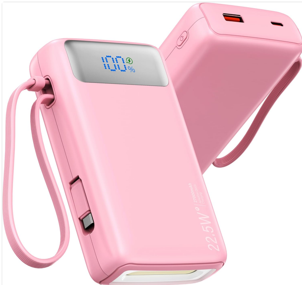
Nusyddy 27000mAh Portable Charger (Pink)