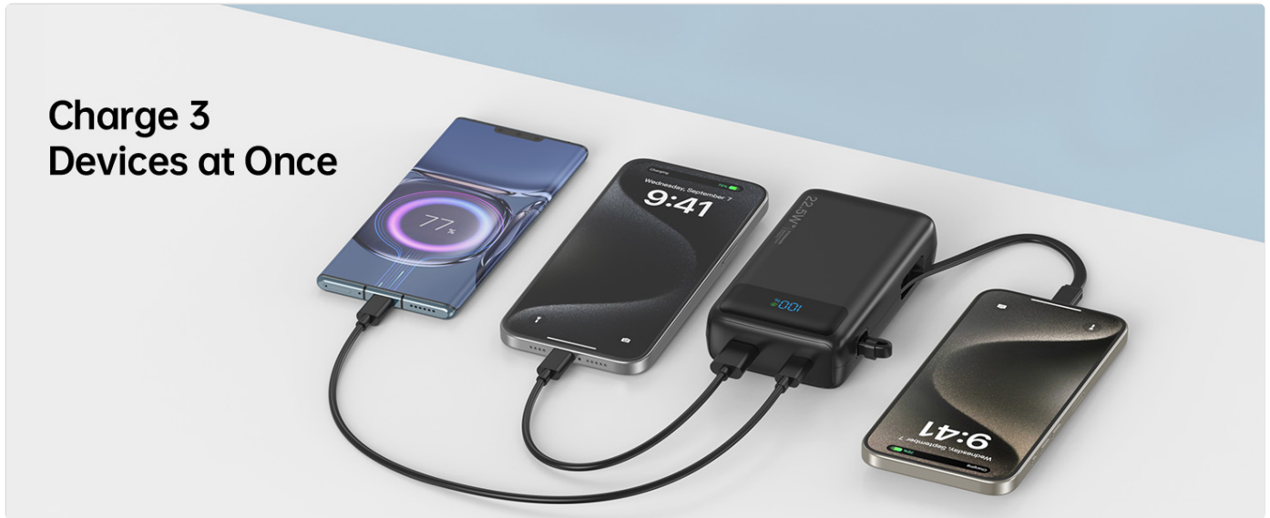
Figure 2: Charging three devices simultaneously.

You can charge up to three devices at once by utilizing the built-in USB-C cable, the USB-C port, and the USB-A port simultaneously.