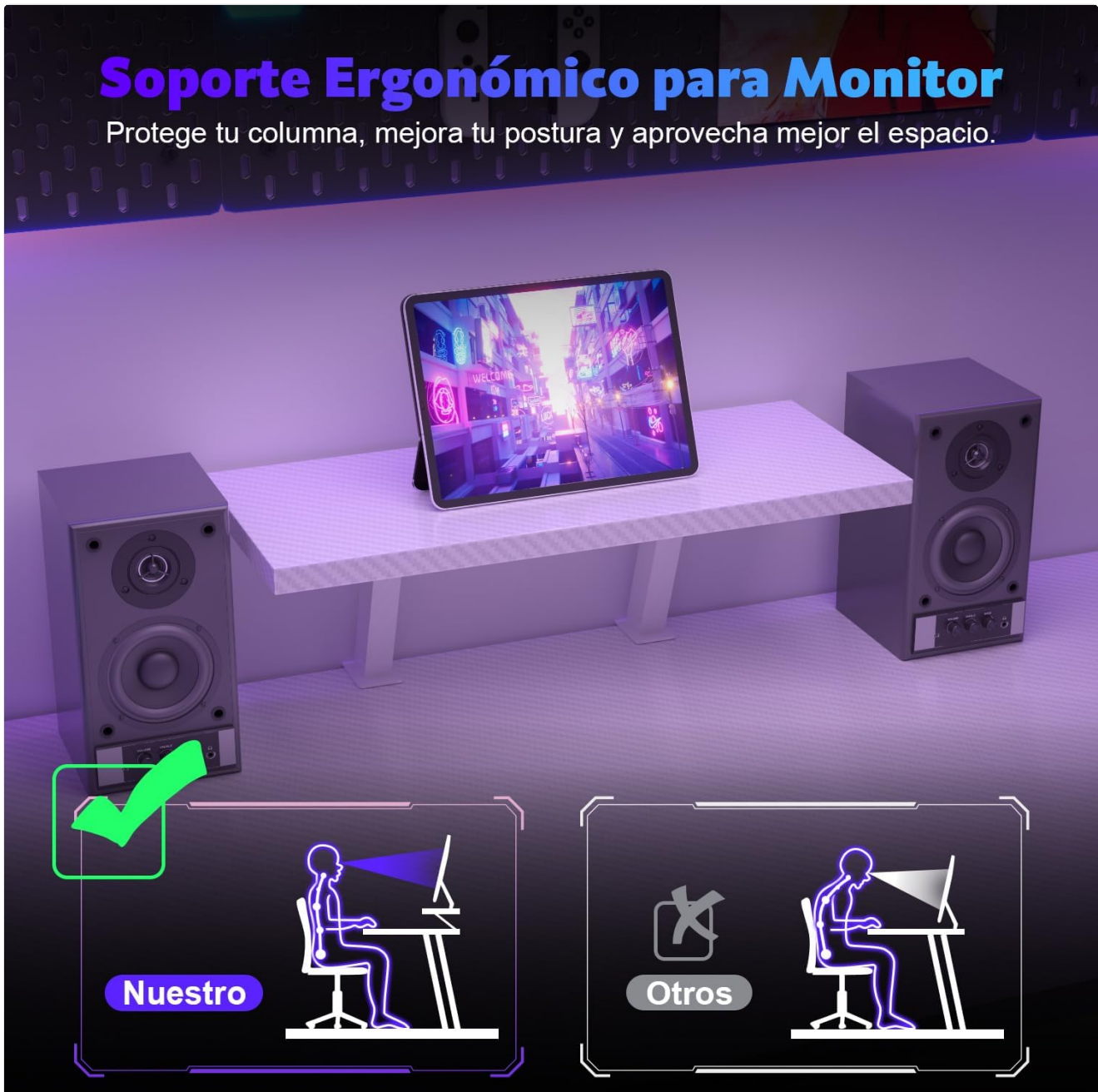
Image: A visual comparison showing how the ergonomic monitor stand helps maintain proper posture compared to a desk without