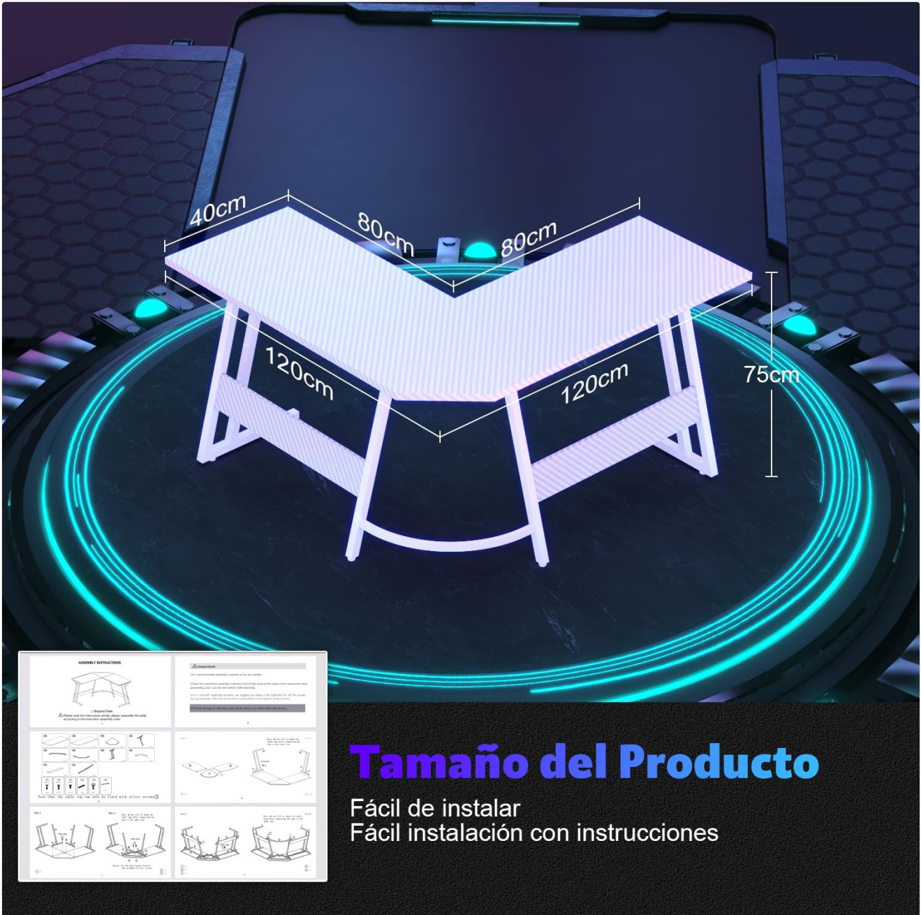
Image: A diagram illustrating the dimensions of the L-shaped desk (120x120cm surface, 75cm height) and the monitor stand.