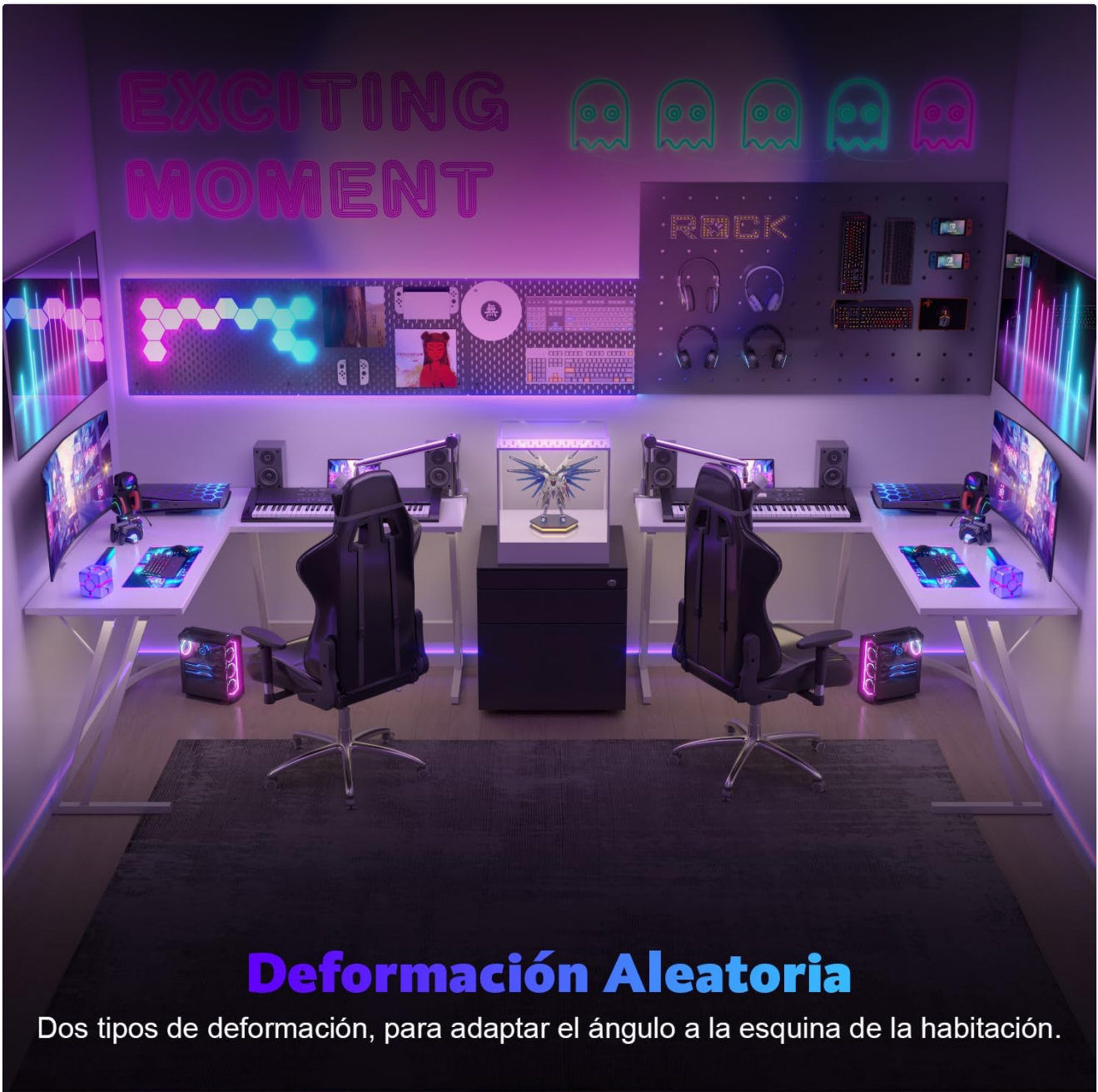
Image: Two Devoko L-shaped desks arranged to form a larger workspace, demonstrating flexible configuration options for gaming or office environments.