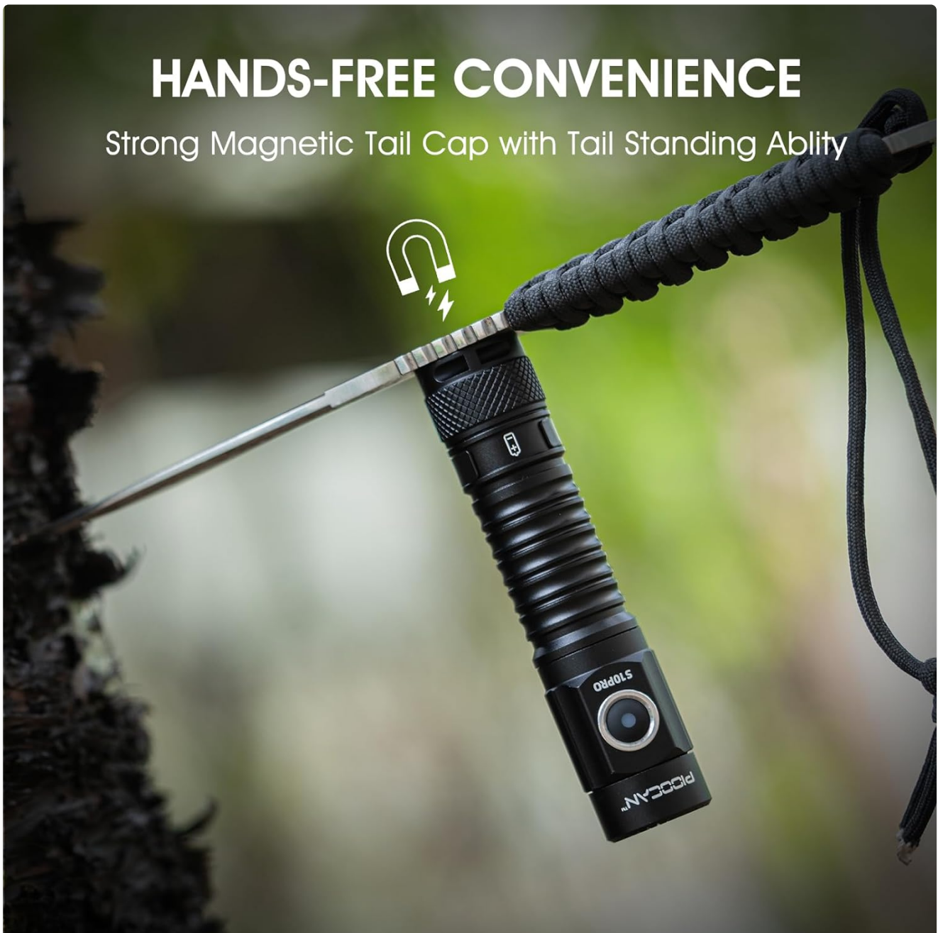
Image: The S10Pro flashlight demonstrating its magnetic tail cap feature, allowing it to be attached to a metal surface for hands-free use.