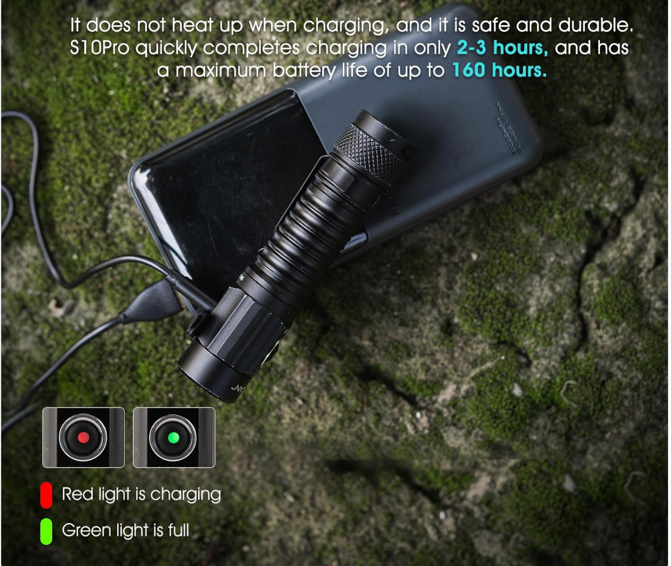
Image: The S10Pro flashlight connected to a USB-C charger, showing the red light indicating charging and the green light for a full charge.

It does not heat up when charging, and it is safe and durable. S10Pro quickly completes charging in only 2-3 hours , and has a maximum battery life of up to 160 hours .