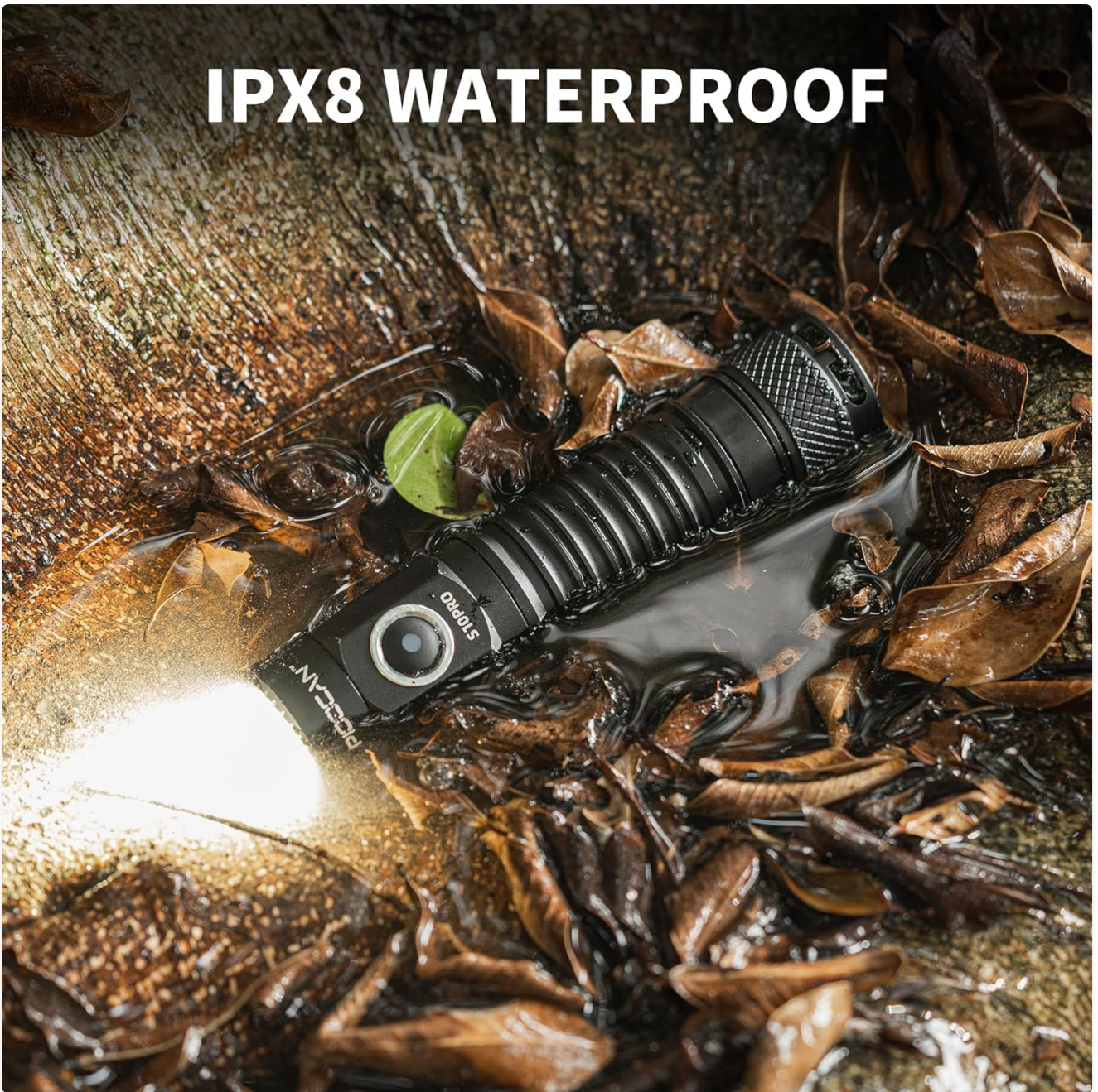
Image: The S10Pro flashlight partially submerged in water, illustrating its IPX8 waterproof capability.