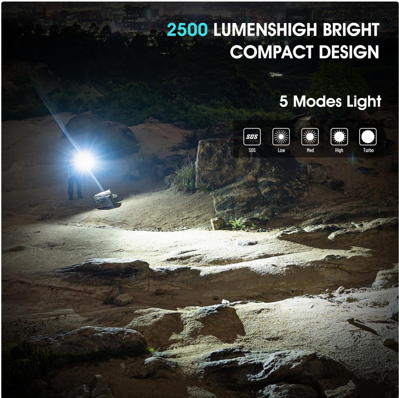
Image: Visual representation of the S10Pro's five lighting modes: SOS, Low, Med, High, and Turbo.