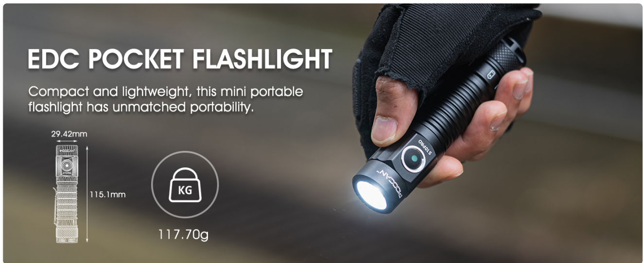
Image: The S10Pro flashlight with its compact dimensions (115.1mm length, 29.42mm head diameter, 117.70g weight) highlighted.