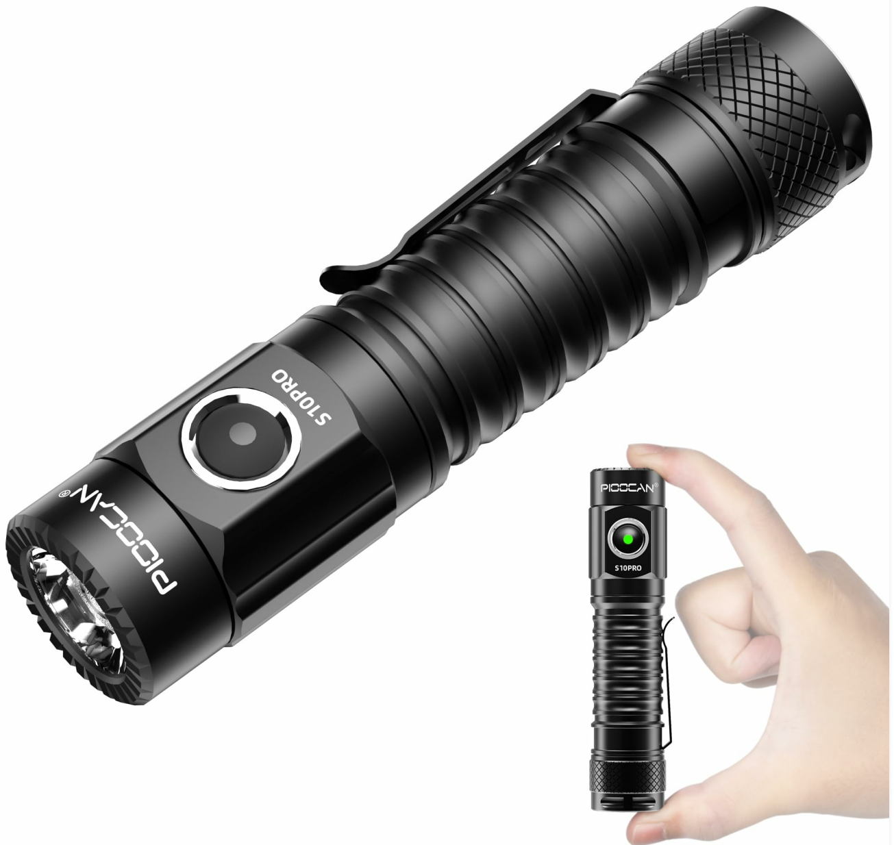
Image: The PIOCAN S10Pro Rechargeable Flashlight, a compact and powerful illumination tool.