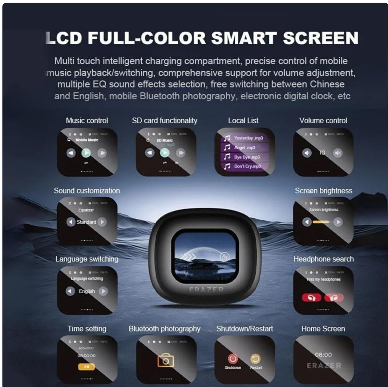
Image: A detailed view of the LCD full-color smart screen interface on the charging case, showing various control options like music, volume, sound customization, and settings.