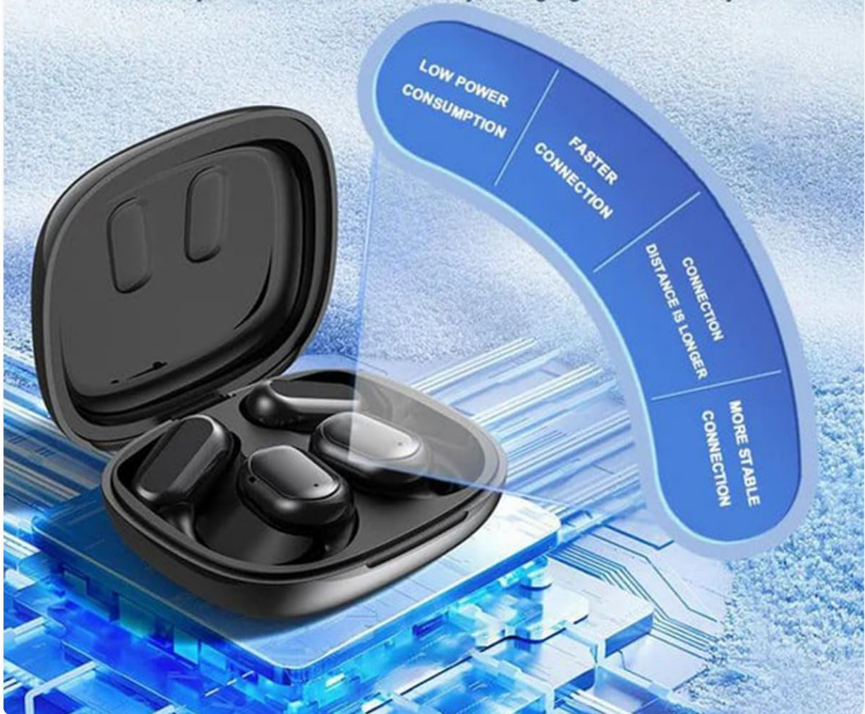
Image: Diagram illustrating the benefits of the Bluetooth 5.4 chip, including low power consumption, faster connection, longer distance, and more stable connection.

Adopting a brand new Bluetooth 5.4 solution, it enhances anti-interference ability and connection stability, bringing more stability