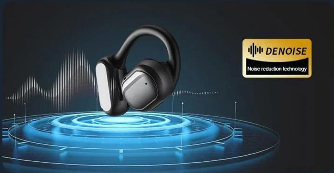
Image: Diagram illustrating the ENC Adaptive Sound / Noise Separation technology, highlighting its ability to provide clear audio by reducing external noise.

Clear sentences like face-to-face conversations