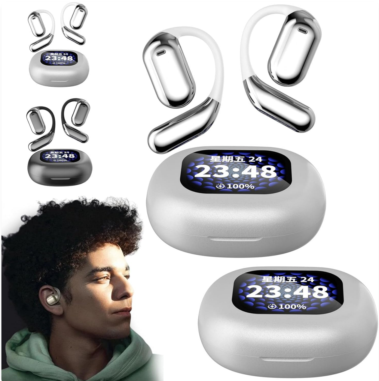
Image: The Intelligent Touch Screen Open Bluetooth Earphones and their charging case, showcasing the sleek design and the

Familiarize yourself with the components of your earphones and charging case.