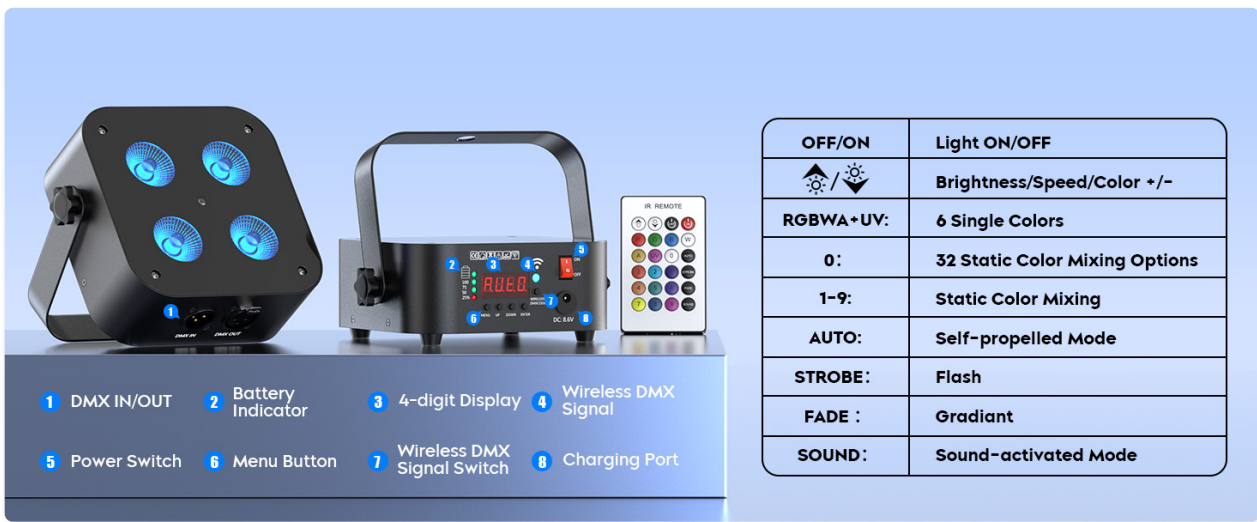
Figure 5.1: Rear panel controls and indicators.