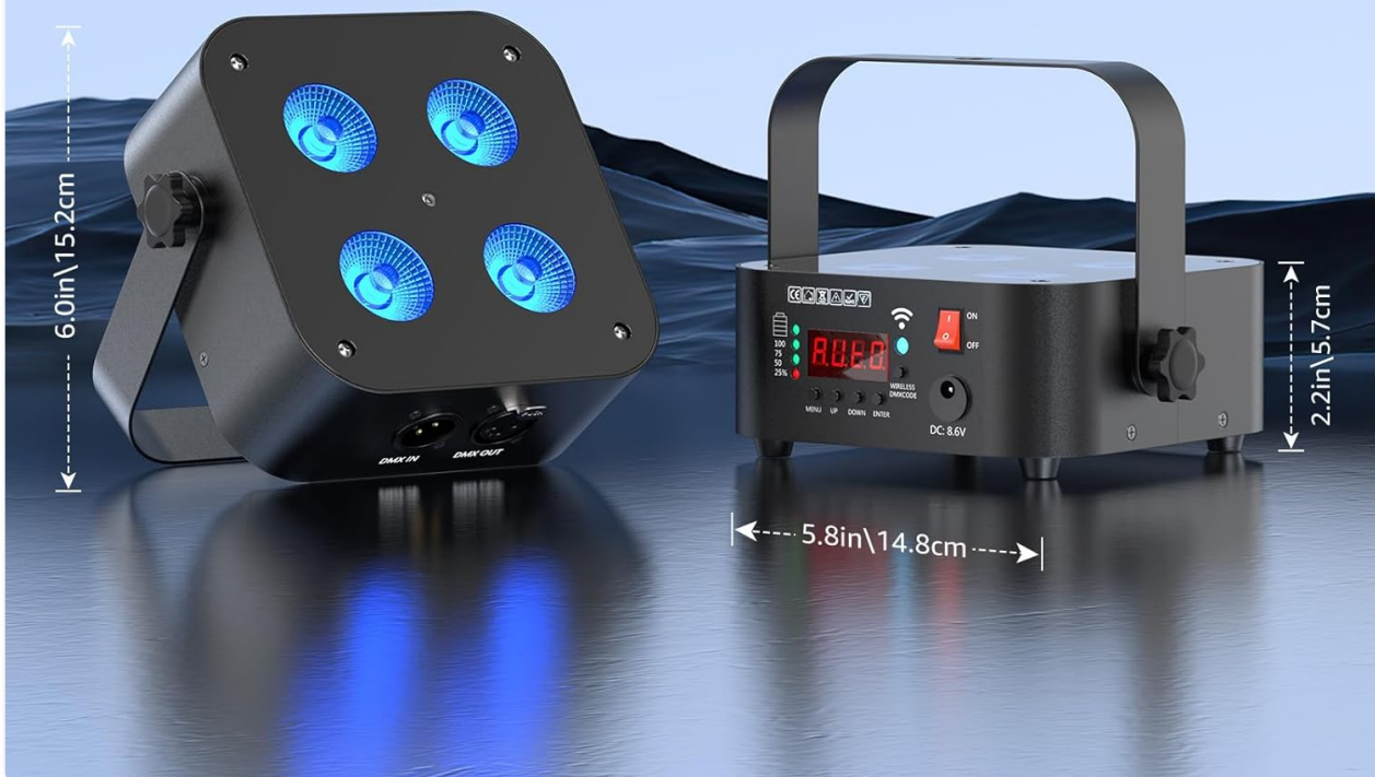
Figure 4.1: The compact size and included bracket allow for easy placement and portability.