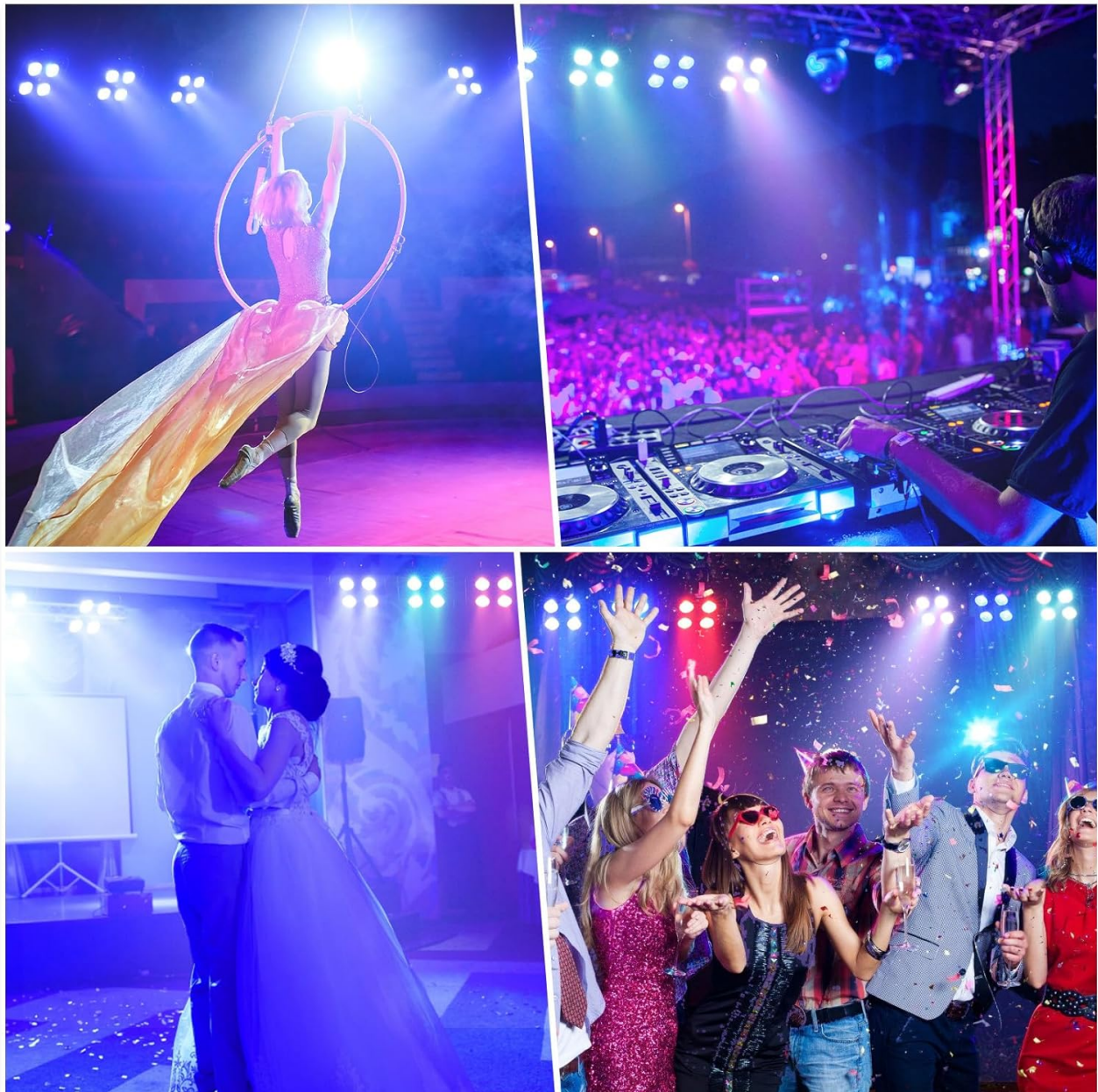
Figure 11.1: Examples of the lights in use at different events.

The DazzlingStage Mini Rechargeable Par Lights are suitable for a variety of applications due to their versatile features and portability.