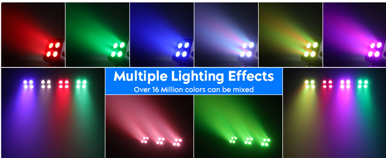
Figure 2.2: The lights offer over 16 million mixable colors for diverse lighting effects.