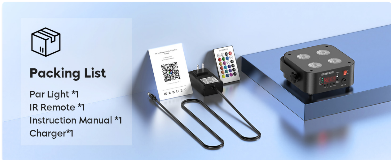
Figure 3.1: Contents included in the product package.