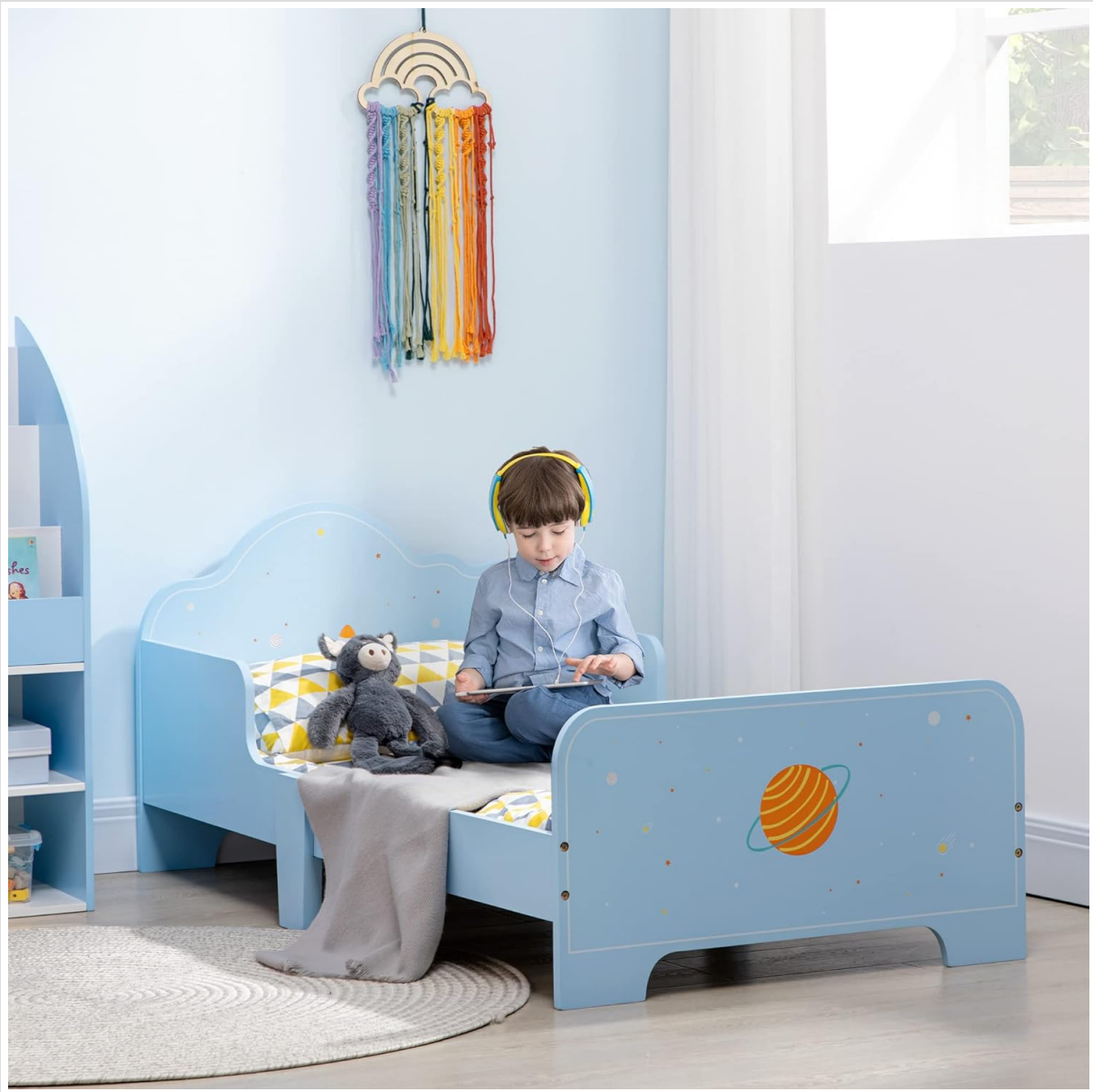
Image 4.1: A child using the bed, illustrating its comfortable and accessible design.