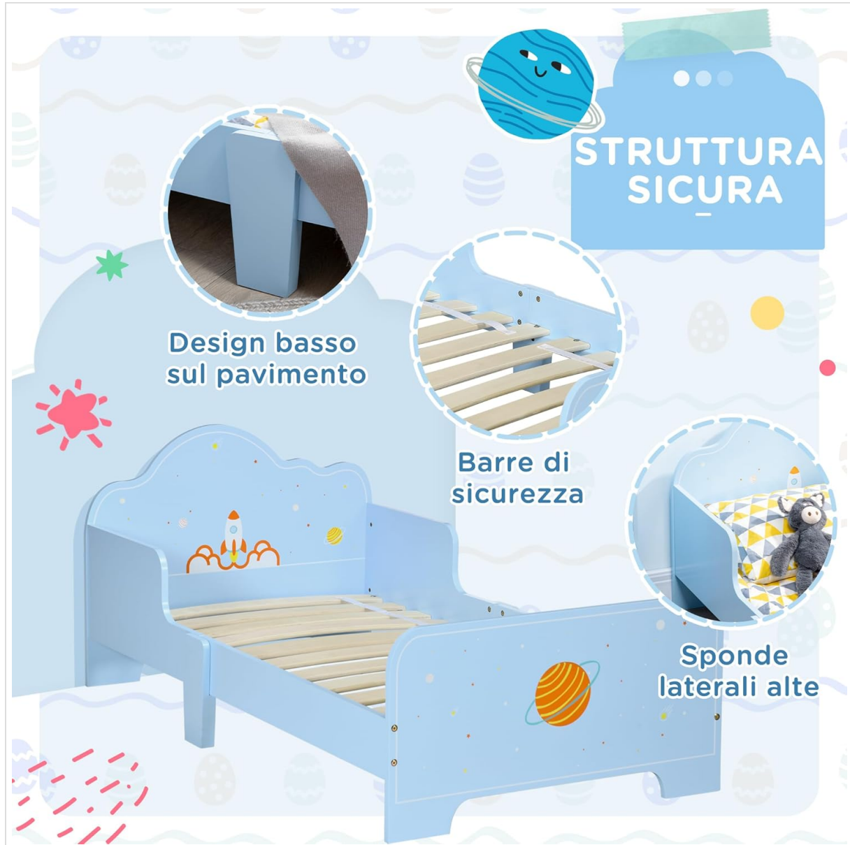
Image 2.1: Key safety features of the bed, highlighting the low design, sturdy slats, and protective side rails.