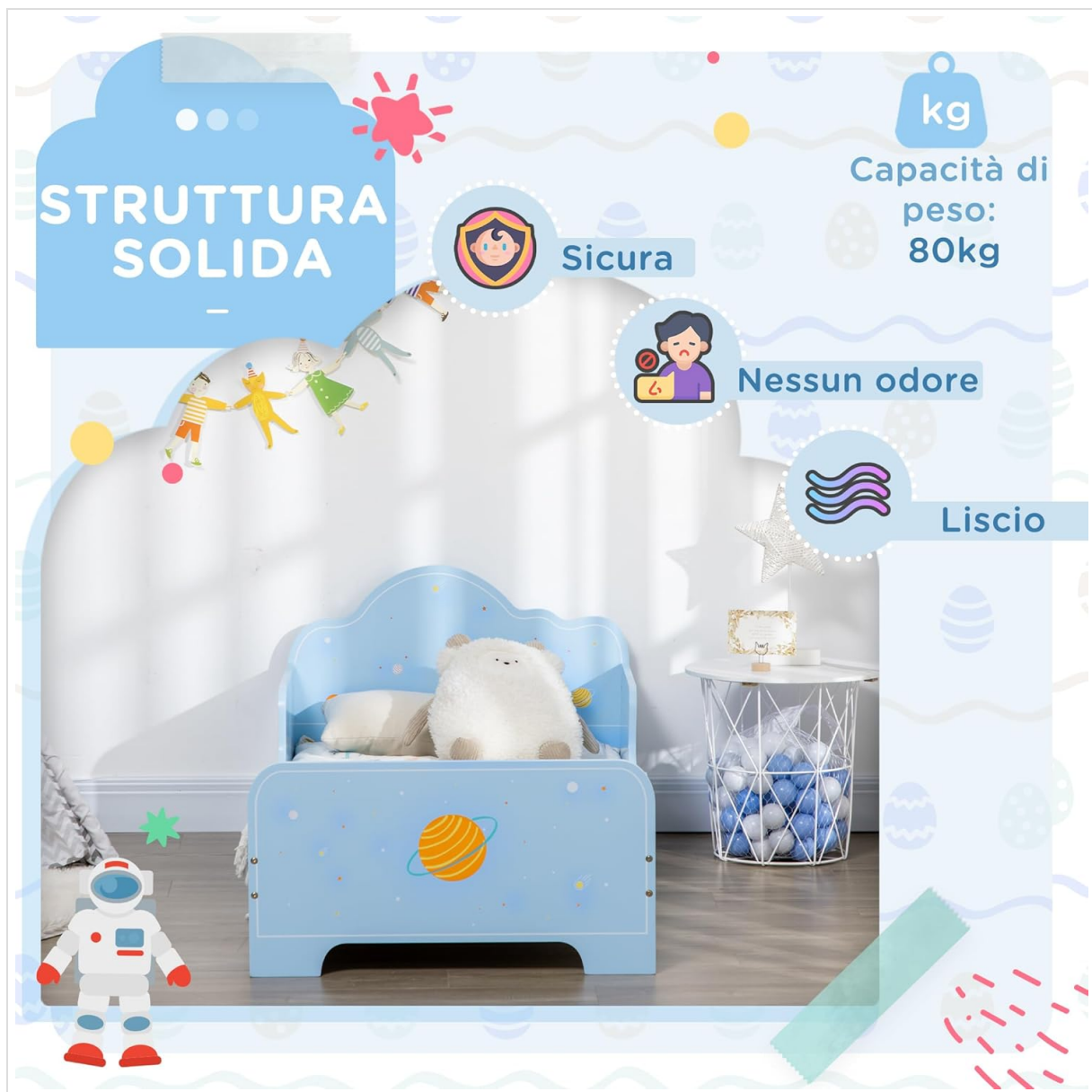
Image 5.1: Visual representation of the bed's solid construction, emphasizing safety, material quality, and weight capacity.