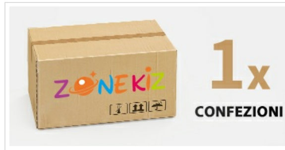
Image 3.1: The product packaging, indicating that the bed comes in one box for assembly.