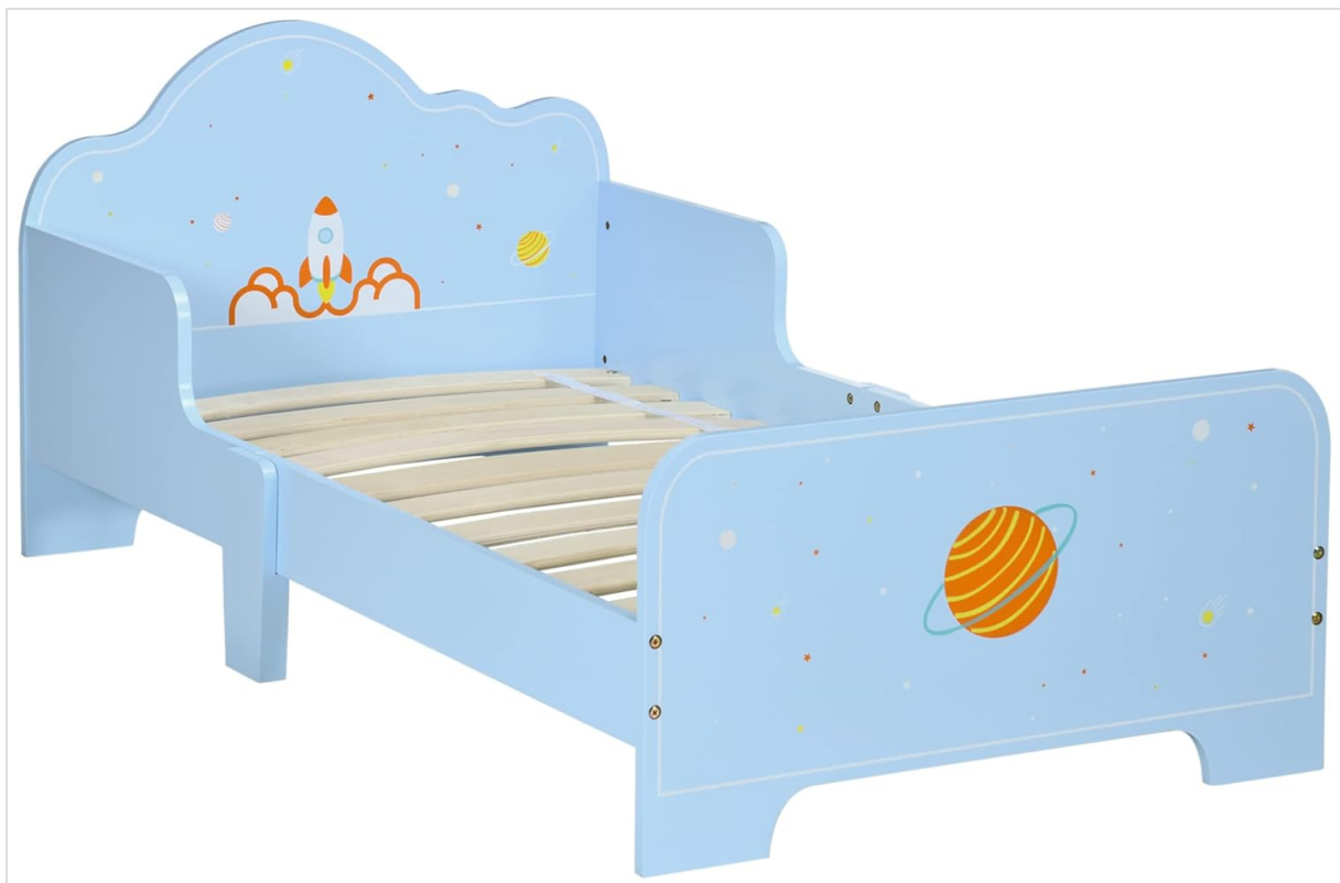
Image 1.1: The ZONEKIZ Children's Bed, showcasing its blue color and space-themed decorations.

This manual provides essential information for the safe assembly, operation, and maintenance of your ZONEKIZ Children's Bed. Please read all instructions carefully before assembly and use, and retain this manual for future reference.