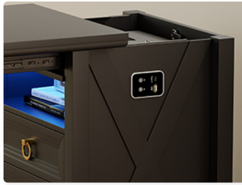
Image 5.6: The interior of the concealed compartment, designed to securely hold items.