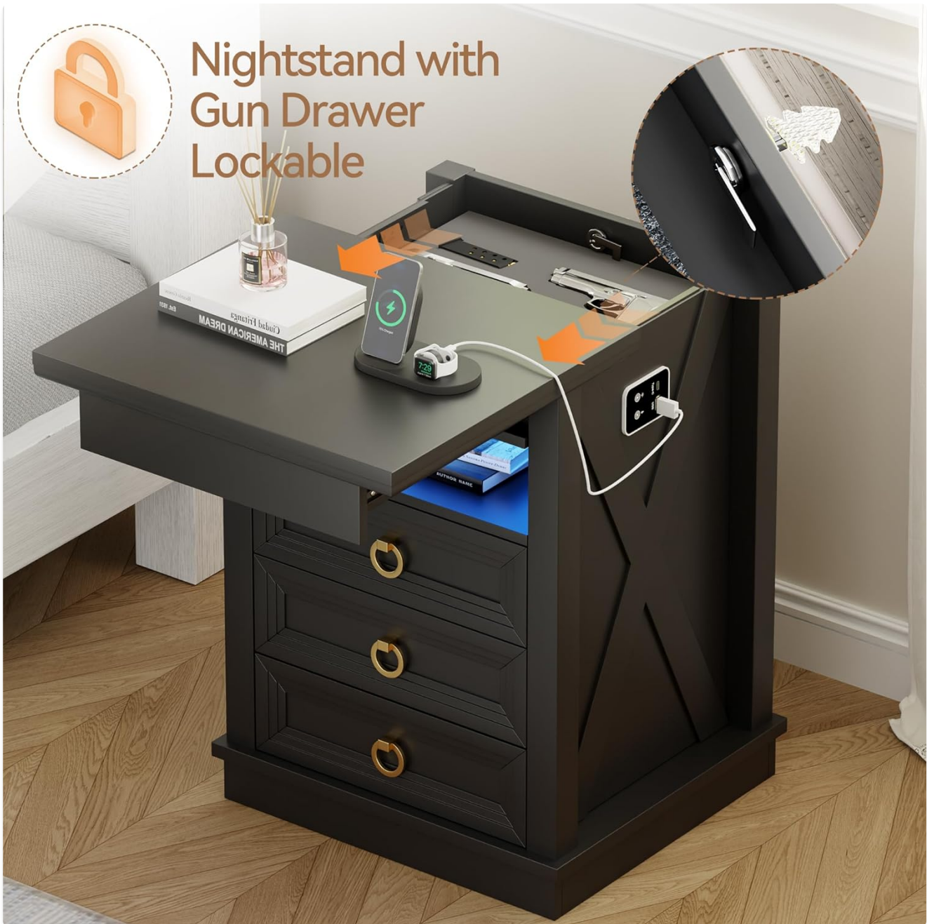
Image 5.4: The nightstand with its top panel slid open, revealing the concealed gun drawer. The lock mechanism is visible at the back.