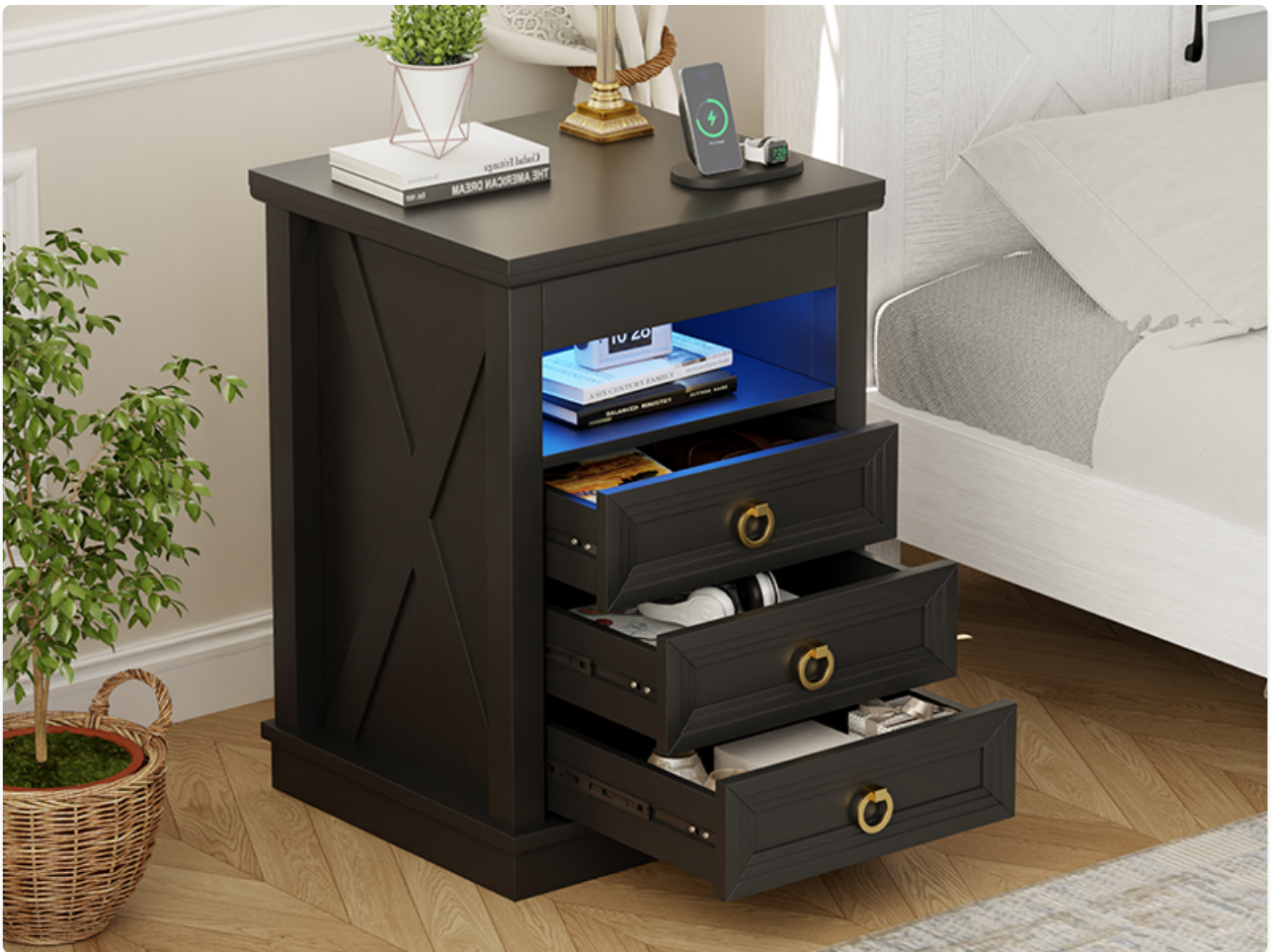
Image 4.4: Final assembly of the LED lighting and top panel. Ensure the LED strip is properly secured.