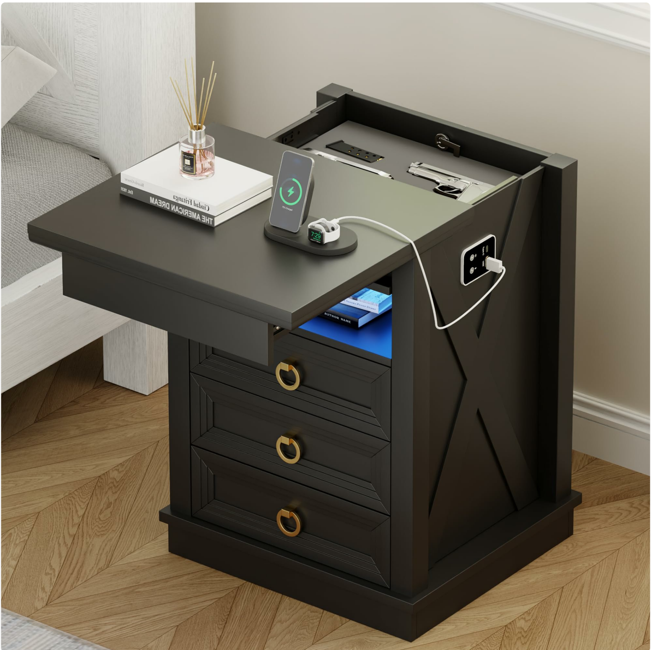
Image 1.1: The Lvifur Farmhouse Nightstand Model 91098Black in black finish.