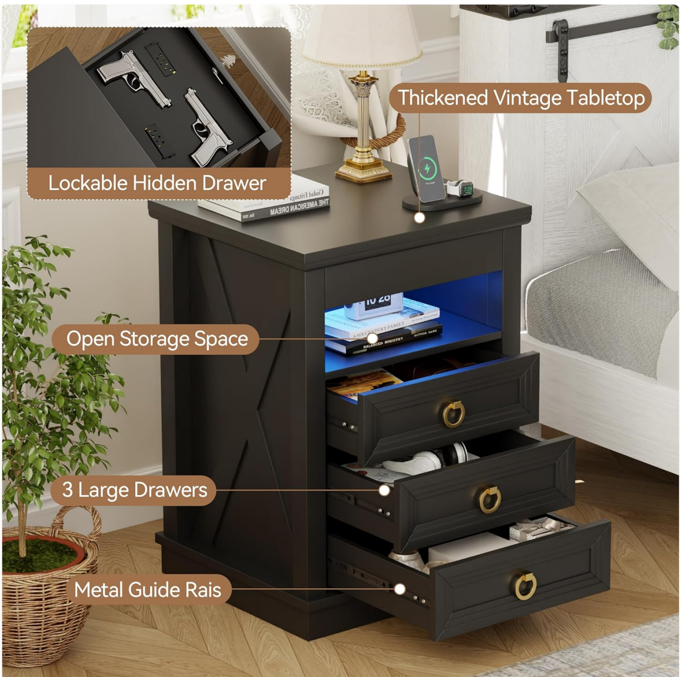
Image 5.7: The nightstand with its three bottom drawers and open shelf, showcasing ample storage options.