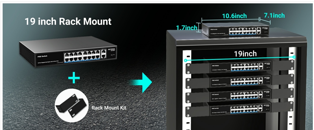
Figure 3.3: Rack Mounting the Switch.