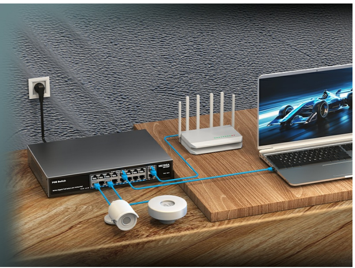
Figure 3.2: Power over Ethernet (PoE) Connection Example.

Automatically Detect and Supply Power with Those IEEE 802.3af/at Compliant Powered Devices(PDs).