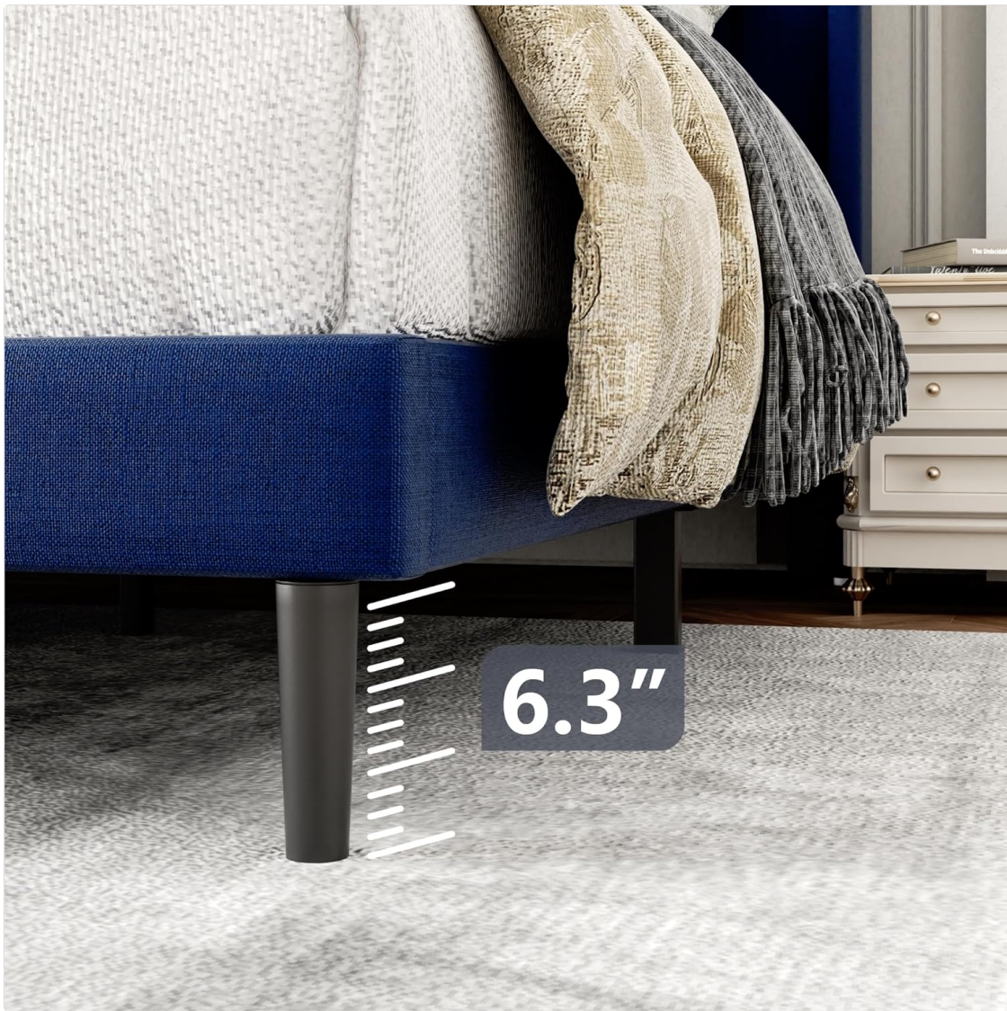
Figure 7.1: Detail of the bed leg, illustrating the 6.3-inch clearance from the ground.