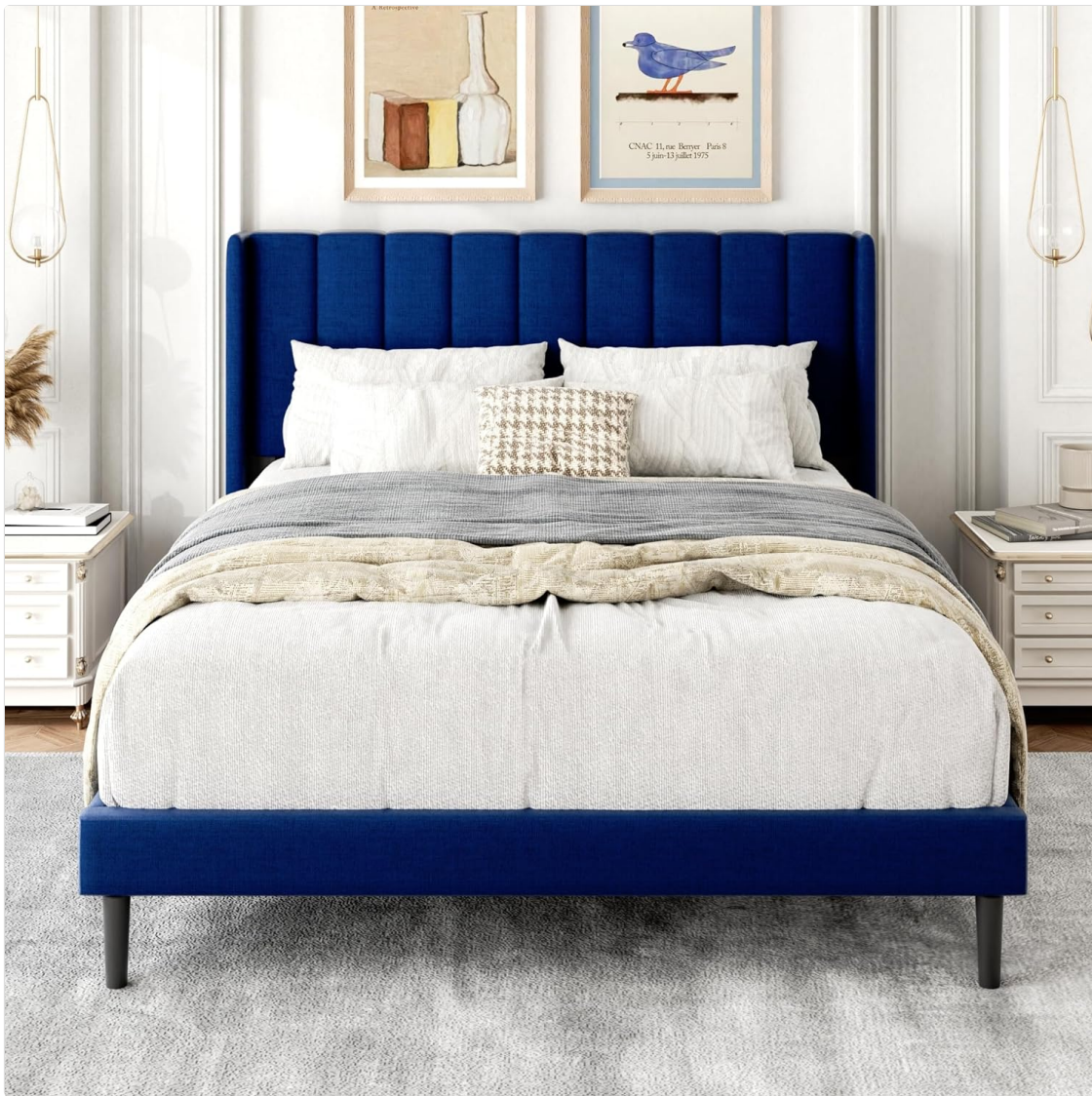
Figure 3.2: The fully assembled Gruwans Full Size Bed Frame, ready for mattress placement.