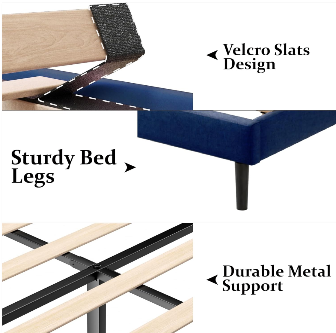
Figure 2.1: Illustration of key components: Velcro slats for easy installation, sturdy bed legs for stability, and durable metal support for enhanced strength.