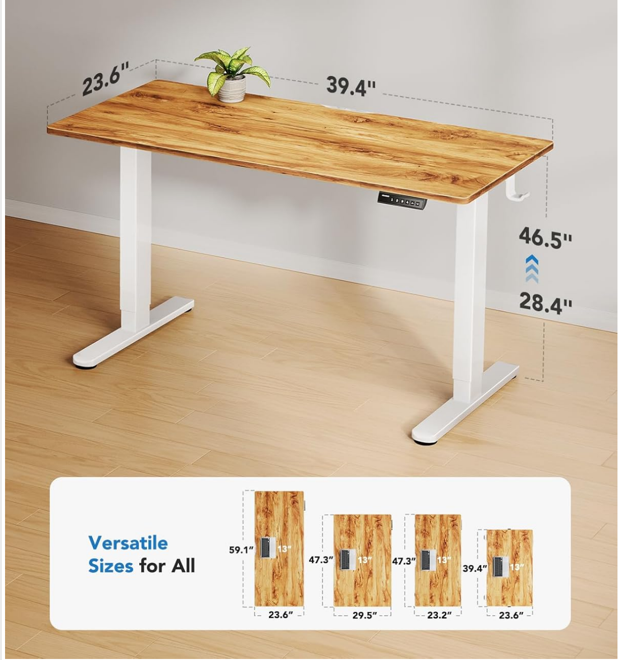
Figure 5: Desk Dimensions and adjustable height range.