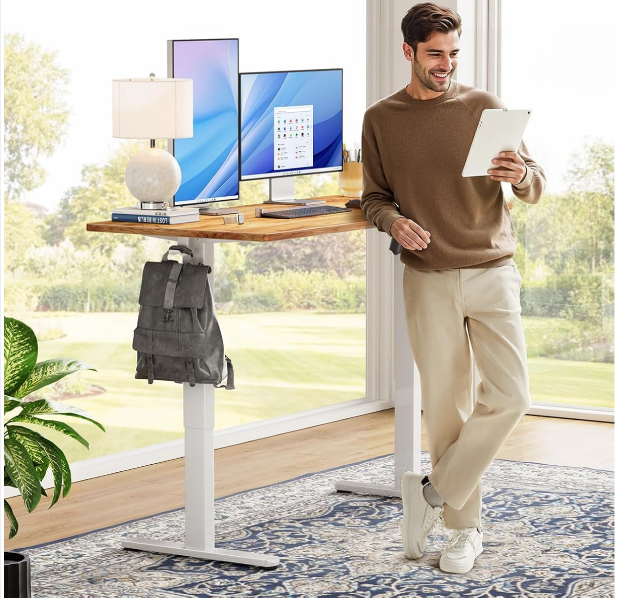
Figure 6: The desk supports a maximum weight capacity of 176 lbs.